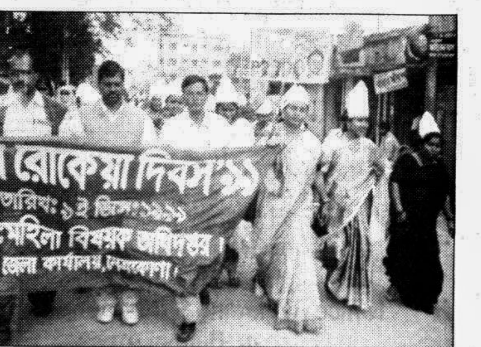
A colourful rally was brought out in Netrakona town on the occasion of Begum Rokeya Day. Women Affairs Department organised the rally.