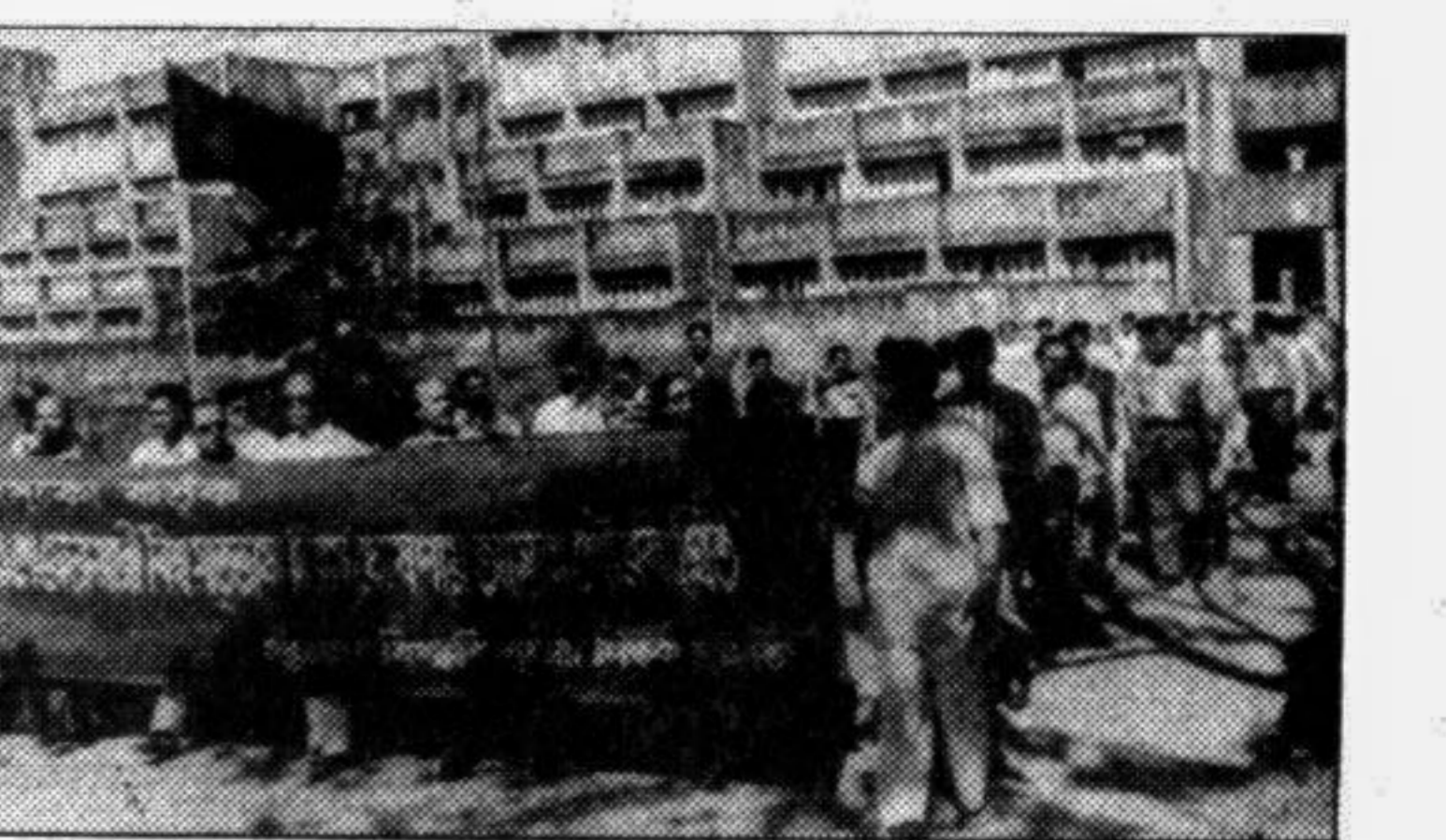
Chittagong University Teachers' Association (CUTA) organised a colourful procession on the university campus to celebrate the UNESCO declaration on International Mother Tongue Day.