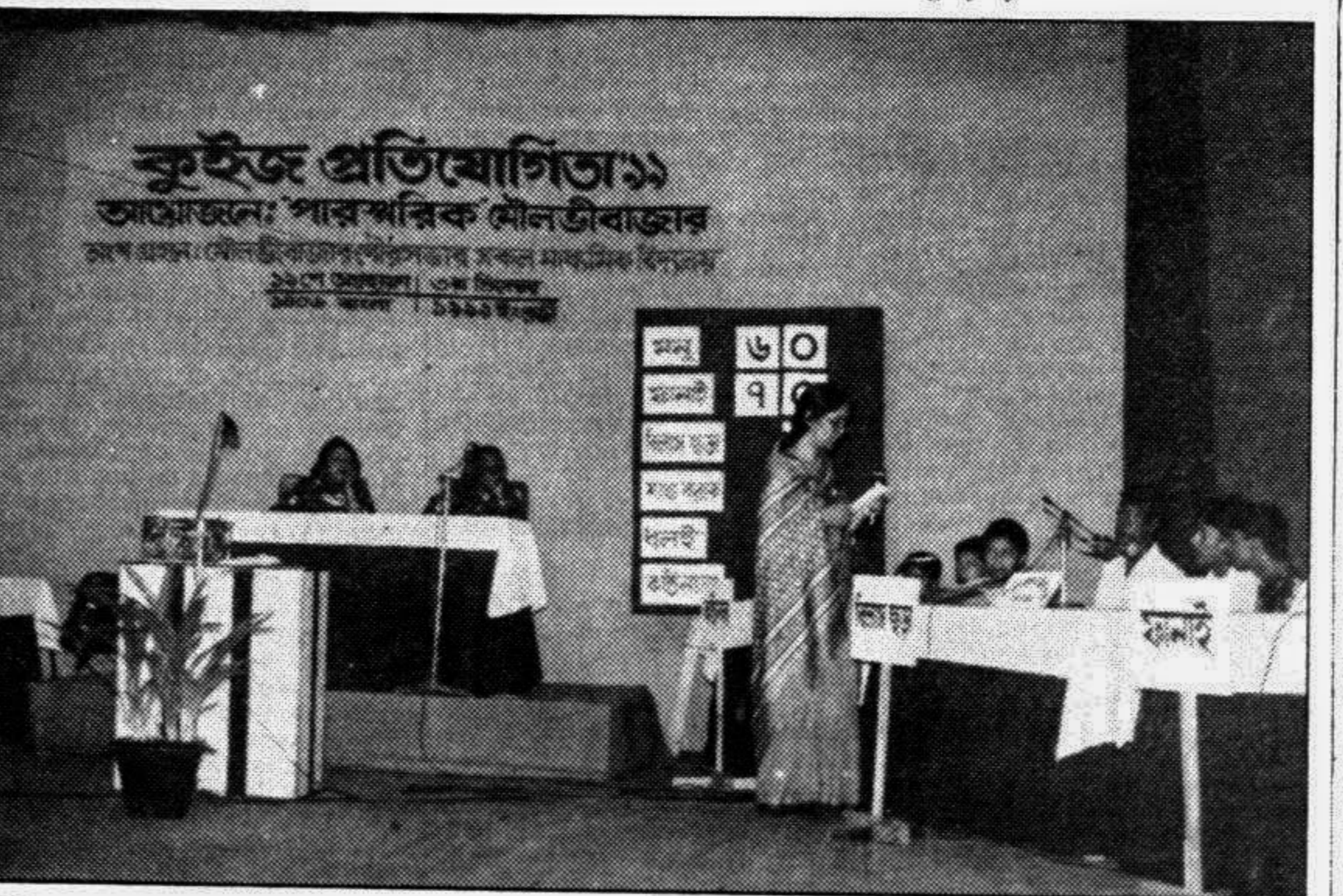
Quiz competition progressing at Saifur Rahman Auditorium in Moulvibazar.

Such programme was lauded highly by the audience.