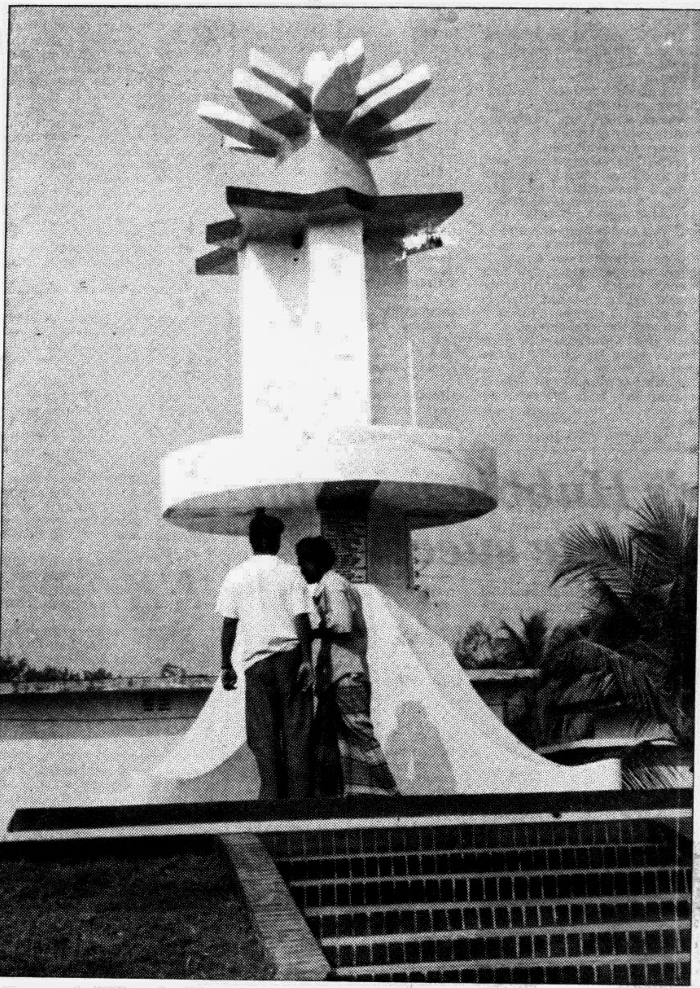
Monument of Liberation War martyrs.