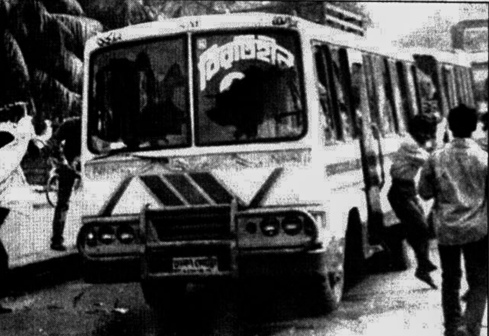
Supporters of Bangabir Kader Siddiqui go on rampage yesterday damaging buses and other vehicles in front of Engineers Institution after the news of attack on his convention spread far and wide.