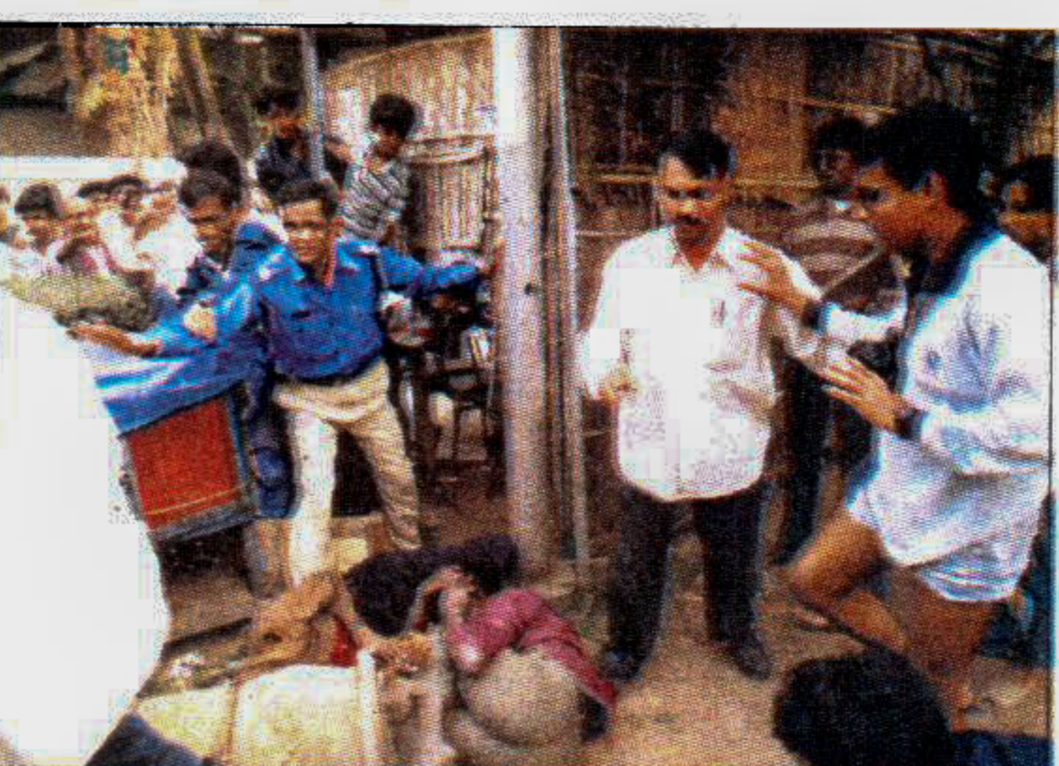
Crime and punishment A police officer tries in vain to shield two muggers from the wrath of DU students after they were caught in the act. (Story on page 12)