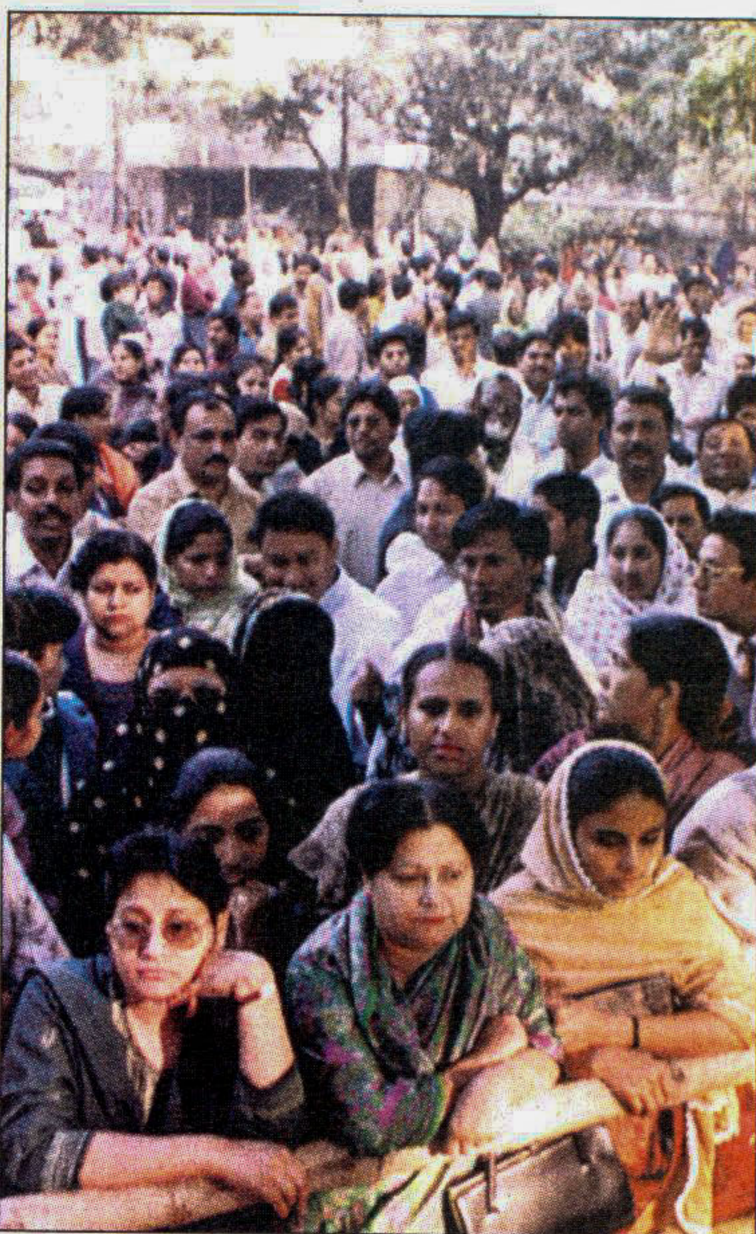
Testing time: Parents wait anxiously as their children go through school admission tests at Viqarunnisa Noon School yesterday.

"Why do you need a telescope to see it? It's all clear and bright."