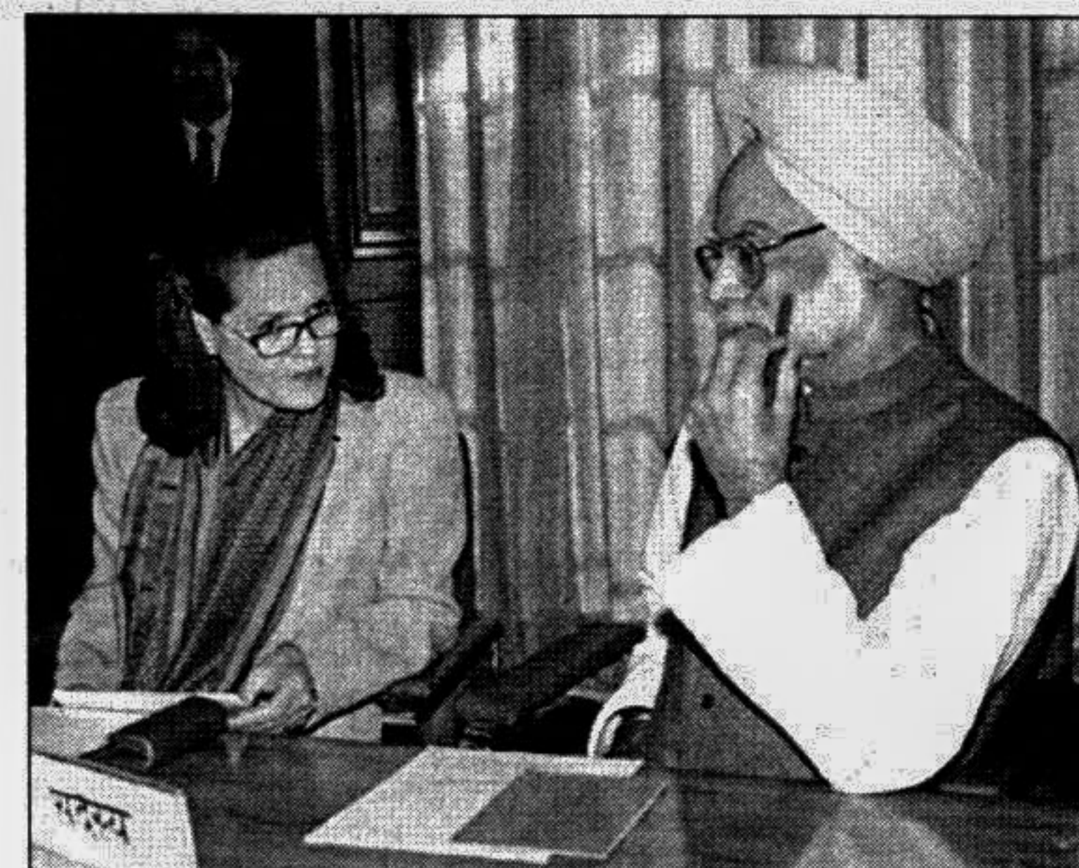
India's main opposition party leader and Congress President Sonia Gandhi (L) talks with senior Congress Party leader Manmohan Singh at an all party meeting in Parliament House yesterday.

A quota for women in federal and state assemblies was first mooted in 1996 but opposed by conservative male MPs.