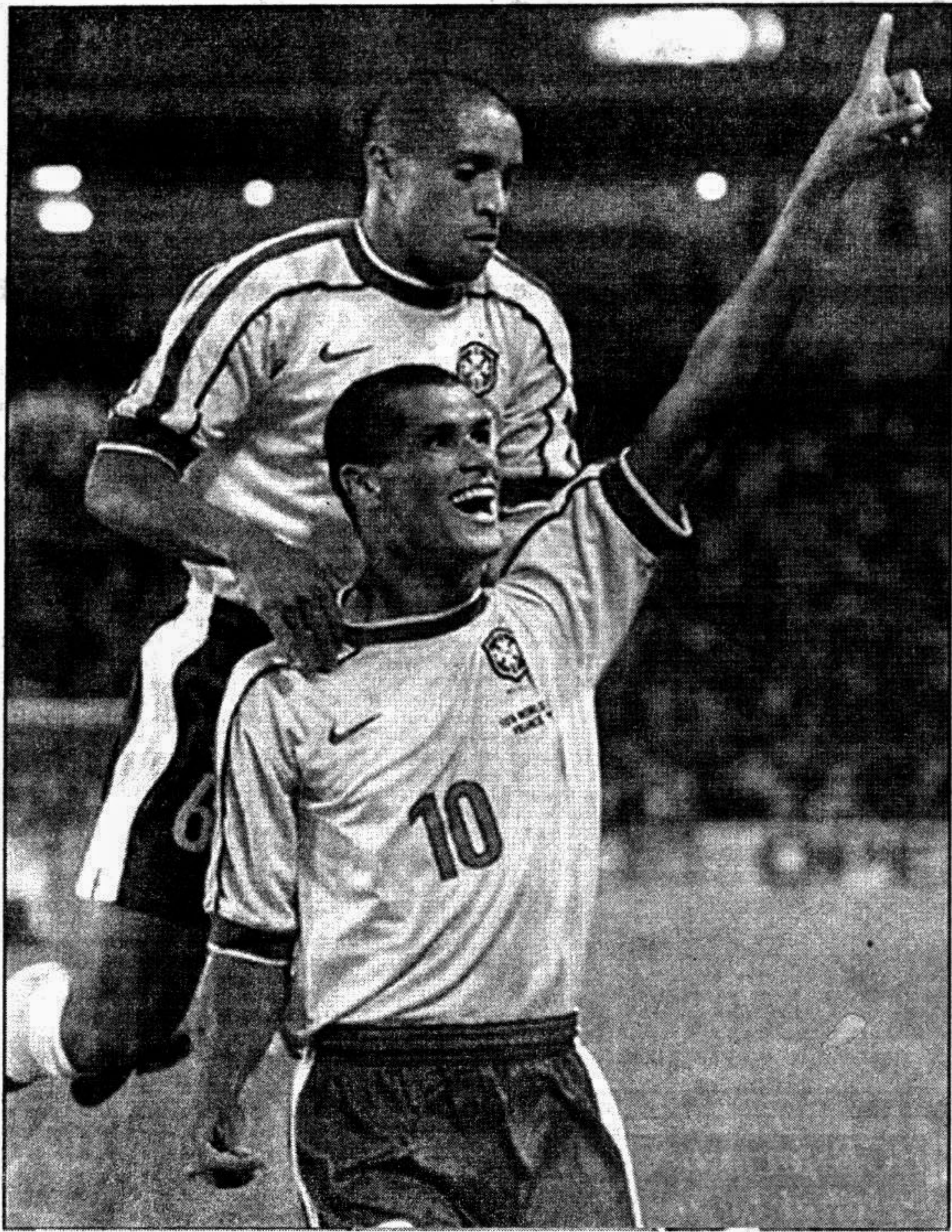
An AFP file photo of Brazilian and European-player-of-the-year Rivaldo celebrating with teammate Roberto Carlos during the 1998 World Cup.