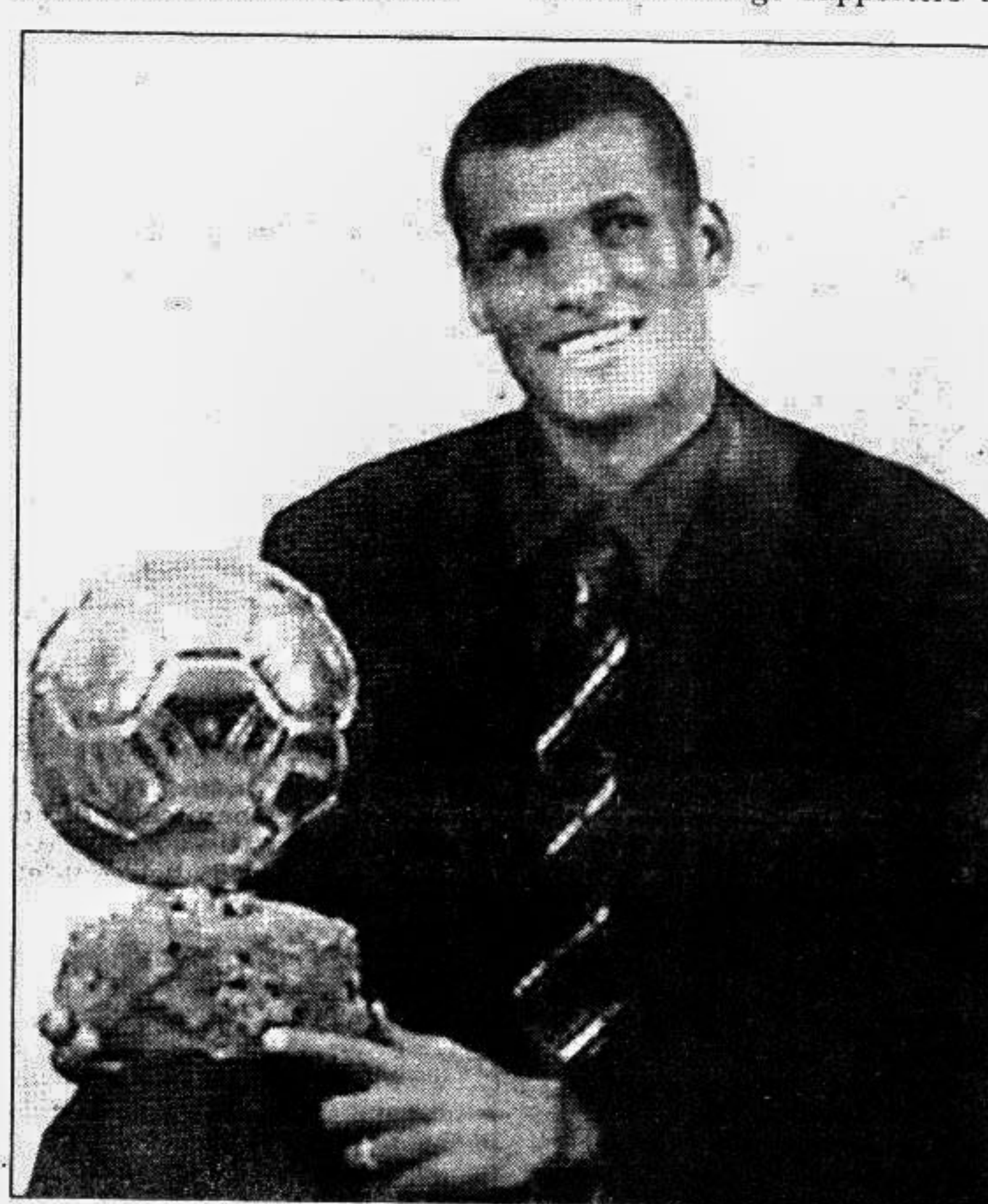
Rivaldo with the Golden Ball.

1999: Voted European player-of-the-year by France Football Magazine.