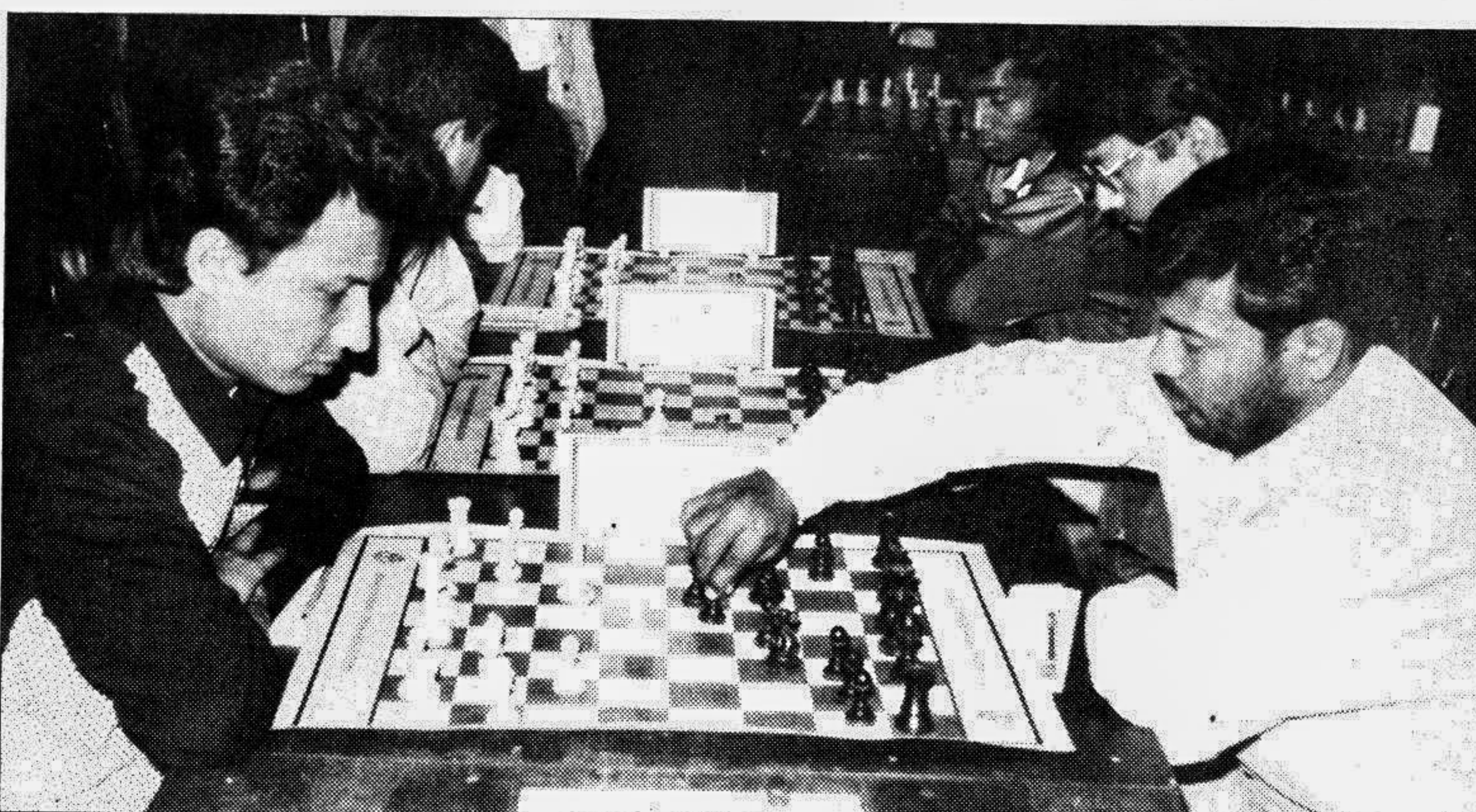
Scene from the Prime Bank international rating chess competition yesterday.