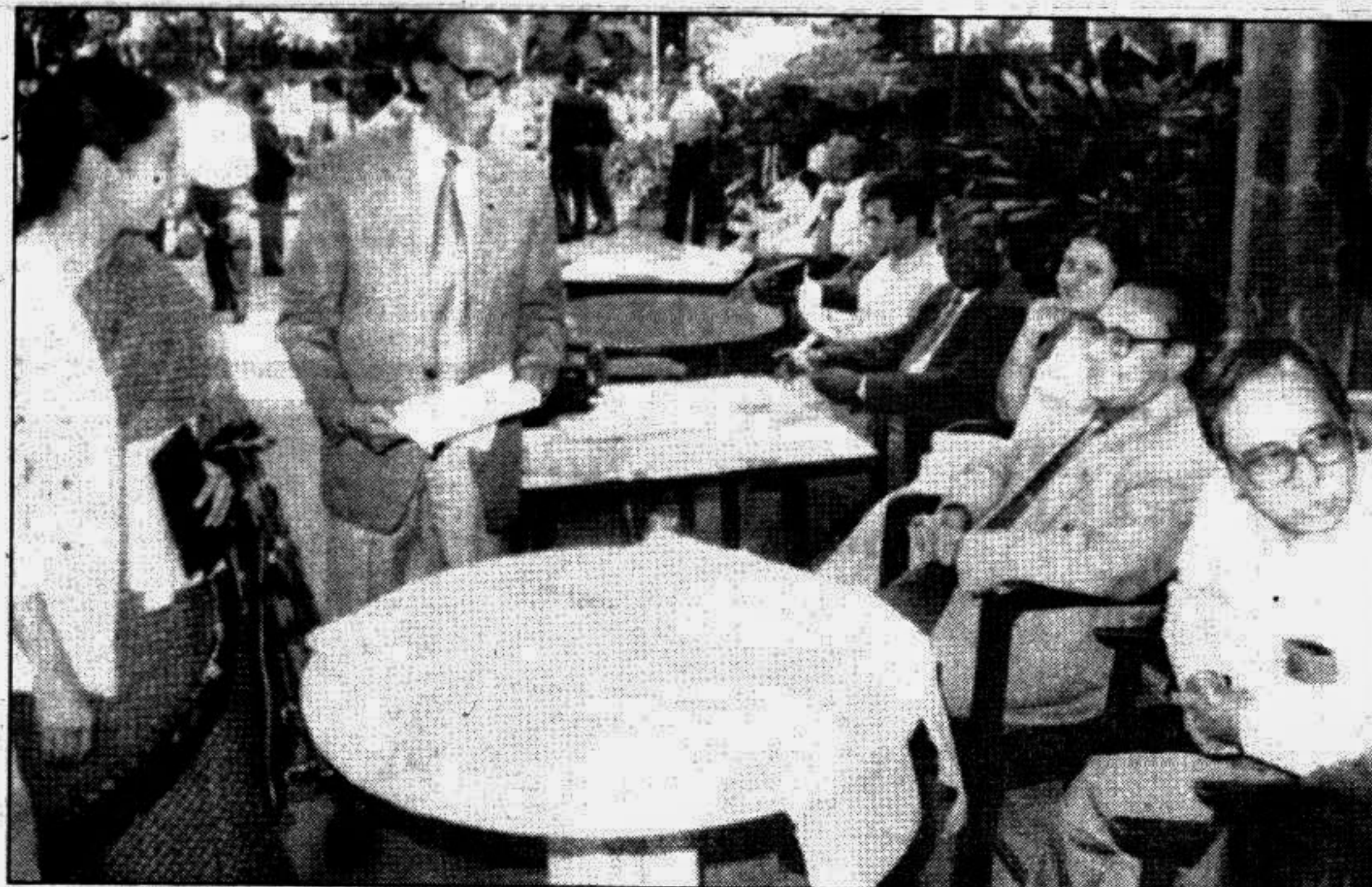
The election of Dhaka University Teachers Association (DUTA) began at the University Officers' Club yesterday. Active supporters of different panels eagerly await the arrival of voters there.

The committee has requested all to attend the programmes on time.