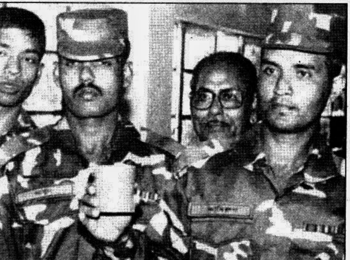
The explosive expert team of Bangladesh Army picked up a fake bomb from the Dhaka University Examination Hall No 4 yesterday that created a great sensation and panic on the entire university campus. In fact, it was a container of condensed milk filled with sands and pebbles.

In his inaugural address, Jyoti Basu underlined the need for regional and sub-regional cooperation among the South Asian nations for rapid economic development.