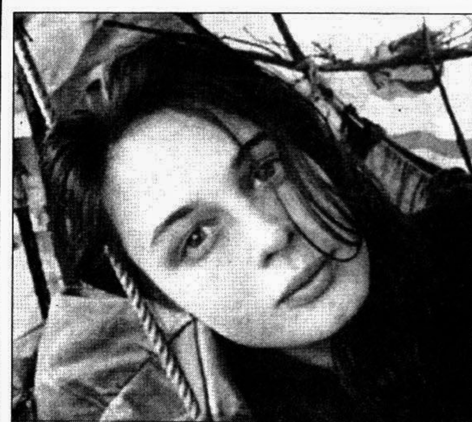
AFP file photo of Julia "Butterfly" Hill atop a Redwood tree in the Headwater Forest (northern California) in 1998.

Meanwhile, all the dormitories of the university except women's halls were vacated before 10 am today.