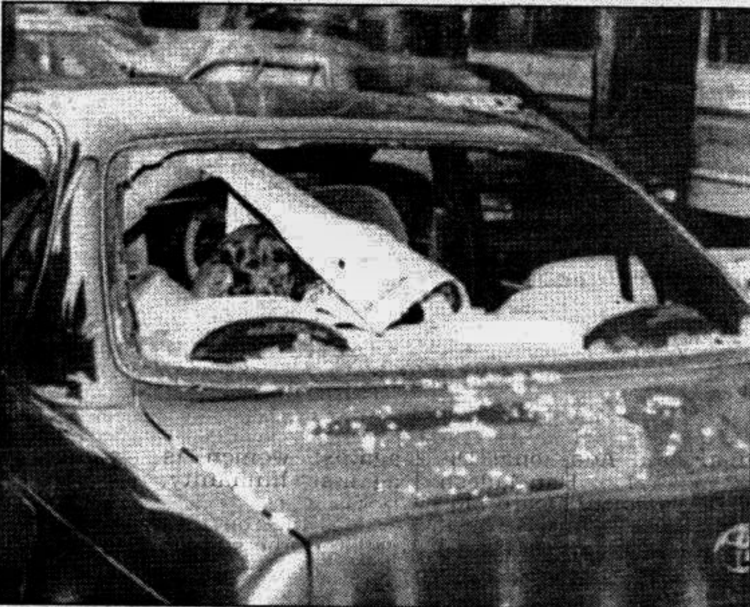
The unruly activists of Jatiyatabadi Chhatra Dal (JCD) vent their spleen by damaging vehicles at city's Bijoyagar area during a protest rally yesterday.