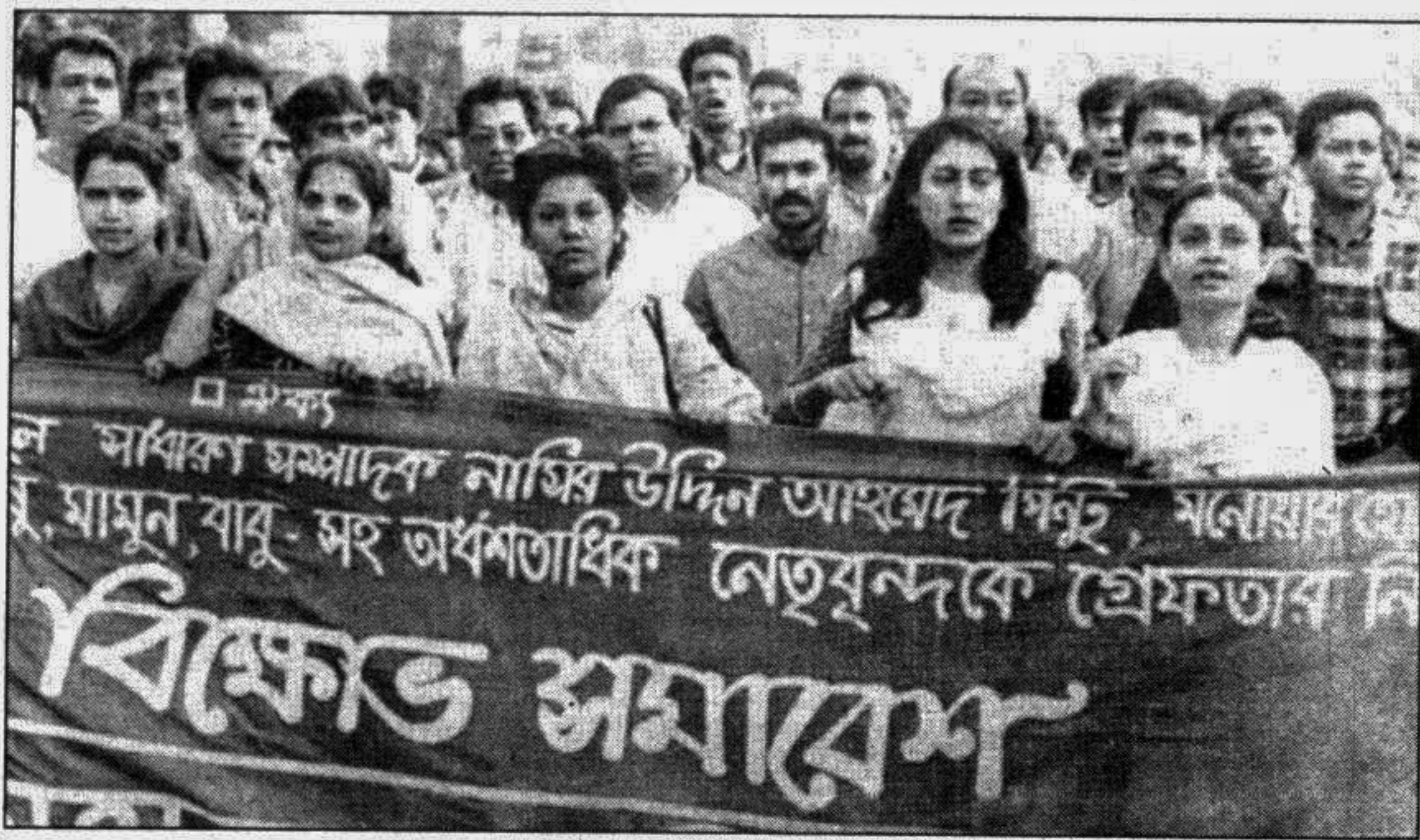
Jatiyatabadi Chhatra Dal (JCD) brought out a procession in the city yesterday protesting the arrest of its activists and police attack on its procession.