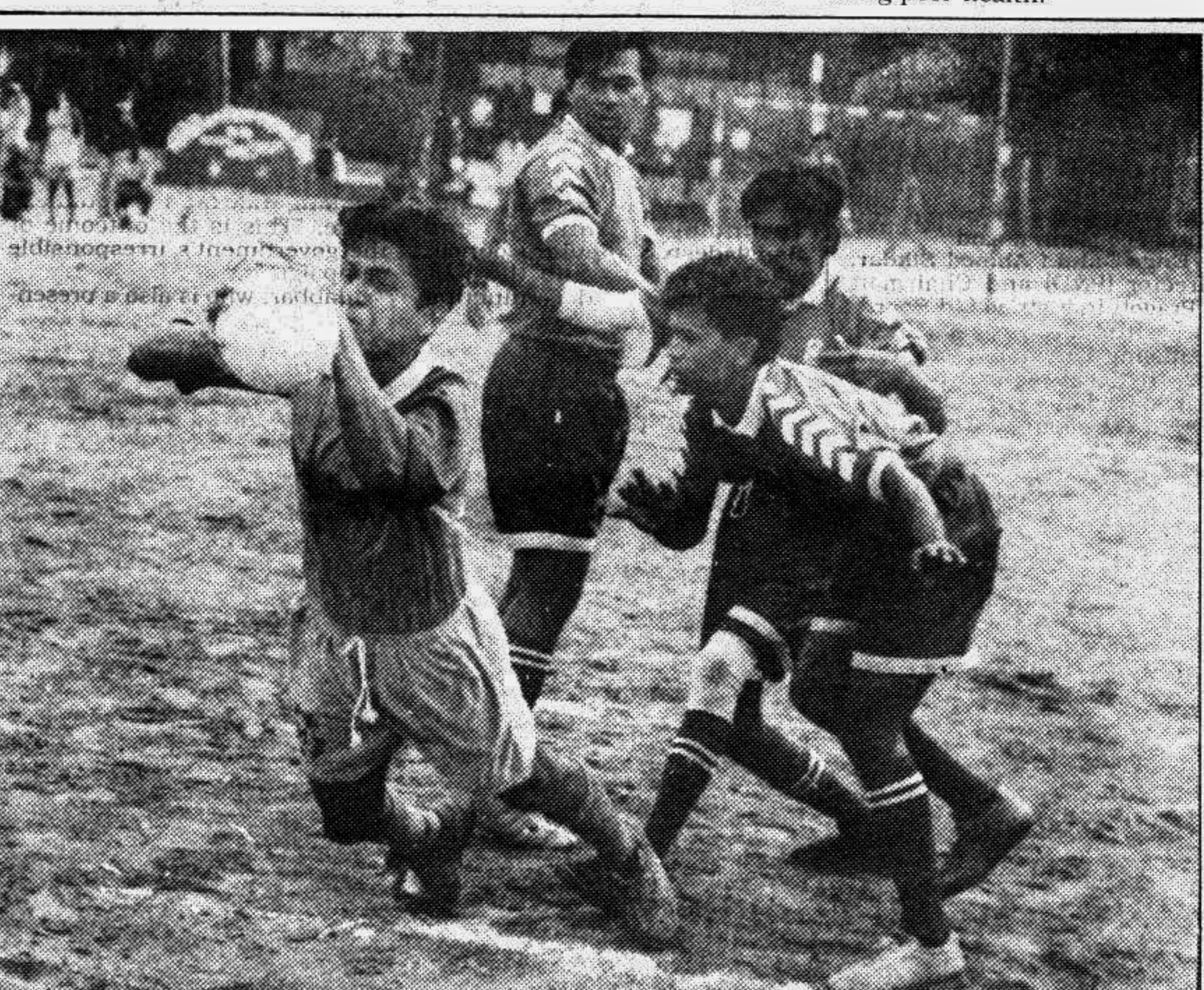
Scene from yesterday's Cute First Division handball league match between West Jatrabari Krira Sangha and Mansur Sporting at the court near Bangabandhu National Stadium.