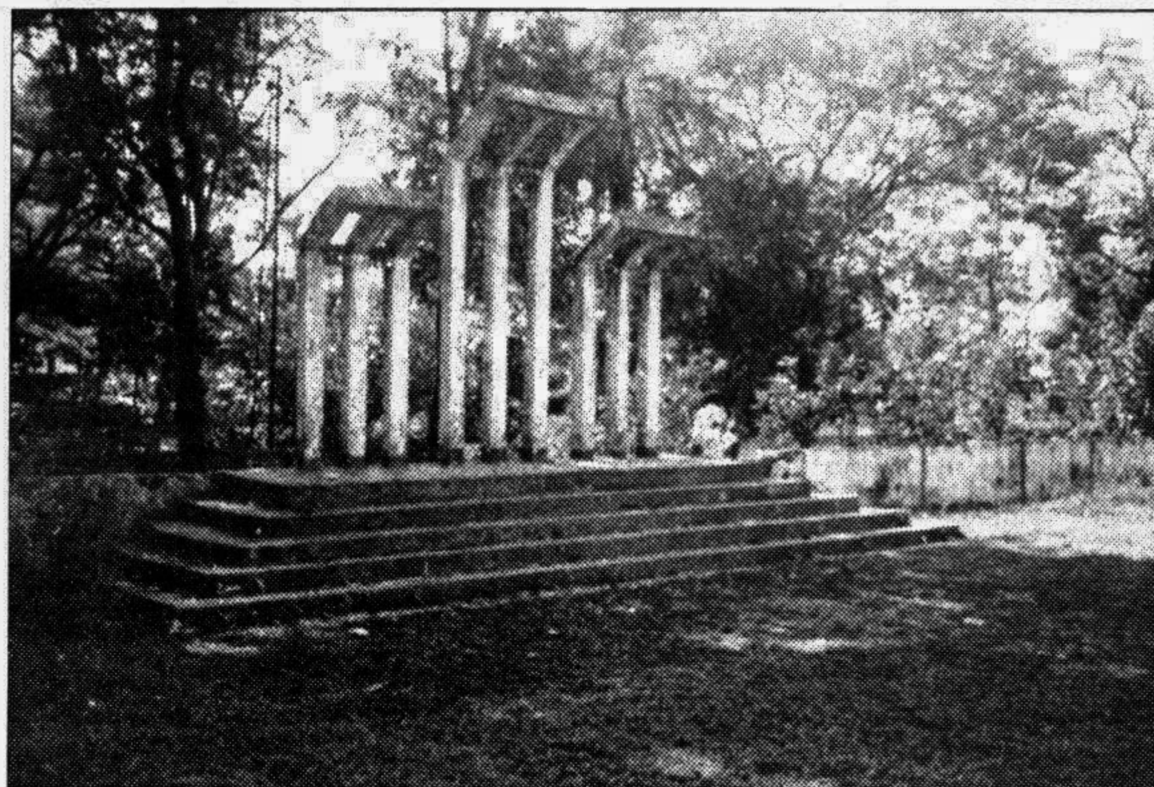
The Central Shaheed Minar of Moulvibazar where more than 100 freedom fighters are buried. They died in a mine explosion on December 20, 1971.