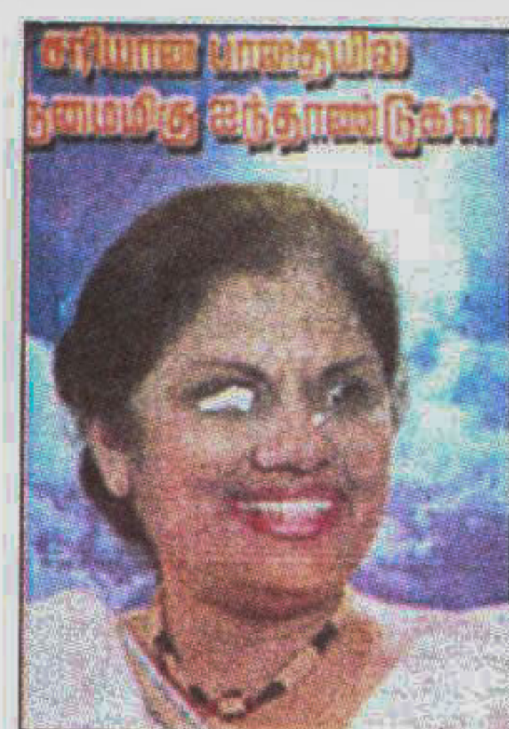
A vandalised poster of Chandrika, snapped on the day of the assassination attempt.

The attack was similar to the one in 1991, when Rajiv Gandhi was assassinated as he was winding up an election campaign in southern India during a comeback bid. A woman tried to touch his feet See page 11 col 6