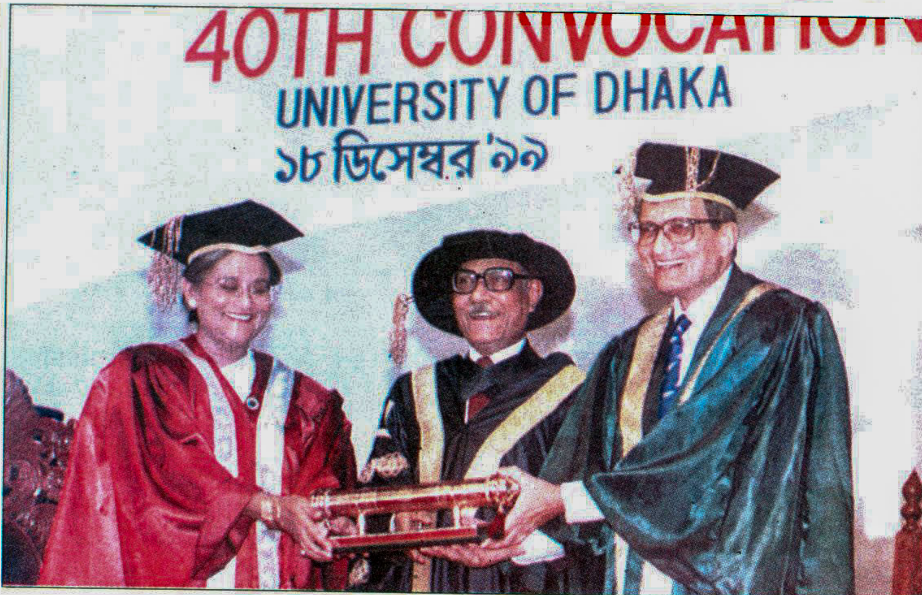
The two celebrated recipients of the honorary degrees pose for photo with the Dhaka University Chancellor, President Shahabuddin Ahmed, in the middle. Sheikh Hasina's is a doctorate of law and Amartya Sen's a doctorate of science.