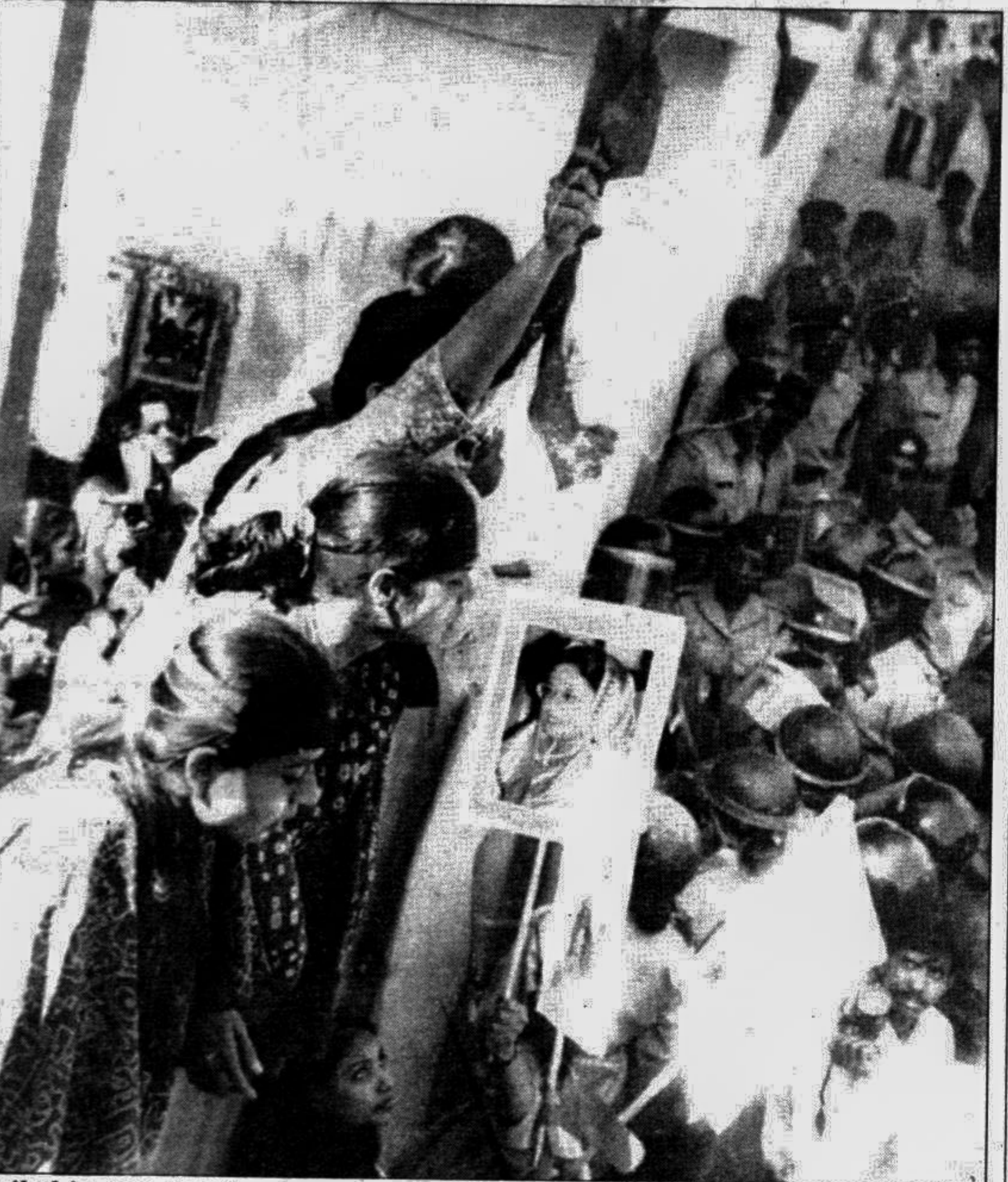
Exiled in own territory All the gates to the DU dormitories closed and entry to the campus restricted, it was an uneasy situation for students and others as the convocation went on yesterday. It all drew angry protests from activists opposing the honour to Sheikh Hasina, which led the authorities to restrict their movement and attempts to bring out processions on the campus. The photo shows the protesting pro-BNP female students, locked inside the Rokeya Hall, try to defy the restriction and wave black flags wearing black bands. A large posse of cops watch when ruling party activists ridicule their confined counterparts from the other side of the gate. The question that came in public mind was: why some students were let in and others not?