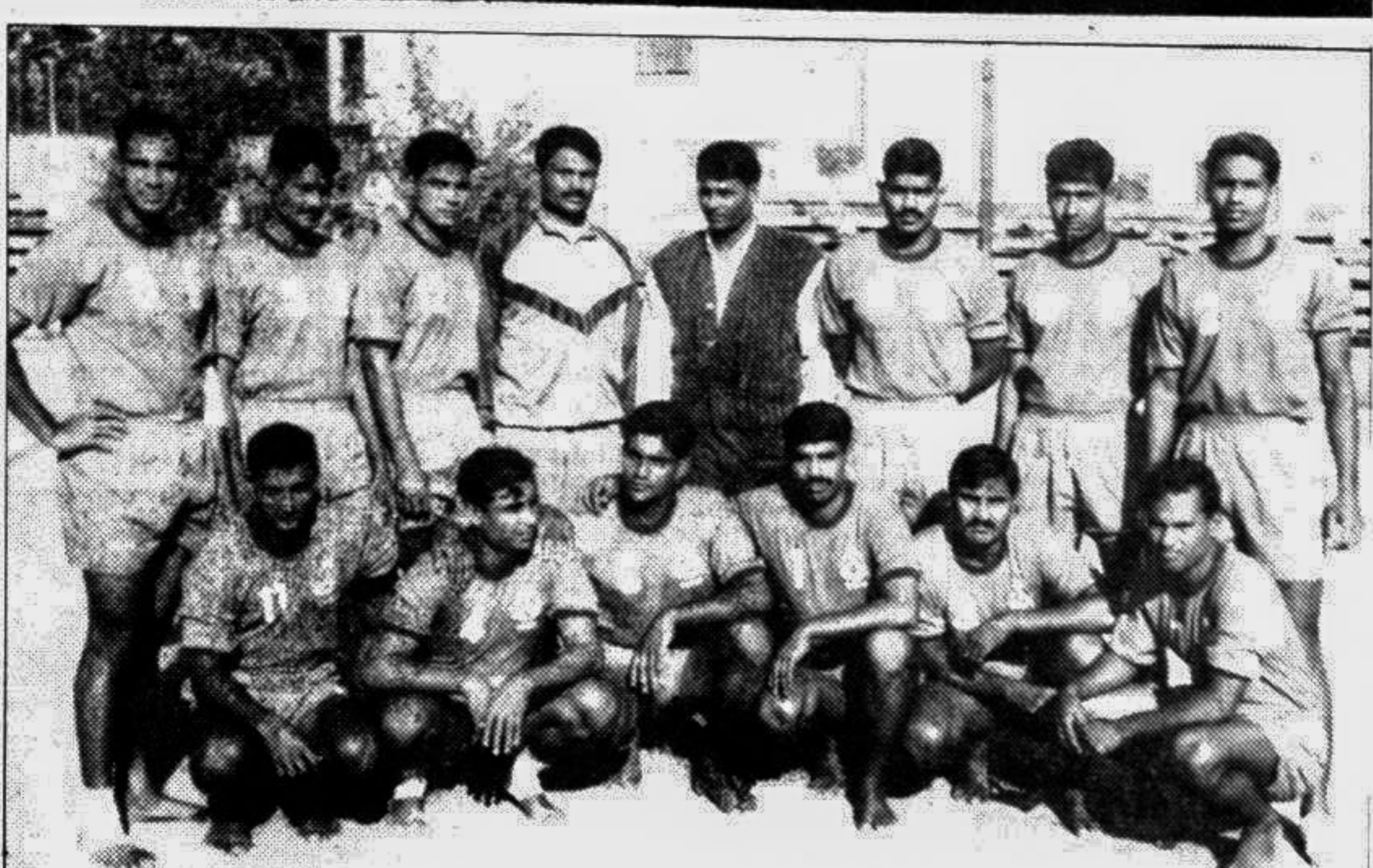
Players and officials of Bangladesh Rifles team who clinched Victory Day kabadi title.