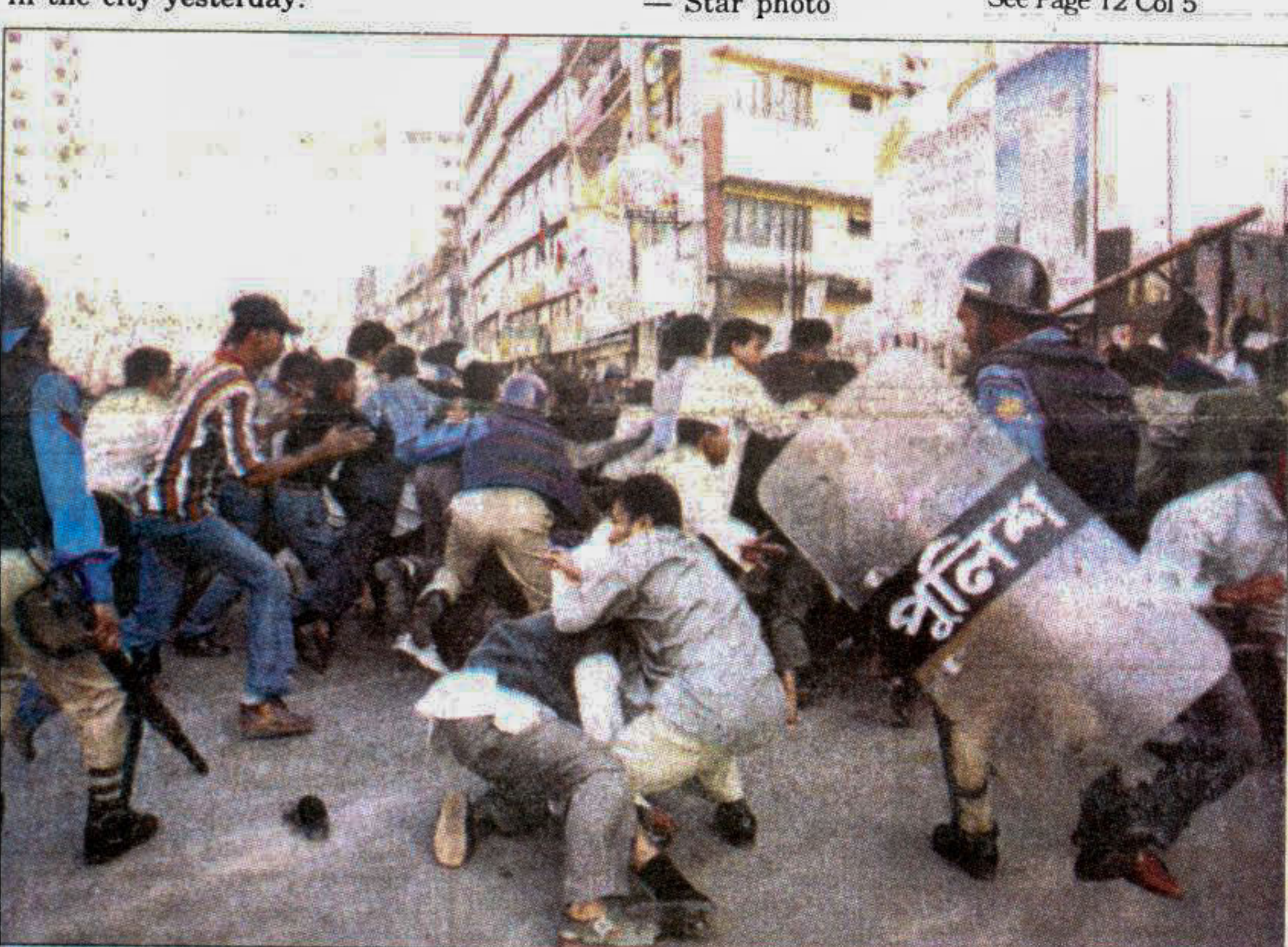
Police club JCD men in a procession near Naya Paltan yesterday.