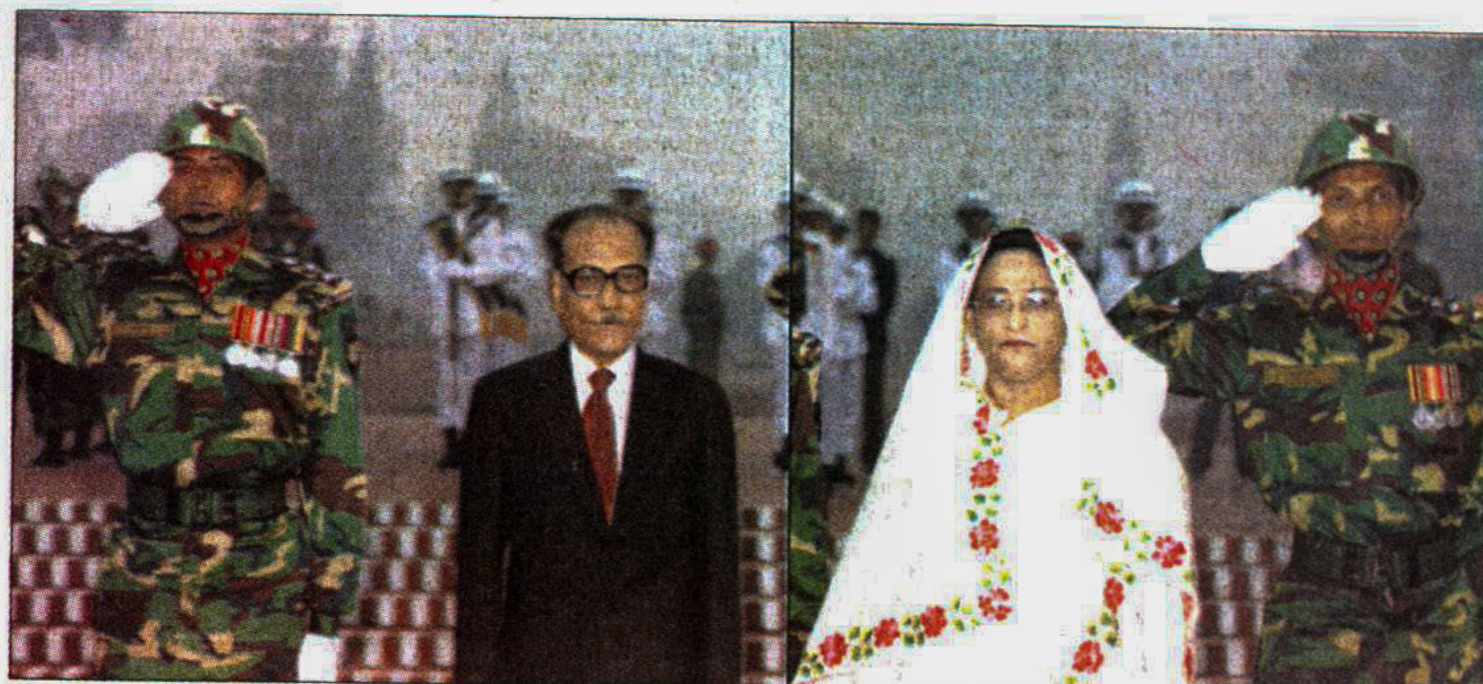
President Shahabuddin Ahmed and Prime Minister Sheikh Hasina stand in solemn silence after placing wreaths at the National Mausoleum at Savar on the Victory Day.

An official said the fire was fully extinguished at about 11:30 pm.