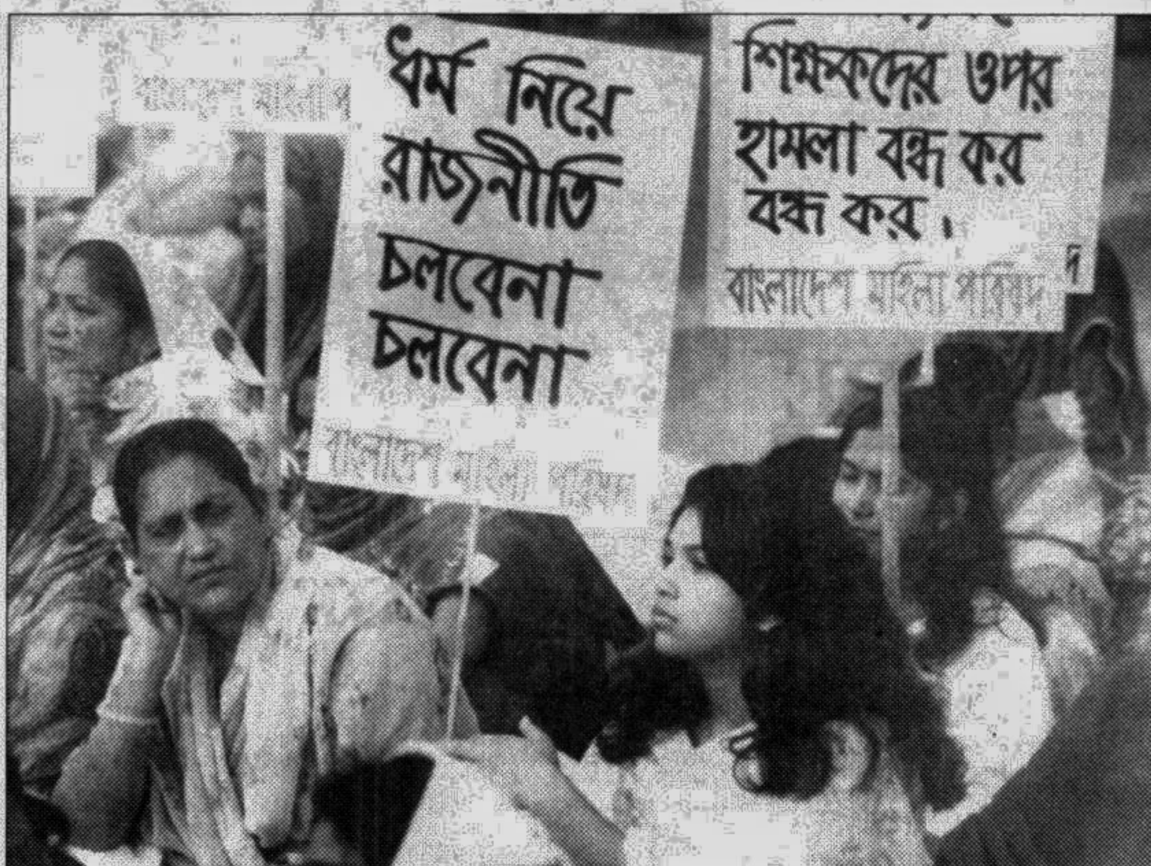
Sammilita Nari Samaj held a rally at the central Shaheed Minar in the city yesterday in protest against what it said the attack on its rally on December 12 by activists of Jamaat-ul-Islami and Islami Chhatra Shibir.

Both the bodies were sent to Dhaka Medical College Hospital morgue for autopsy.