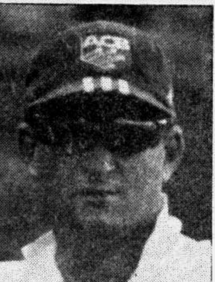
M WAUGH As one of the most stylish batsmen ever to play the game, Mark has scored more than 6,000 Test runs for Australia, including 17 centuries, at an average of 41, plus 13 limited-overs hundreds.

the national Test and one-day sides to have played virtually non-stop for the past 18 months. But he has been able to retain his place on account of his brilliant record over the past decade in both forms of the game.