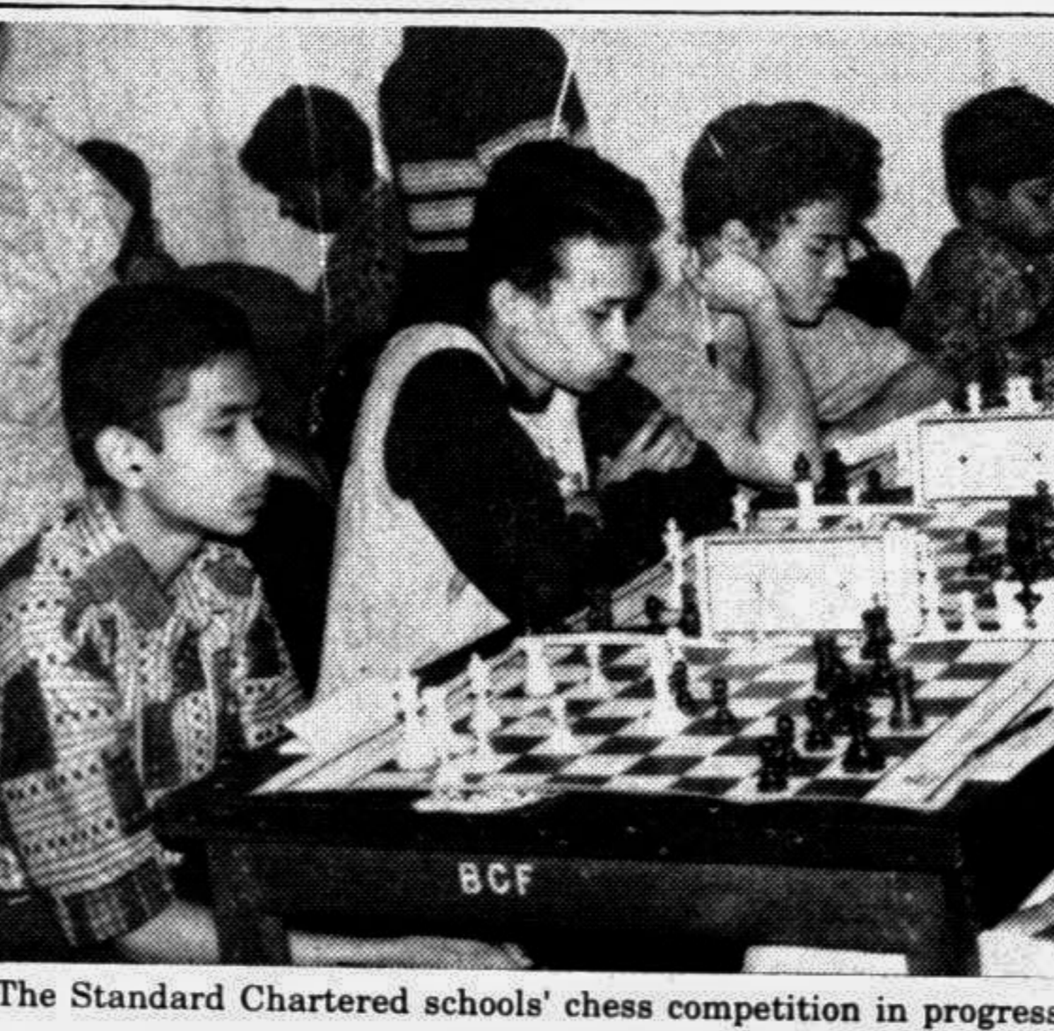
The Standard Chartered schools' chess competition in progress yesterday.