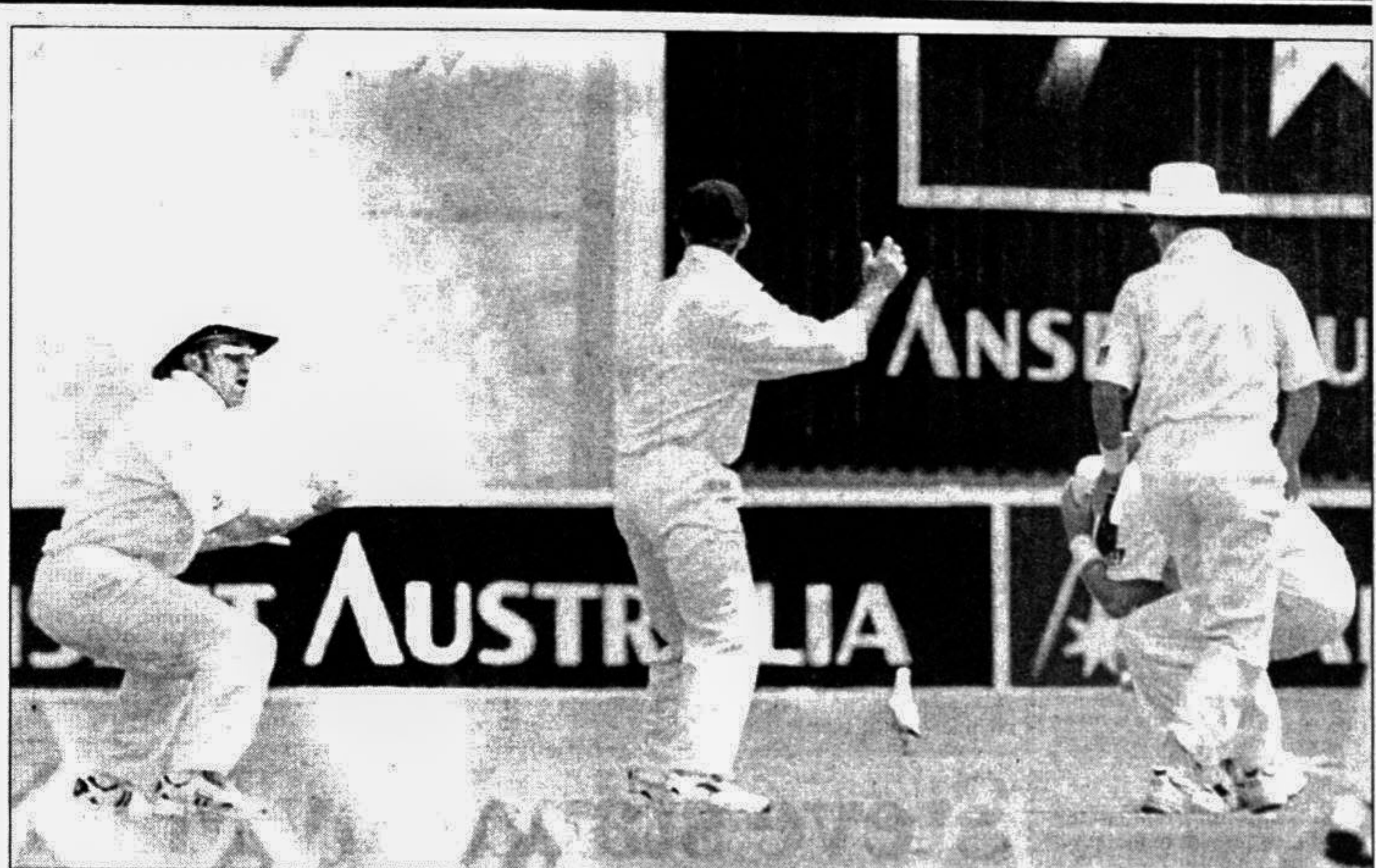
OH NO, WHAT HAVE I DONE! Shane Warne (2nd from R) buries his face in disbelief after dropping India's Javagal Srinath off Damien Fleming yesterday. The catch would have given Fleming his second hat-trick in Test cricket.