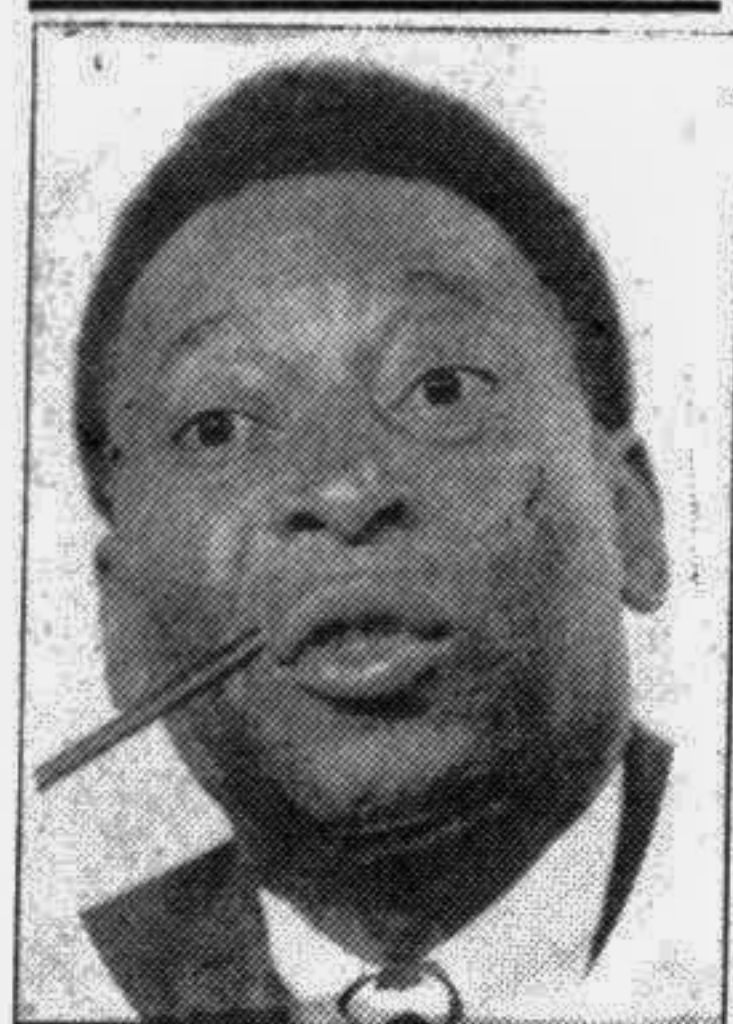
Pele (Brazilian soccer legend) "I have to stay with Pele." Asked to choose his sportsman of the century.