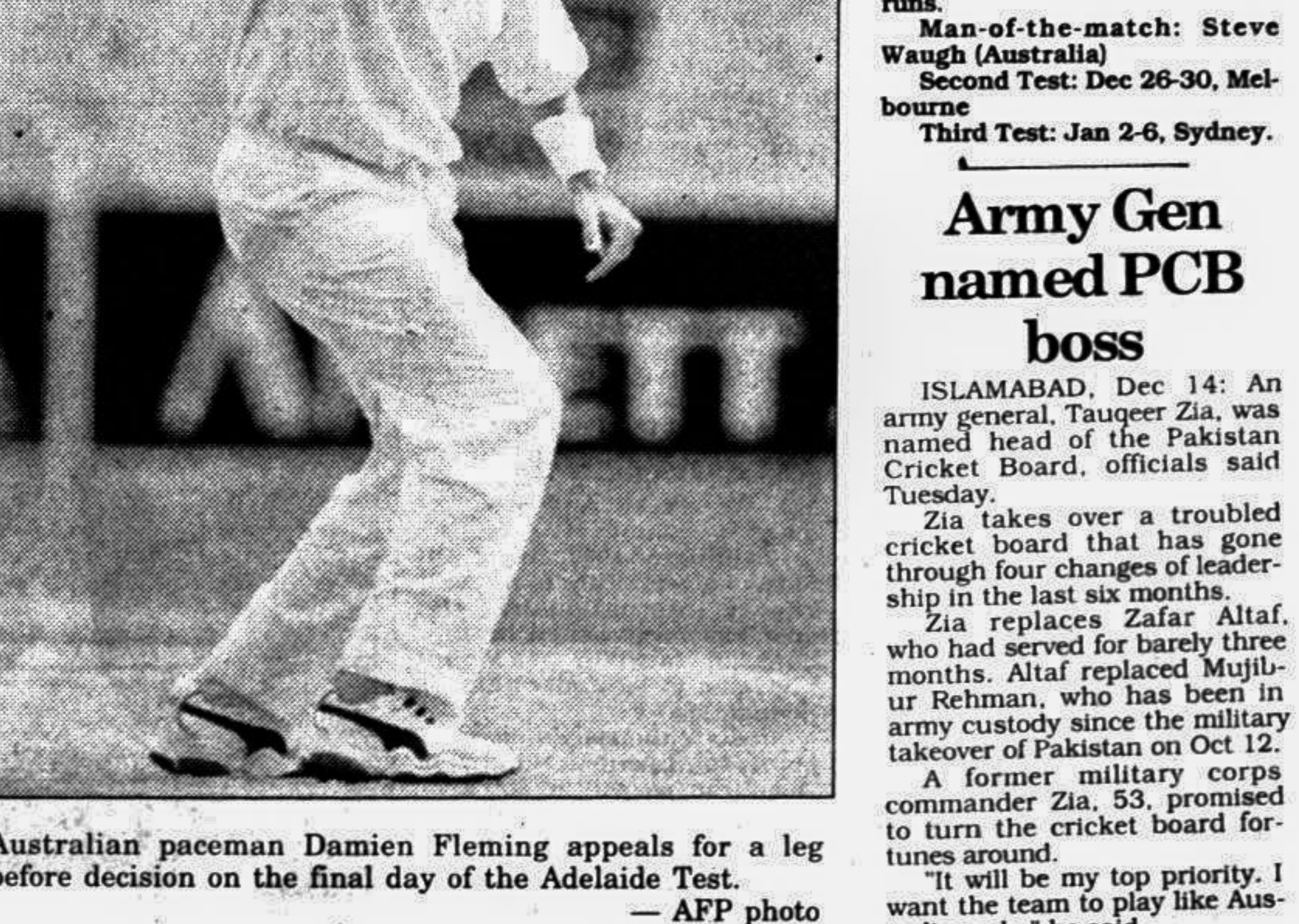
Australian paceman Damien Fleming appeals for a leg before decision on the final day of the Adelaide Test.