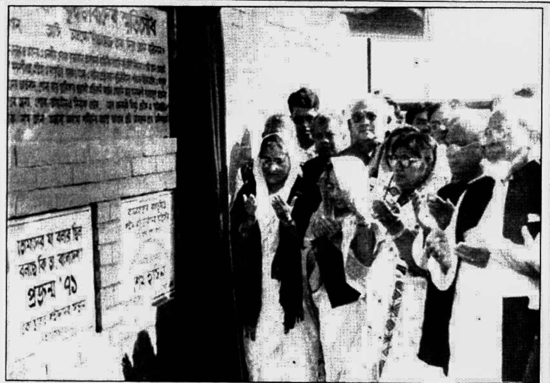
Prime Minister Sheikh Hasina and senior ministers pray for the martyred intellectuals after unveiling the plaque at Rayerbazar mausoleum yesterday.

The Mayor could not be reached for his comment.