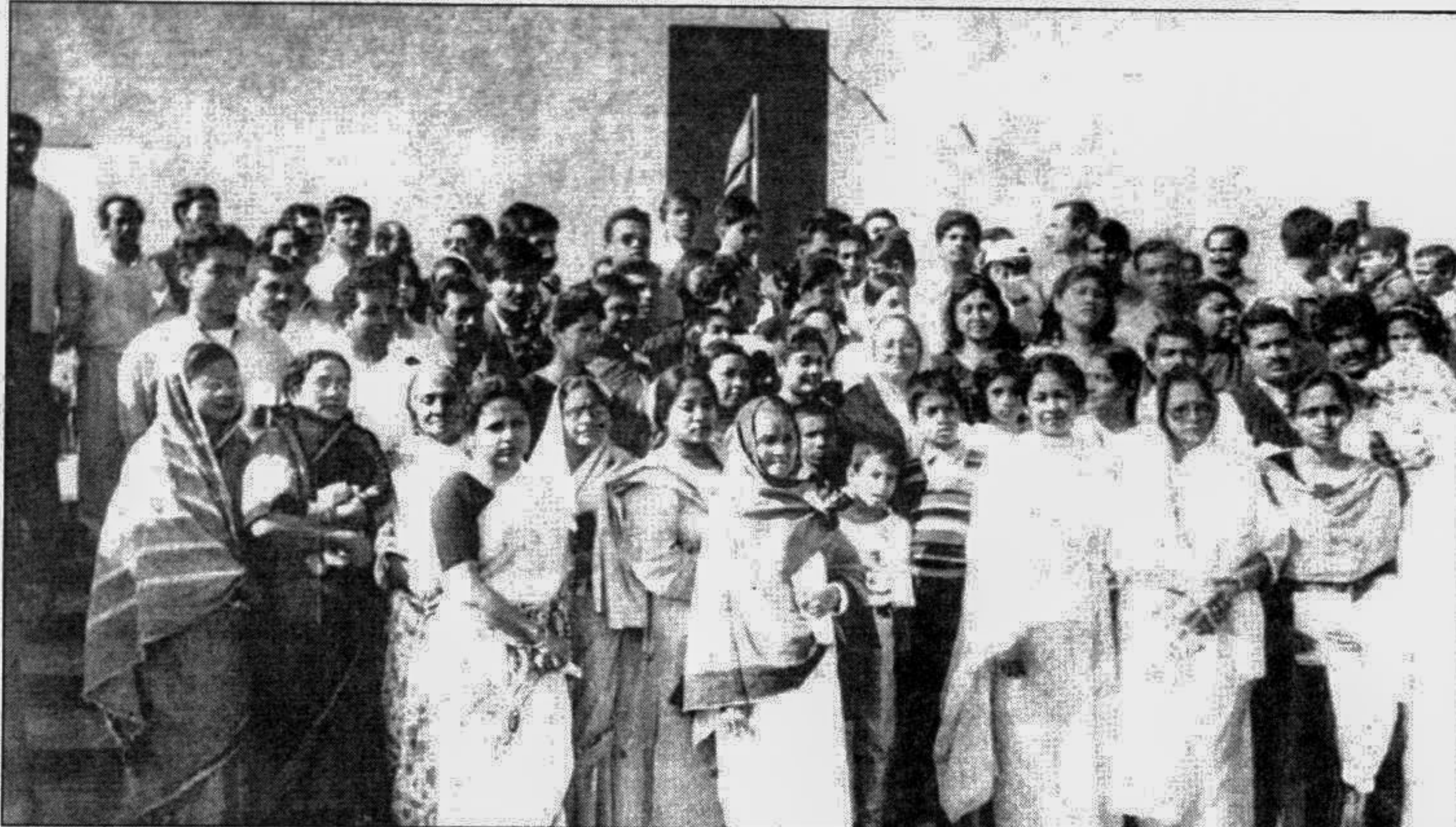
Unified in sacrifice Prime Minister Sheikh Hasina joins relatives of the martyred intellectuals before the memorial at Rayerbazar in the city yesterday.