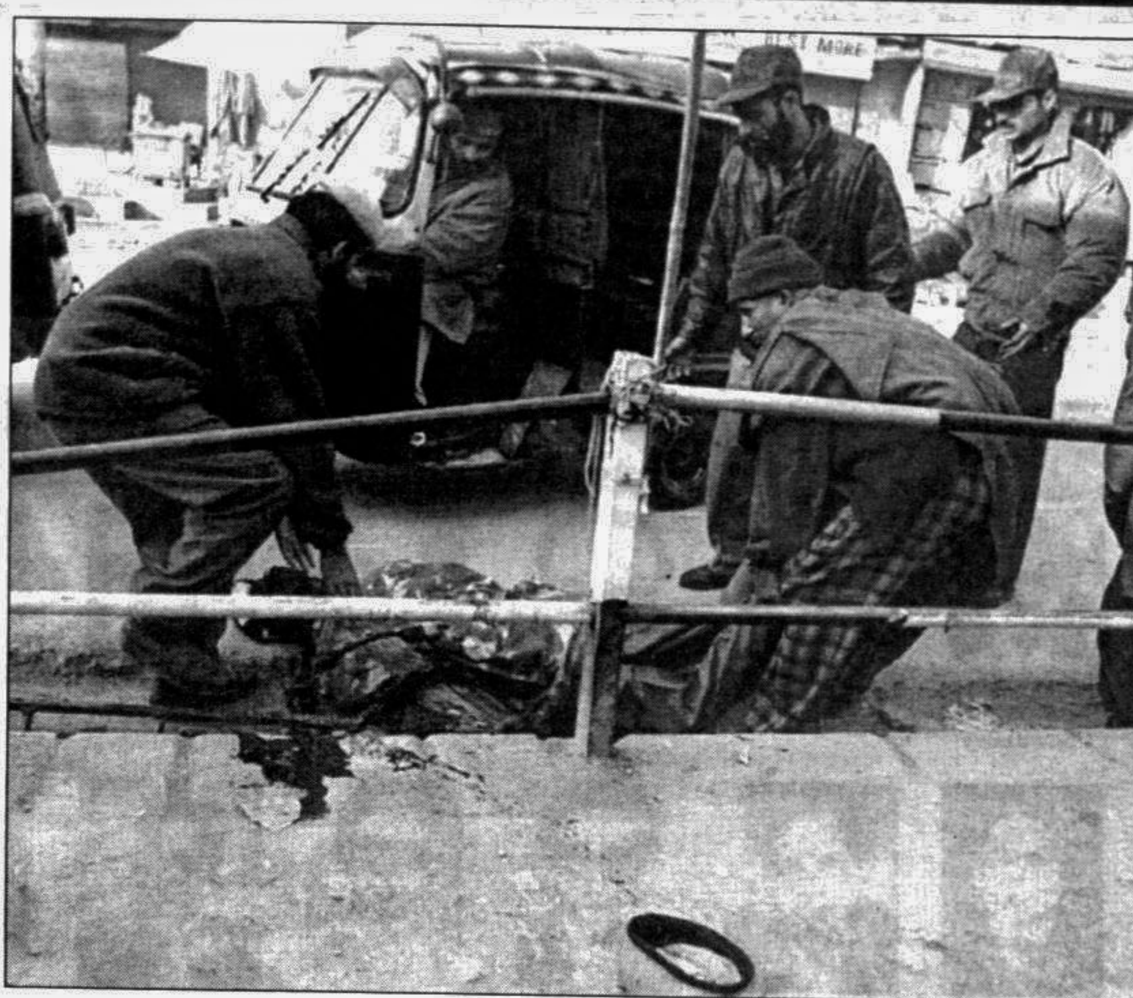
Policemen take away the body of an Indian police personnel who was shot dead by suspected Muslim militants at point blank in Srinagar yesterday. Seven other policemen were killed when the militants struck at four places within a span of 30 minutes in the Kashmir capital's main commercial centre.

At the Helsinki summit, Turkey was selected candidate status for EU membership, but is not expected to join the European club for many years.