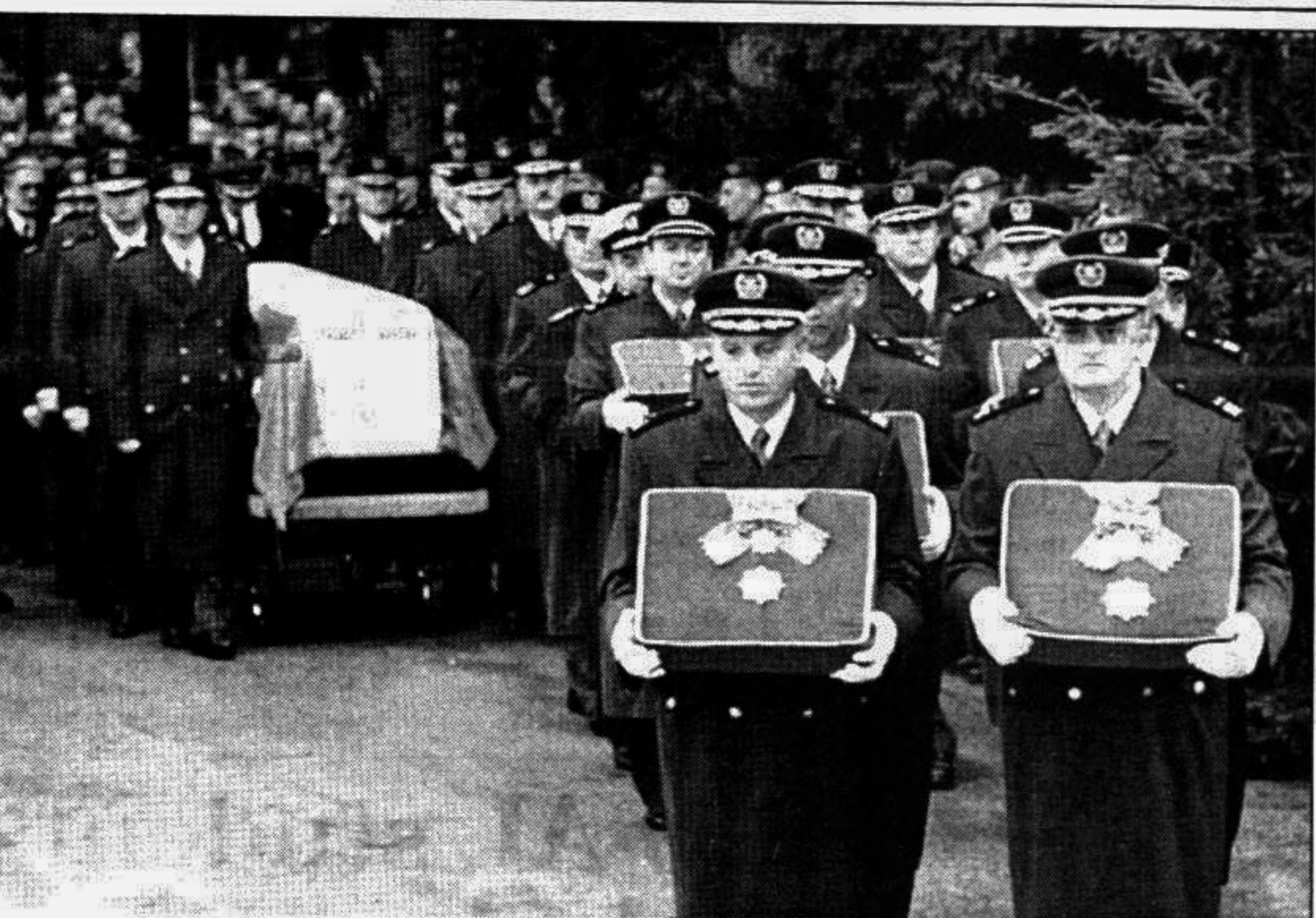
Croatian honour guards escort the coffin of Croatian President Franjo Tudjman yesterday during the funeral at Mirogoj Cemetery in Zagreb. Tudjman died on December 10 after a long battle with cancer.

Kashmir has been the subject of two of the three wars between the two South Asian arch-rivals since the independence of India and Pakistan from British colonial rule half a century ago.