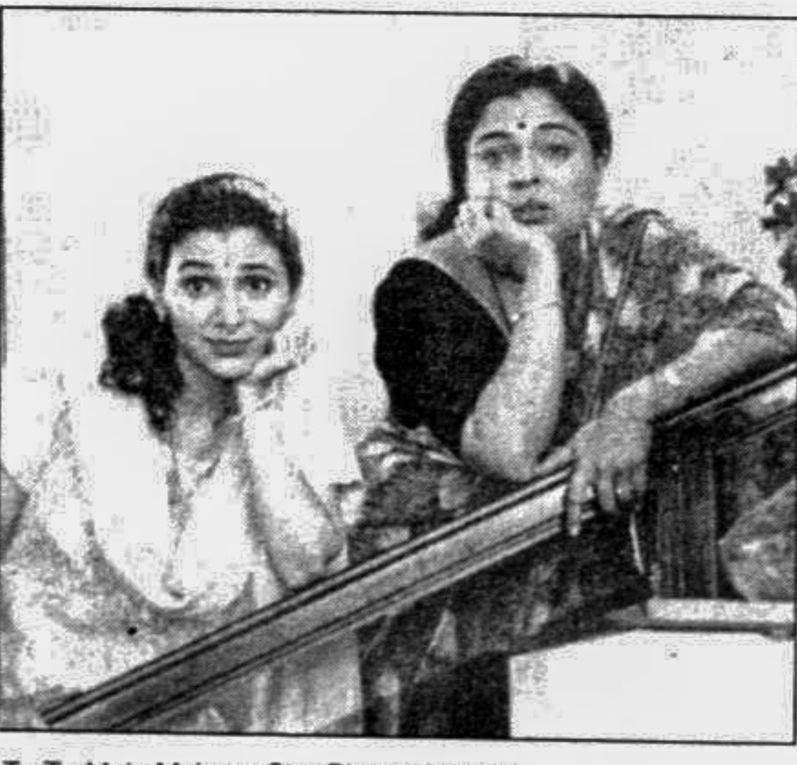
Tu Tu Main Main on Star Plus at 8.30pm

7:00 Non-Stop Hits 8:00 MTV Hanging Out VJ Rahul/Sonia 9:00 Classic MTV VJ Sarah/Rahul 10:00 Non-Stop Hits 10:30 MTV Most Wanted VJ Nadya 11:30 MTV Chill Out VJ Shehnaz/Amrita/Nikhil 12:30 MTV Hit Film Music 1:00 MTV Houseful V Nafisa 1:30 MTV & Kenwood India Hit Lists VJ Rahul 2:30 MTV Select VJ Nikhil 3:30 Love Line VJ Malaika 4:00 Essential 4:30 Pepsi Dance Connection Special- TV MTV 5:30 MTV Most Wanted VJ