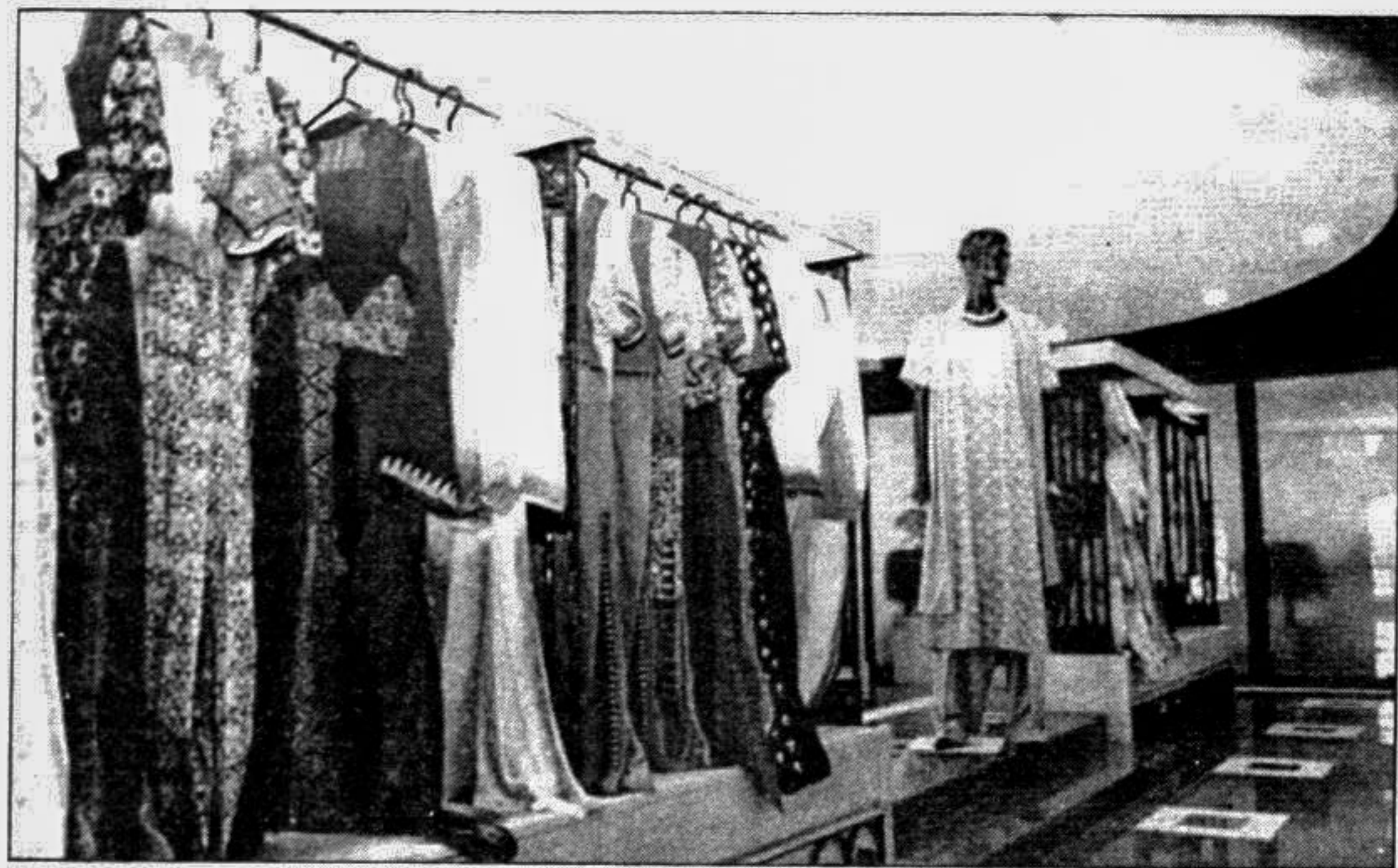
The newly opened Boutique Isabella

Boutique Isabella reopens in the city at Banani