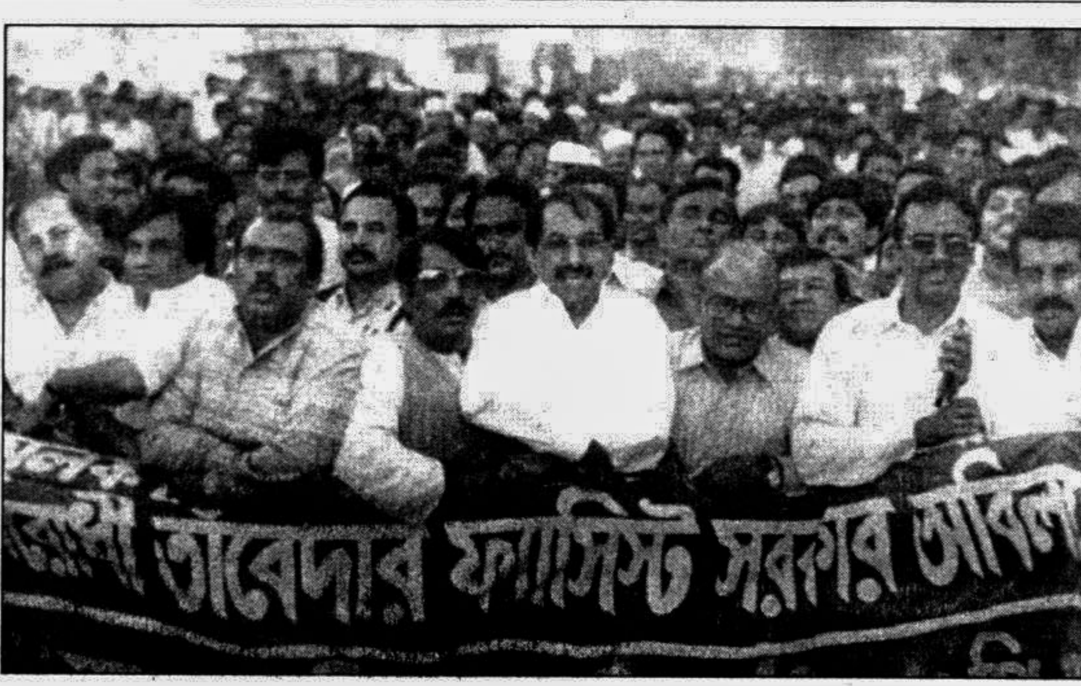
A city BNP procession yesterday ahead of today's hartal.

BULAWAYO, Dec 12: Sri Lanka beat Zimbabwe by 13 runs in the second one-day international today. Scores: Sri Lanka 213 (Russel Arnold 103; Guy Whittall 4-35); Zimbabwe 200 (Alistair Campbell 56; Sanath Jayasuriya 4-41.)