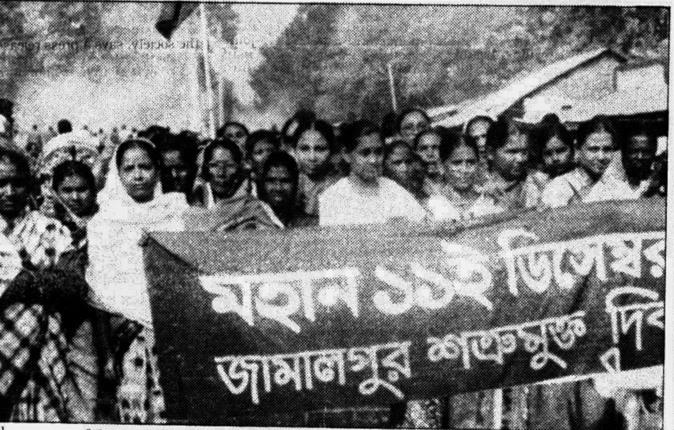
Observance of Jamalpur-free Day in Jamalpur.