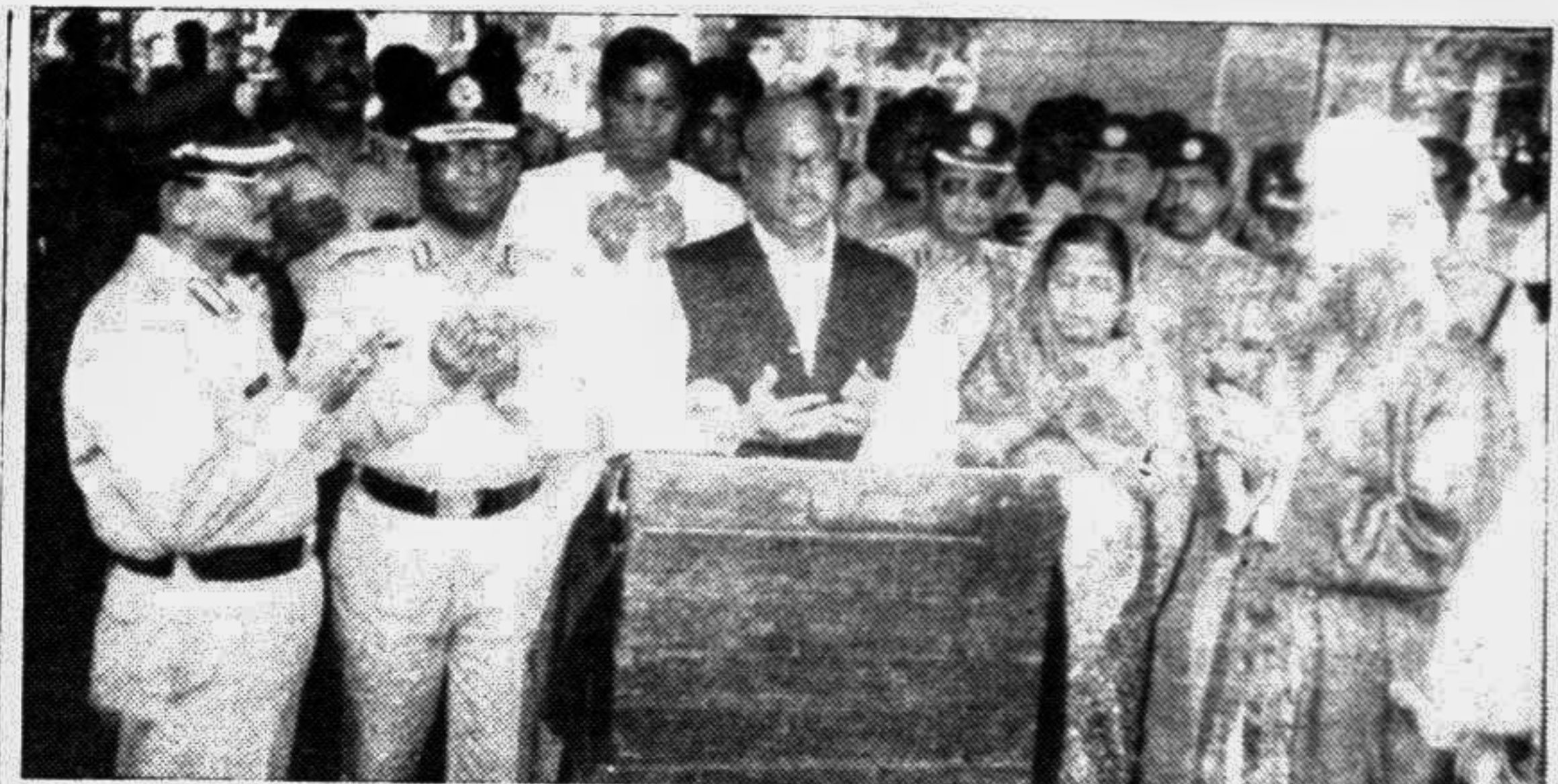
Minister for Home and Telecommunications Mohammad Nasim offered munajat after laying the foundation stone recently of Police Hospital at Sardah Police Academy in Charghat thana of Rajshahi district.