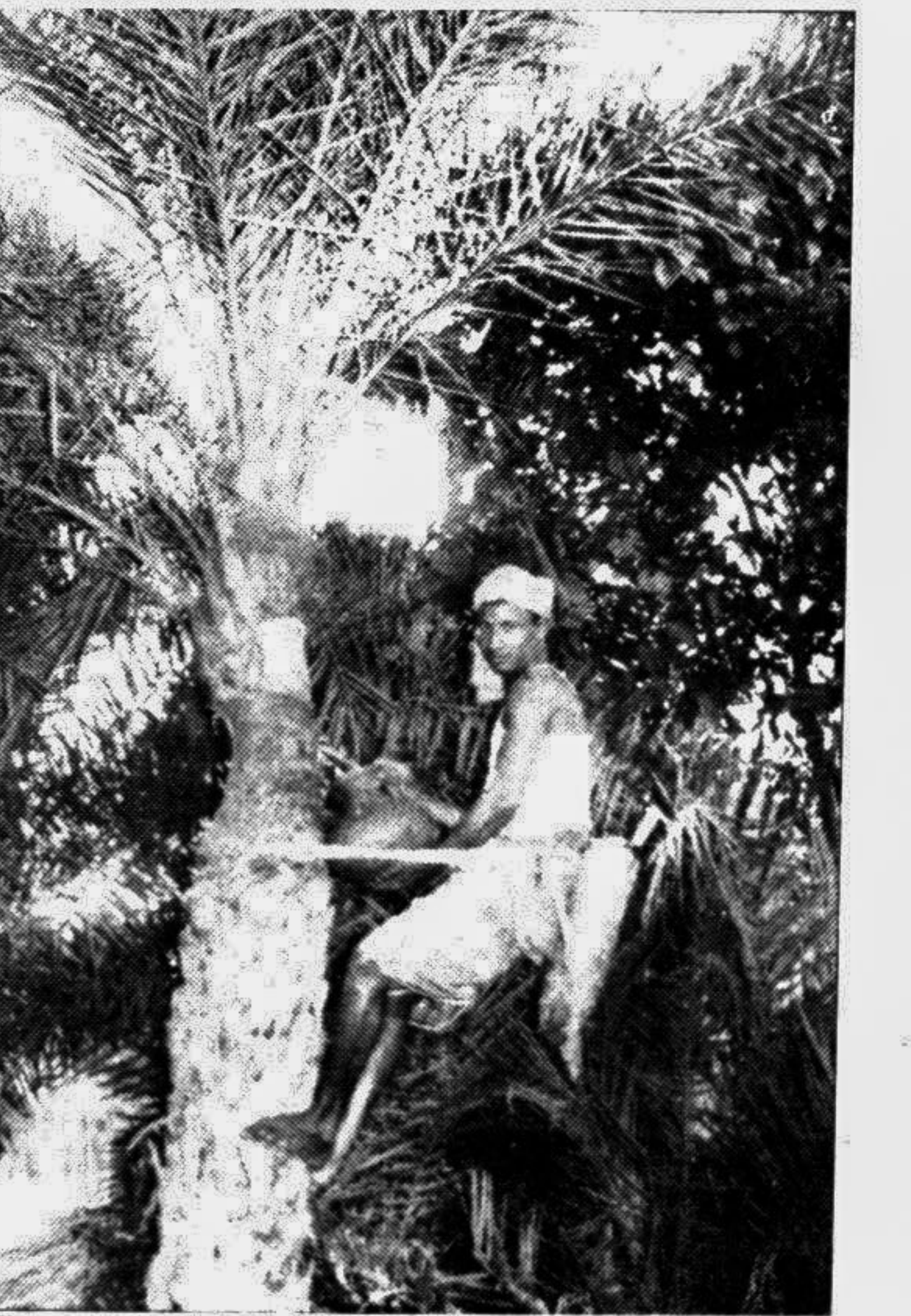
Extraction of date juice has already been started in Jamalpur district in the ongoing winter season.