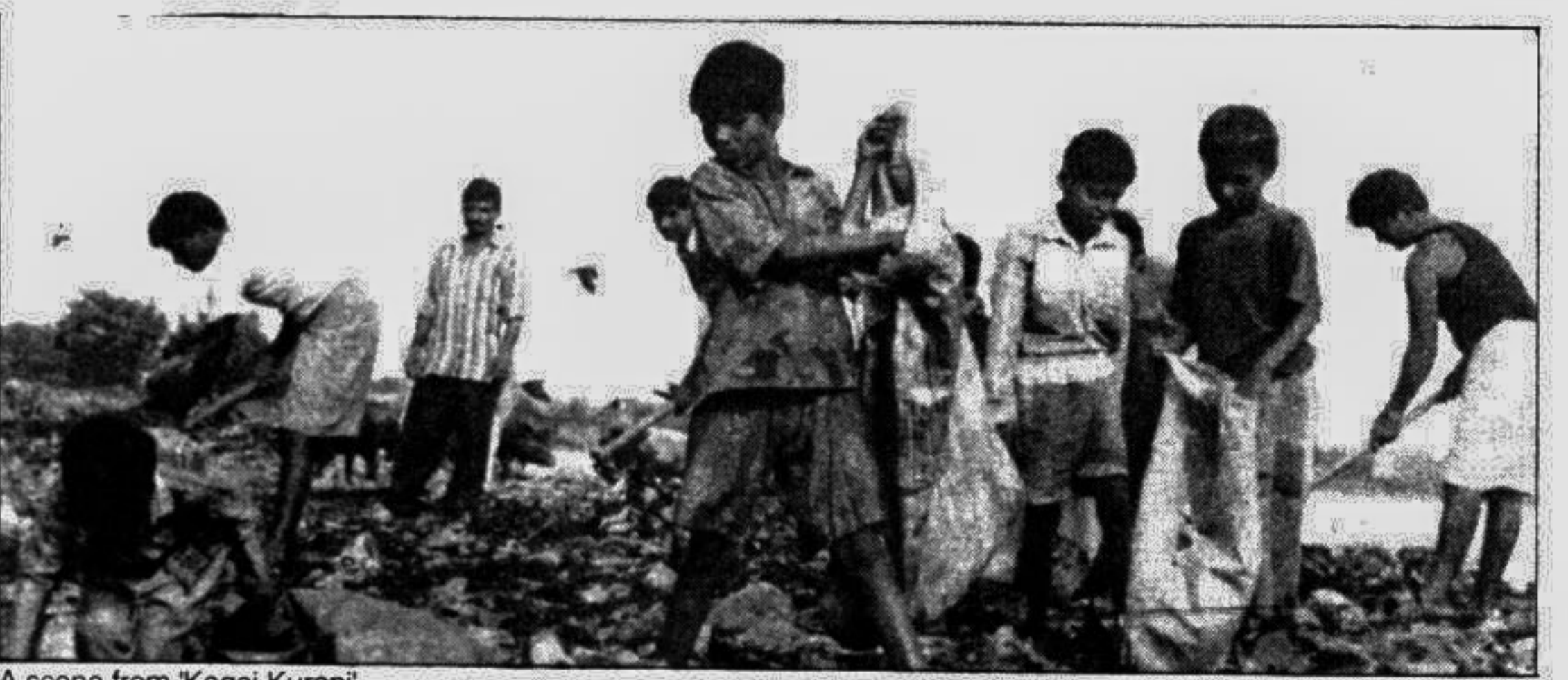
A scene from Kagaj Kurani

Lulu has no concern for his health. When hungry, he gorges