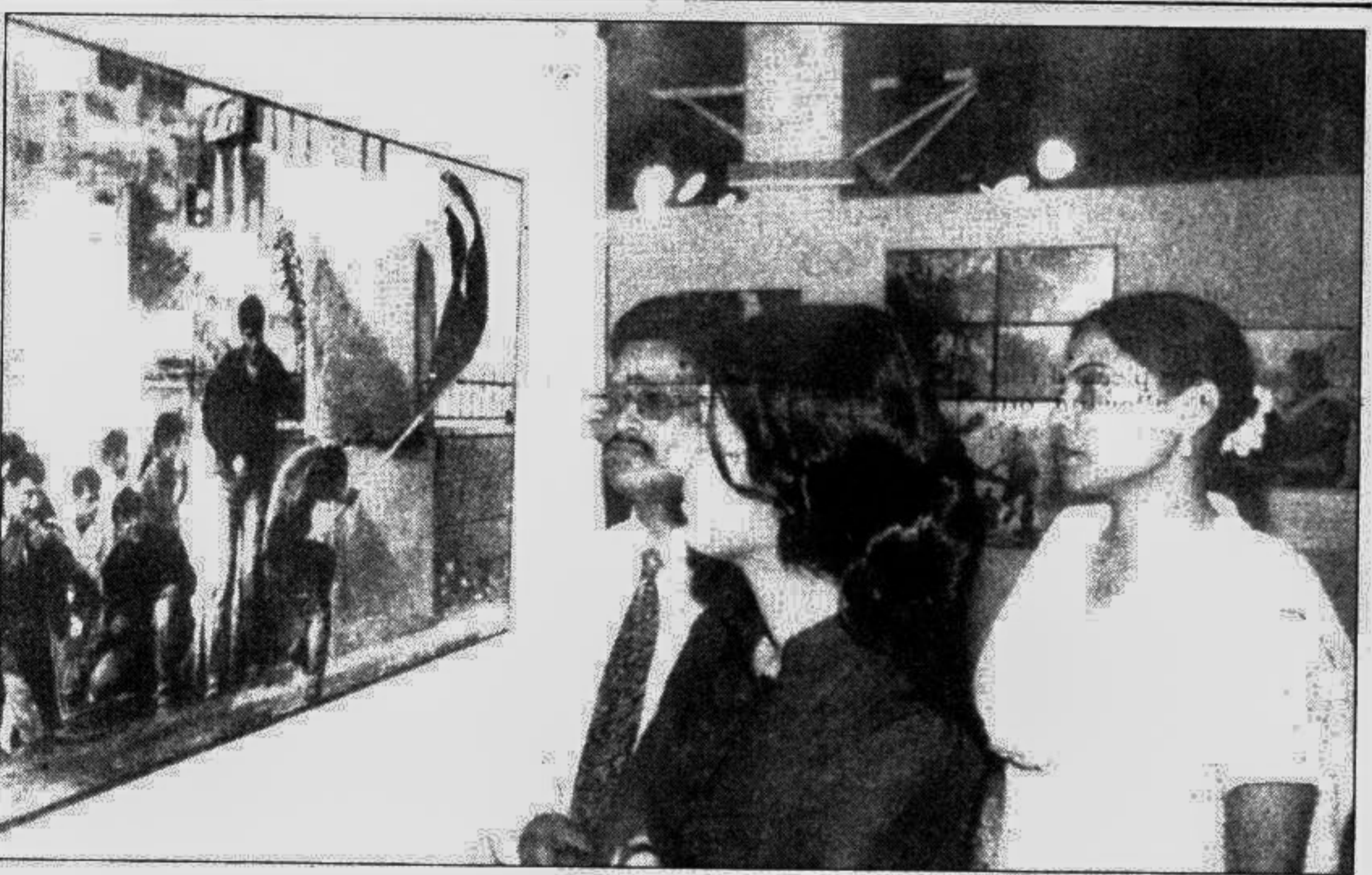
Viewers enjoying the works at the World Press Photo Exhibition at the Drik Gallery