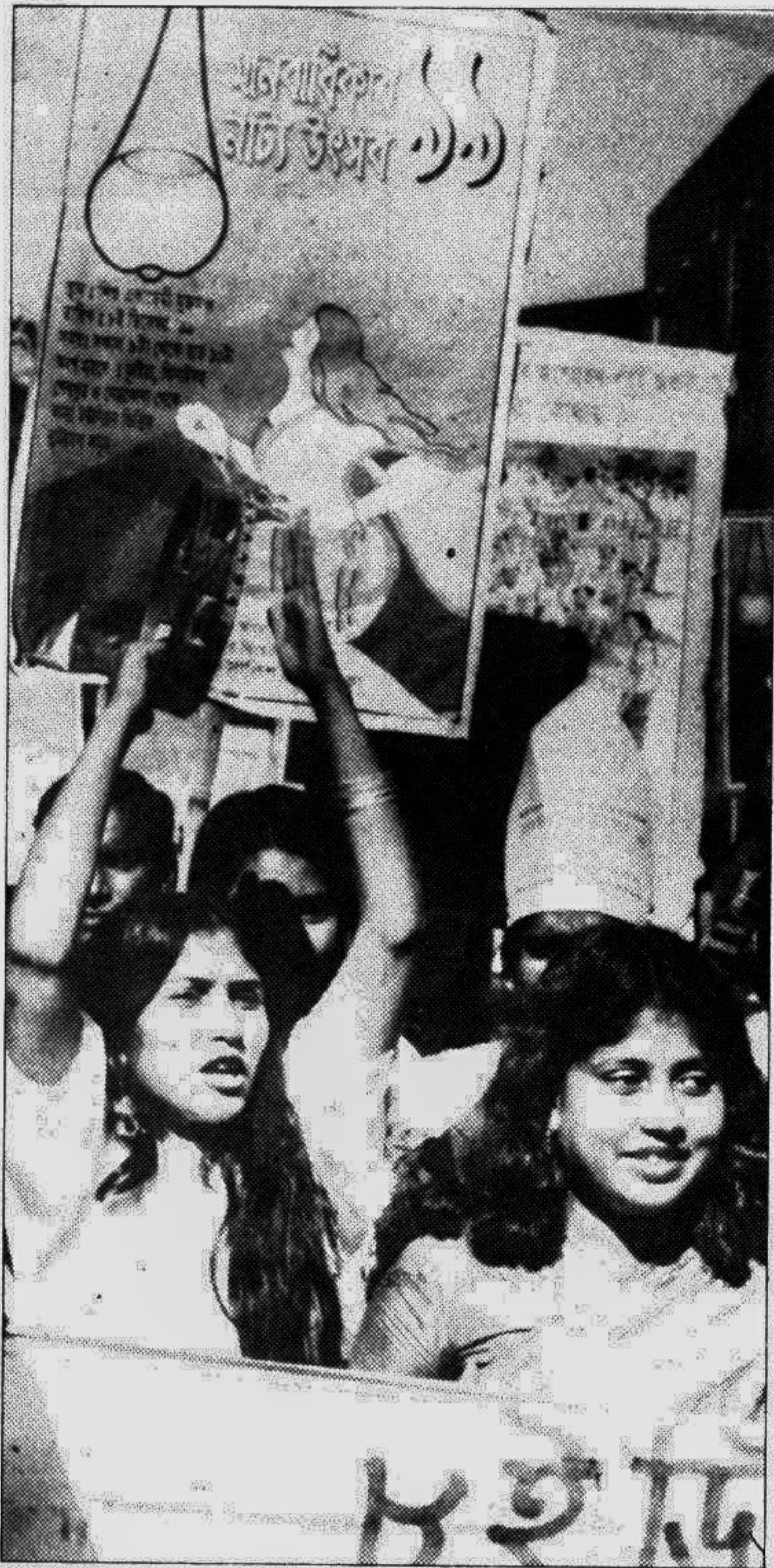
Ain O Salish Kendra organised a colourful rally on December 8

Human Rights is a vast issue and the vision to ensure human rights for everyone may become a stretched out idea but still no harm in dreaming and this dream will guide us to work to make the dream a reality.