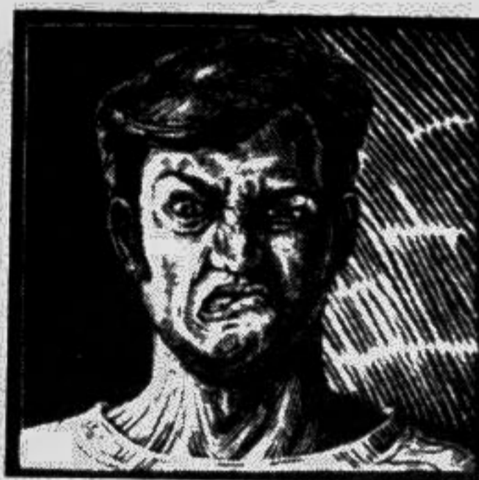
WANTED (Expressionism-1), SHABBY (Expressionism-2), Linocut 1998