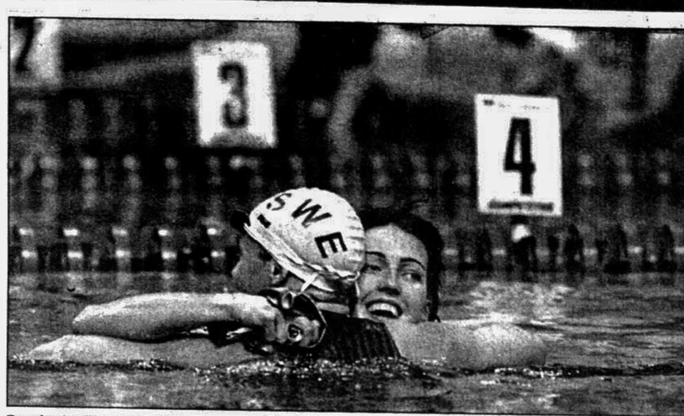
Sweden's Therese Alshammar (R) being congratulated by a fellow countrywoman after winning the 100m freestyle with a world record at the European Championships in Lisbon on December 10. She clocked 52.8 seconds.

The winners will receive their awards on January 8, at the US Olympic Awards Dinner in Indianapolis.