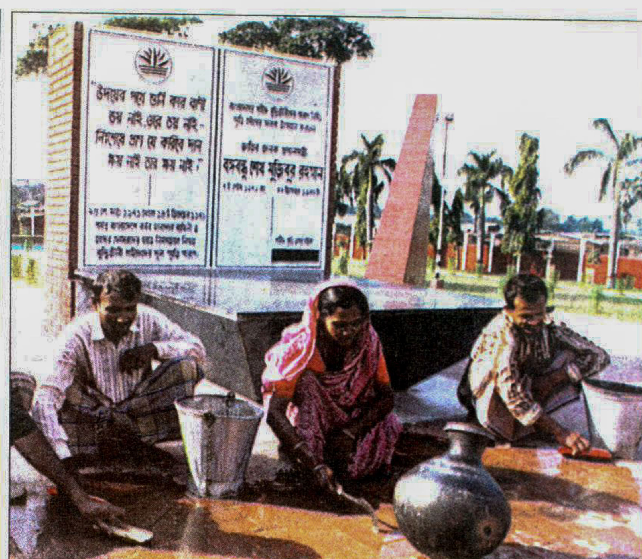
Martyred Intellectuals' Memorial at Mirpur being cleaned as the nation prepares to pay homage to the martyrs on Tuesday.