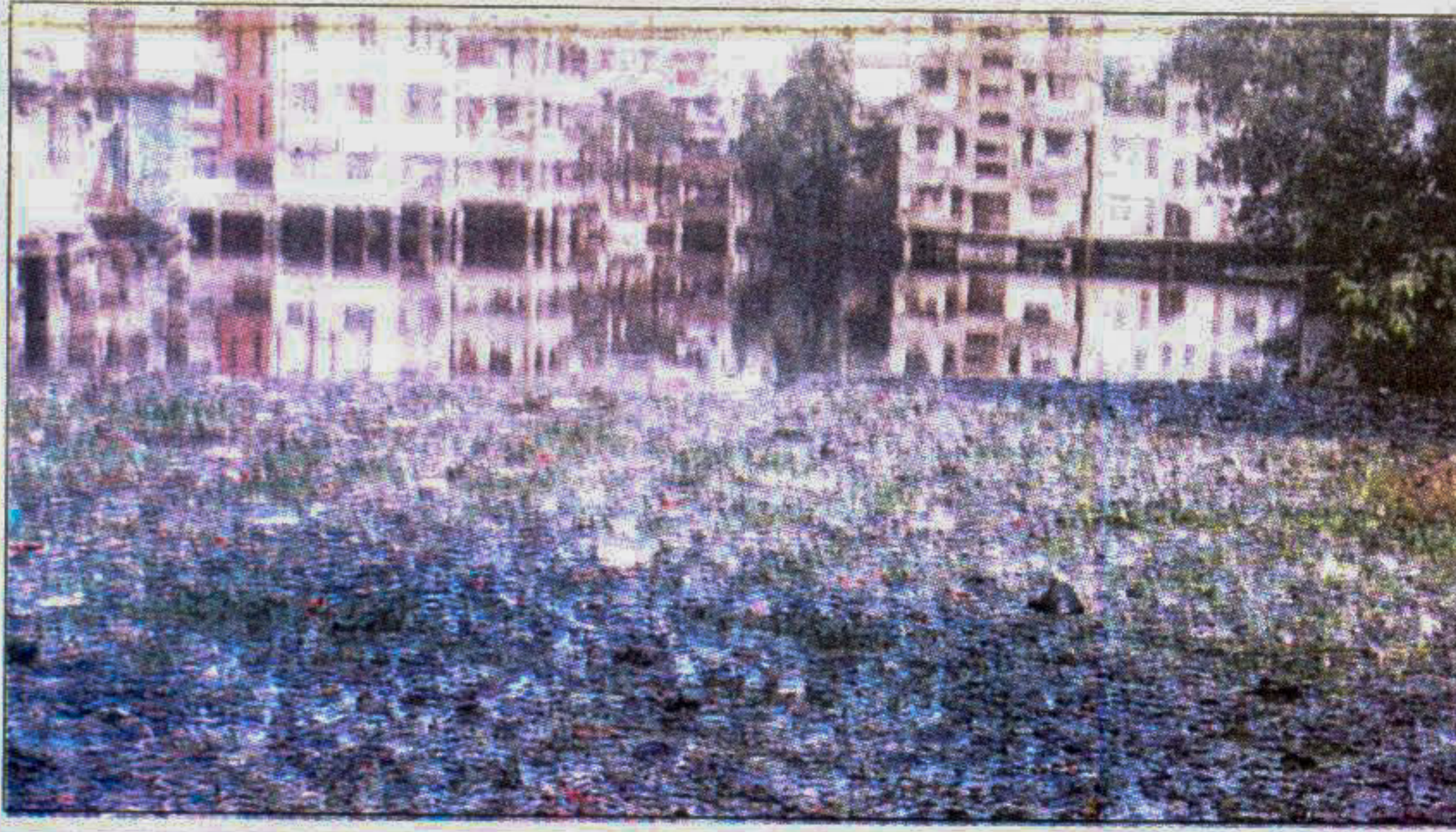
A mosquito breeding ground in the city's Ahmedbagh area.