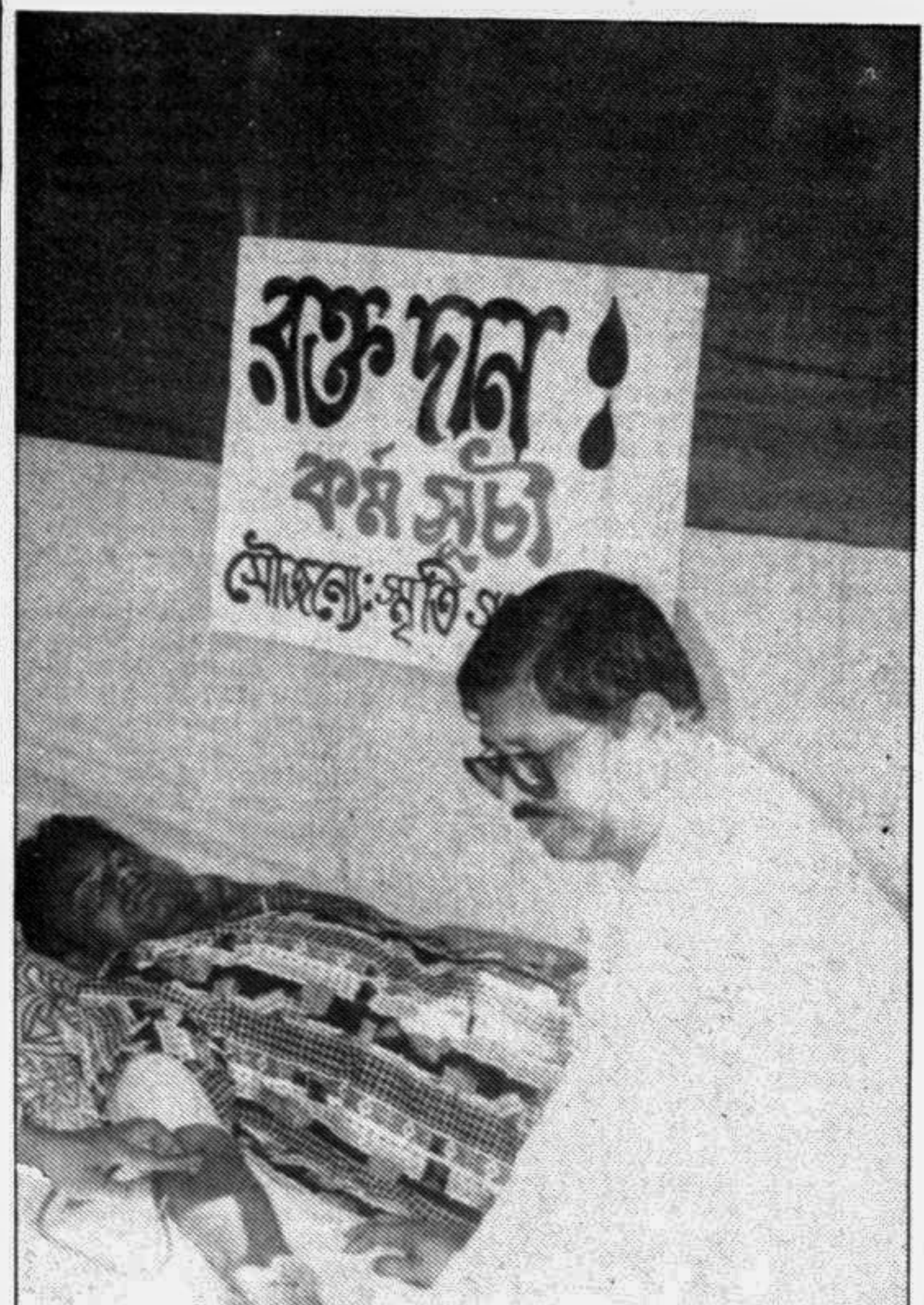
One young man donating blood in Magura town recently at a blood donation campaign organised by Magura Notun Bazaar Memorial Committee on the occasion of 'Katyani Puja'.

Substances of these pesticides continue to steadily work in human bodies after consumption of such vegetables causing weakness and various intestinal, heart and liver diseases.