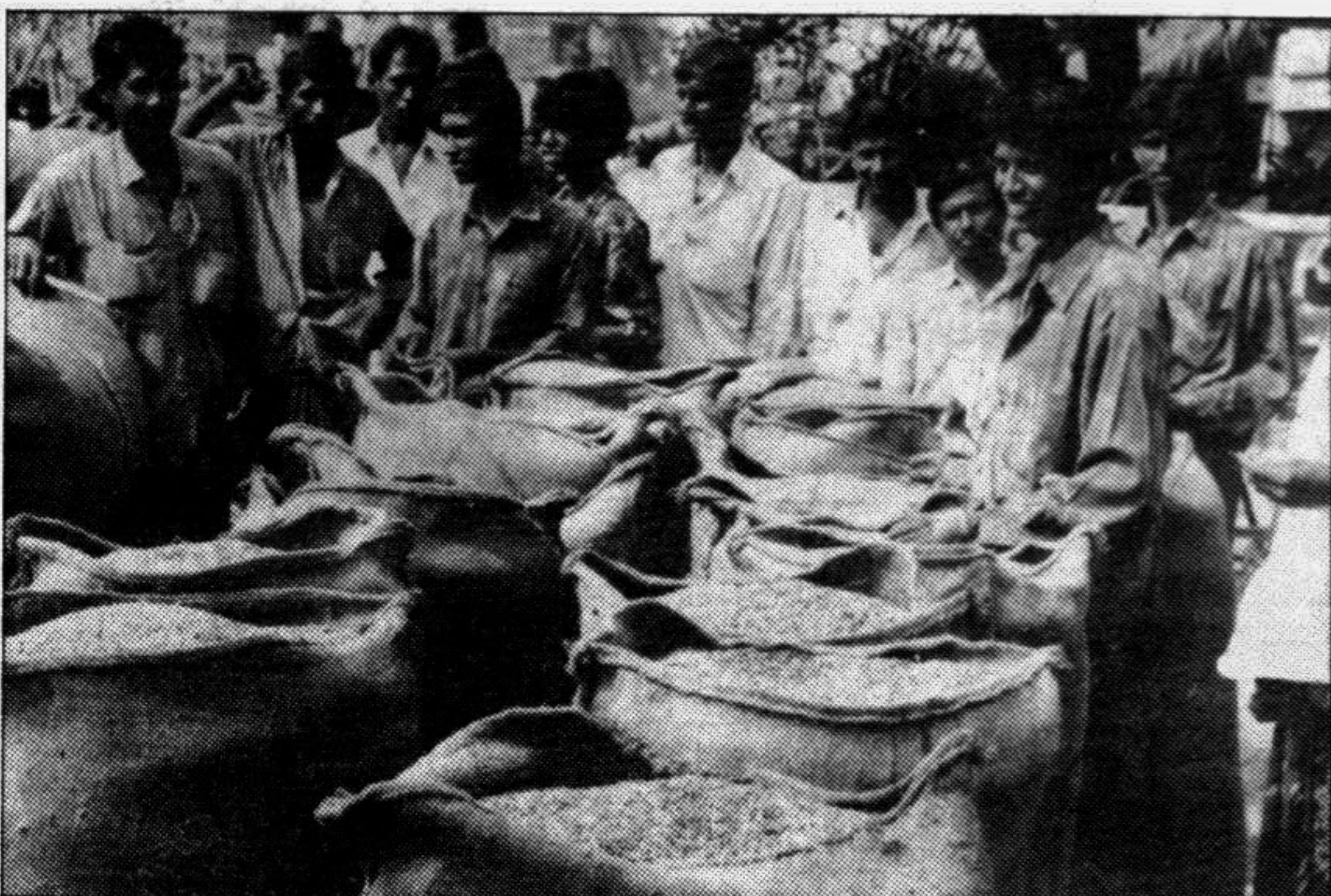
Sellers waiting with Aman paddy at Kaliganj market in Jhenidah district.

The target was achieved as Aman paddy was cultivated on 90,000 hectares of land exceeding the target.