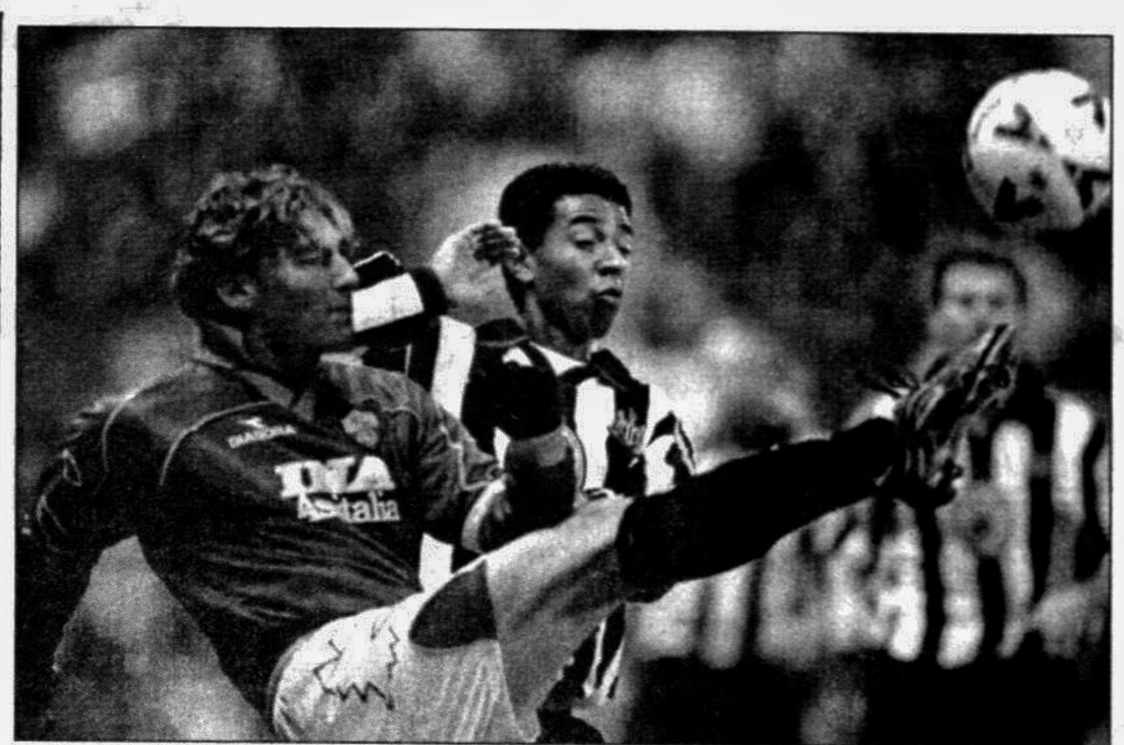
Roma's Francesco Totti (L) and Newcastle's Nolberto Solna fight for possession during their UEFA Cup second-leg third-round fixture at St James' Park on December 9.