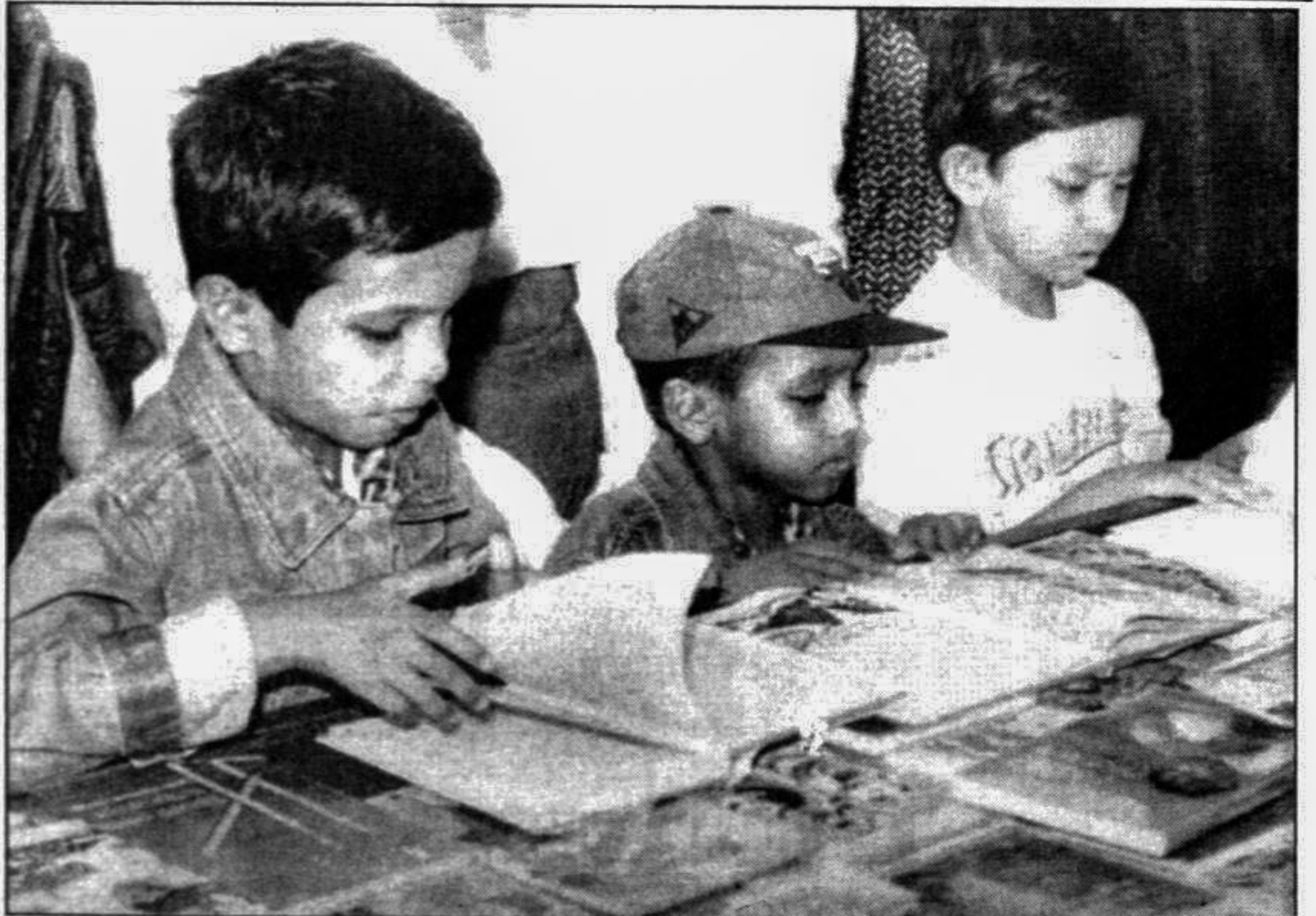
The 6th Dhaka Book Fair failed to pull much crowds this year. Despite yesterday being a holiday, the fair wore a deserted look. But some tiny-tots were seen much enthusiastically sifting through books for their favourite ones.

BNP's joint secretaries general, presidents and general secretaries of all front organisations of the central and city committees, joint convenors of city BNP, presidents and general secretaries or convenors and joint convenors of thana committees will attend the meeting.