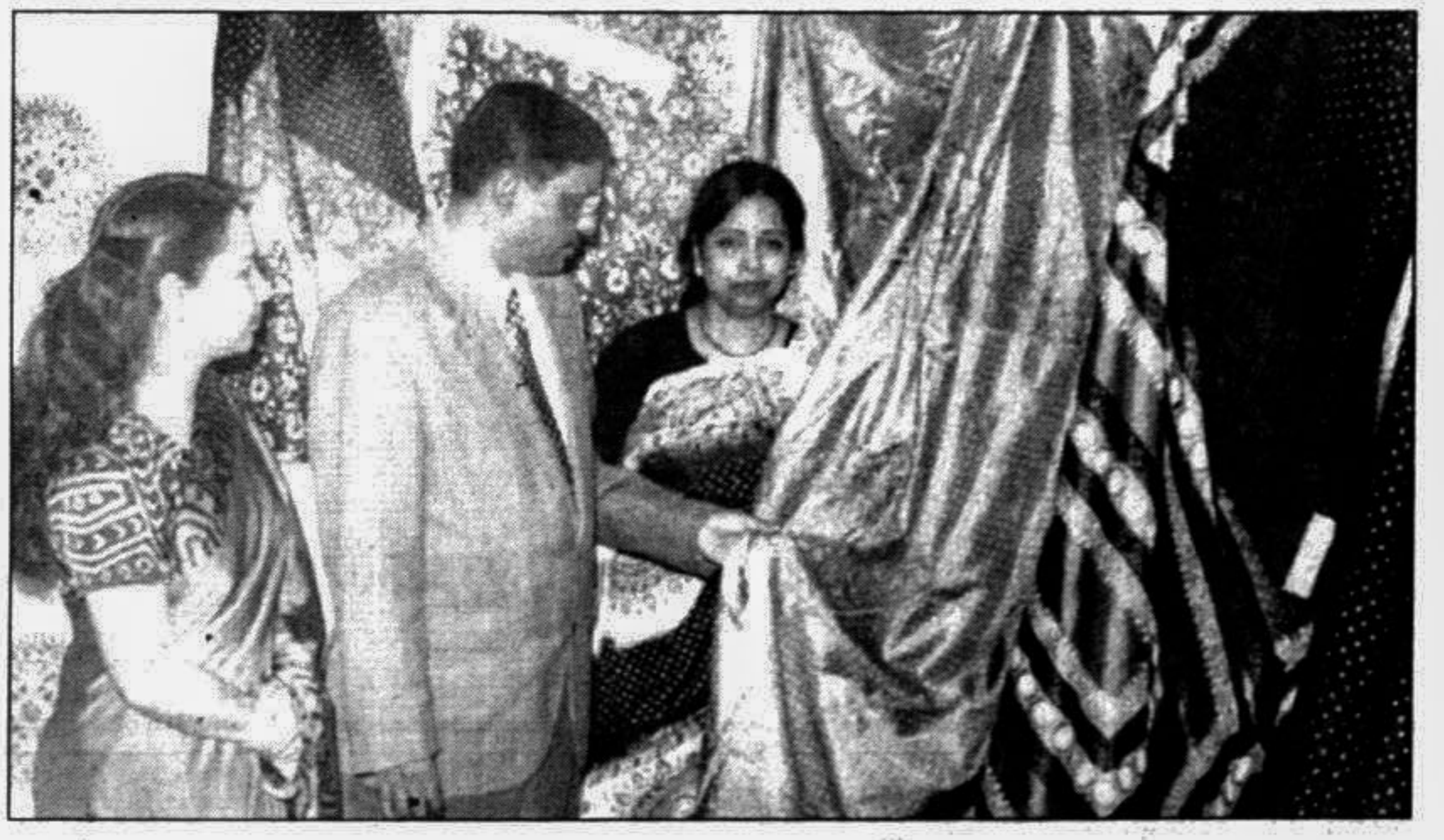
A saree exhibition was held at the Women's Voluntary Association (WVA) auditorium in the city yesterday. Obaidul Quader, Minister of State for Youth, Sports and Cultural Affairs visiting a stall there.