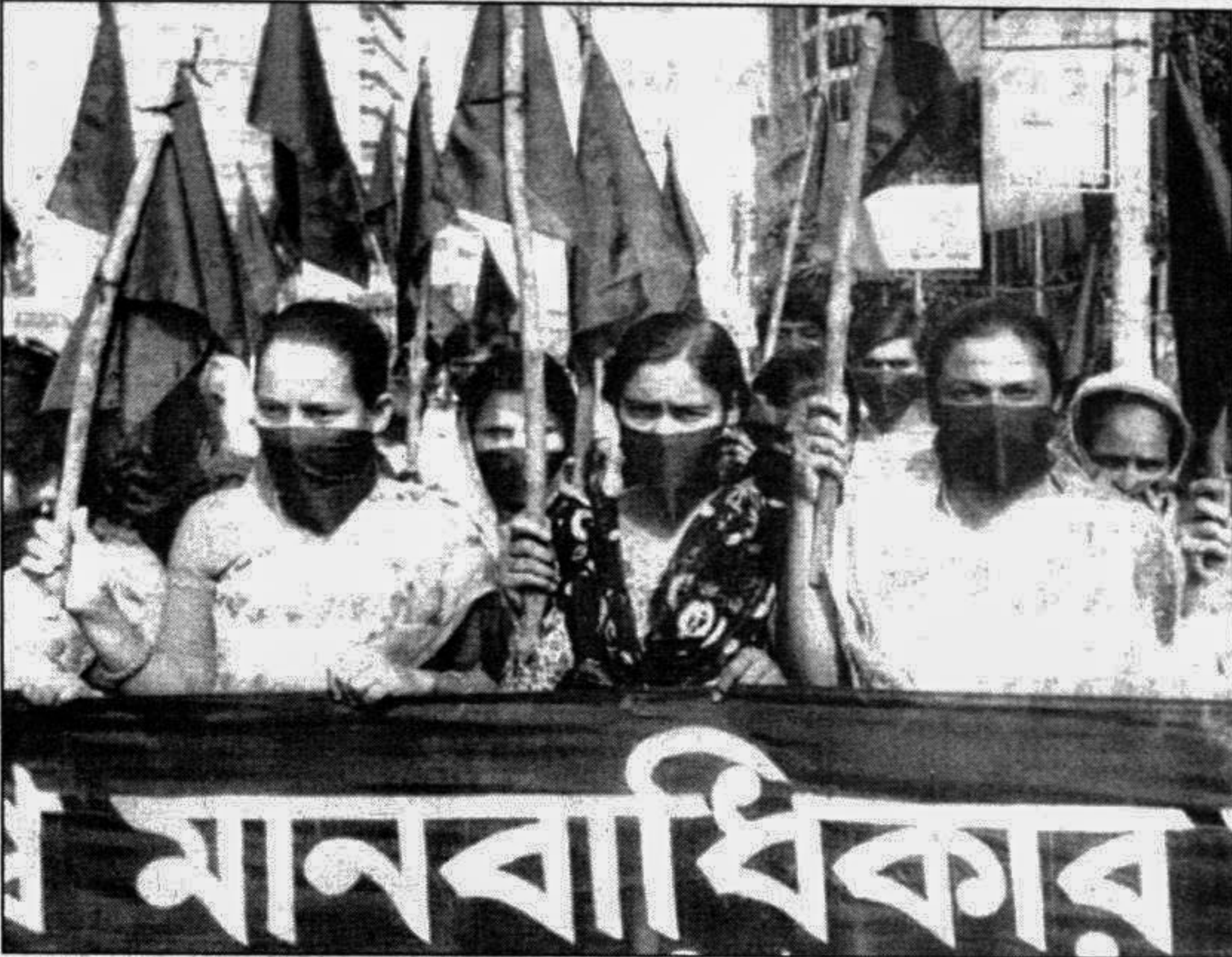
Domestic Workers' Association brought out a procession wearing black mask in observance of the World Human Rights Day in the city yesterday.

During Yeltsin's visit, the two countries signed three accords defining the countries' 4,250-kilometer border and joint use of disputed islands.