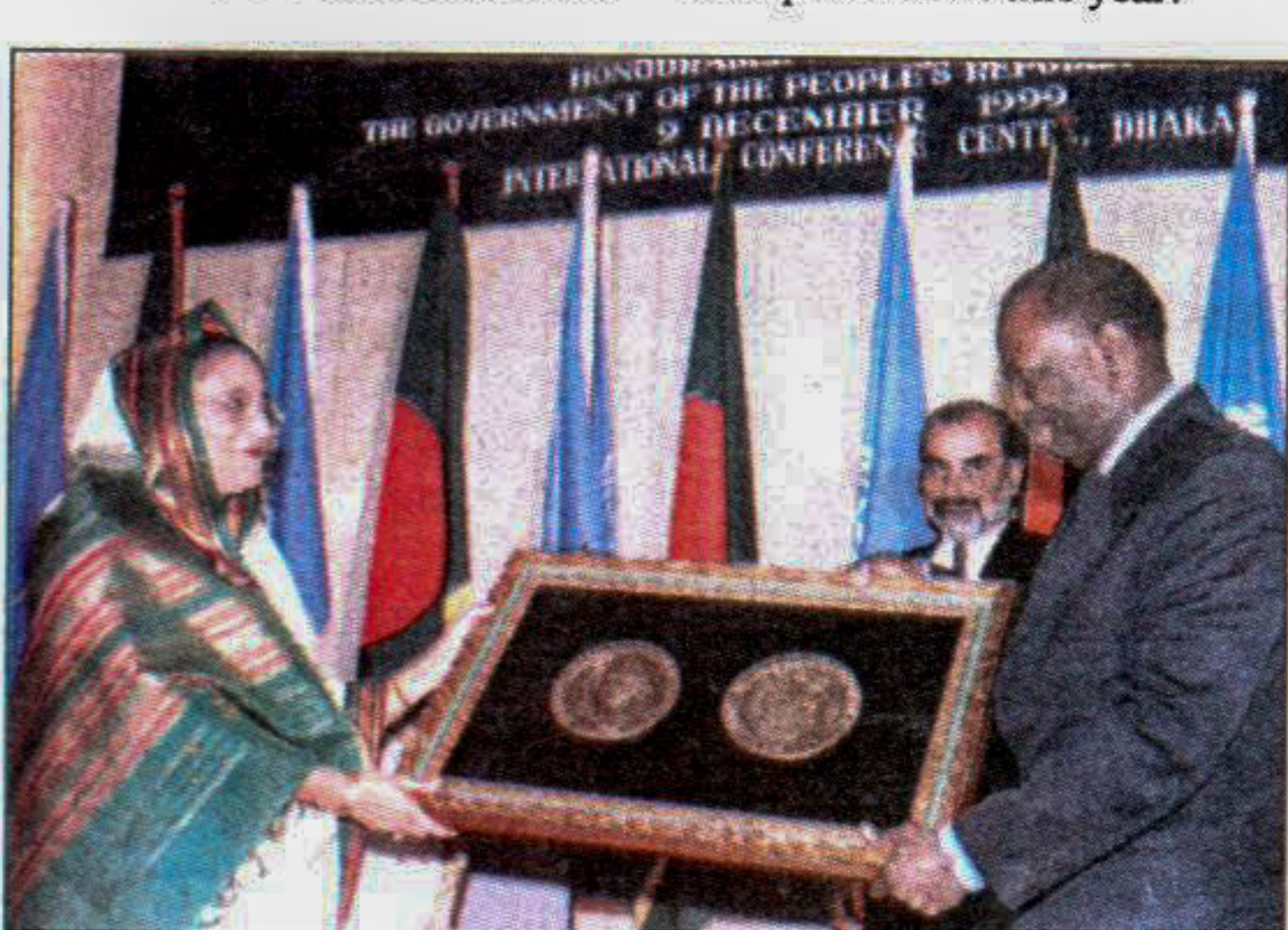
Another feather in PM's cap Sheikh Hasina receives the Ceres medals from the FAO director general yesterday.

Diouf said the Ganges water treaty, CHT peace accord and Bangabandhu Bridge would all together contribute to development of overall agriculture sector. He praised the way Bangladesh overcame last year's floods and got the highest food production this year.