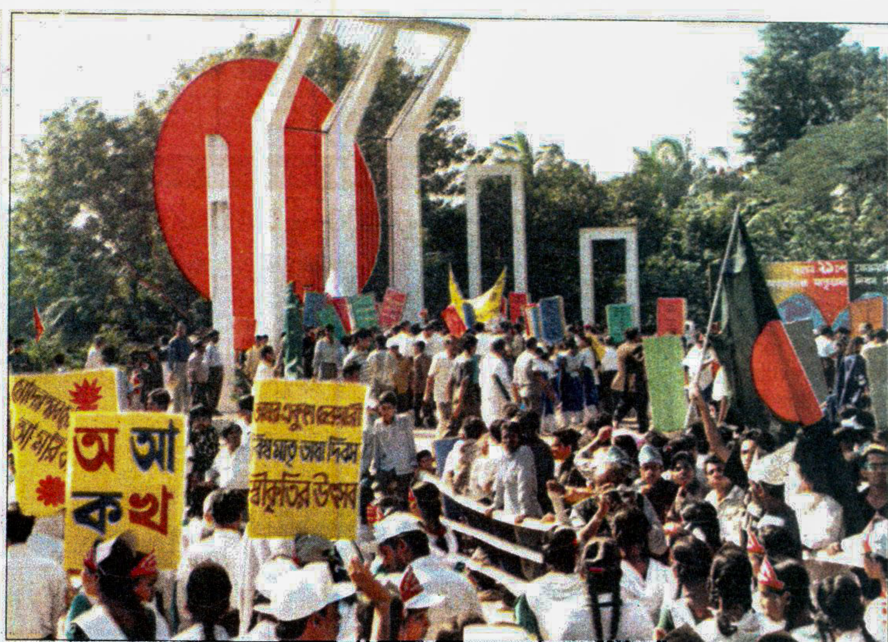
People converge on the Shaheed Minar, celebrating the global recognition of our valiant sons' glorious sacrifice 48 years ago. The site marks the exact spot where the students fell when bullets struck them. The Minar in the background testifies to the elegy's glory.