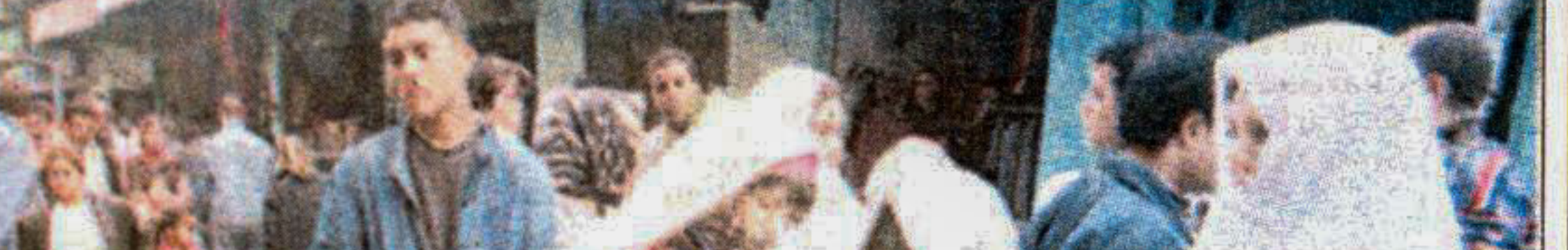
Housewives wearing the traditional Tunisian veil, the Sefsari, shop for fruit and vegetables in the ancient Medina yesterday, for the forthcoming holy month of Ramadan, which is expected to start tomorrow.

From page 1 The government should respect the people's sentiment and step down immediately. Otherwise it will be very difficult to protect the ruling party from the people's wrath, he said and asked the government to quit and hand over power to a caretaker administration without delay.