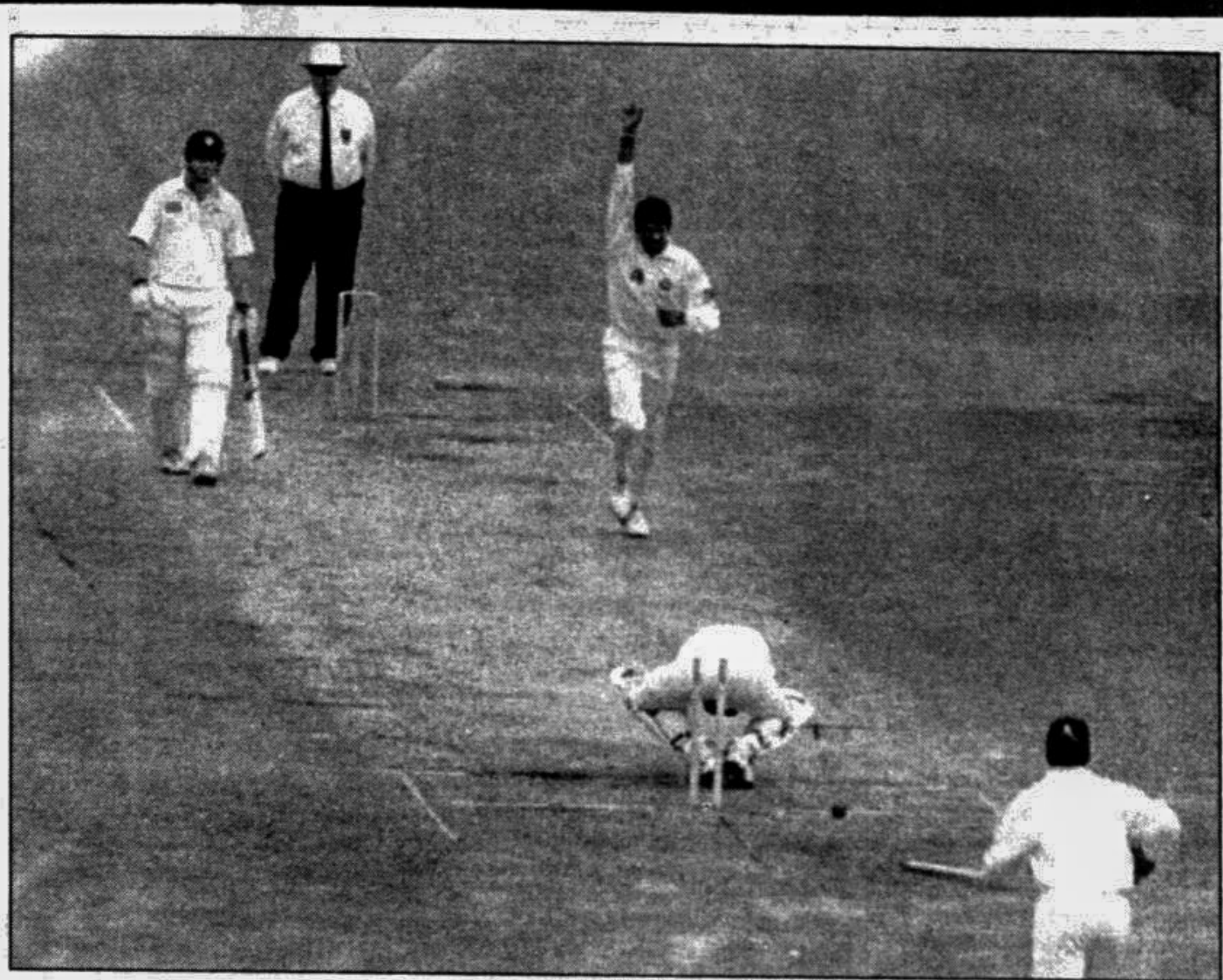
Indian paceman Venkatesh Prasad is delighted after clean bowling New South Wales batsman Michael Clark at Sydney yesterday.

Batsman Rahul Dravid kept wicket in the match against NSW.