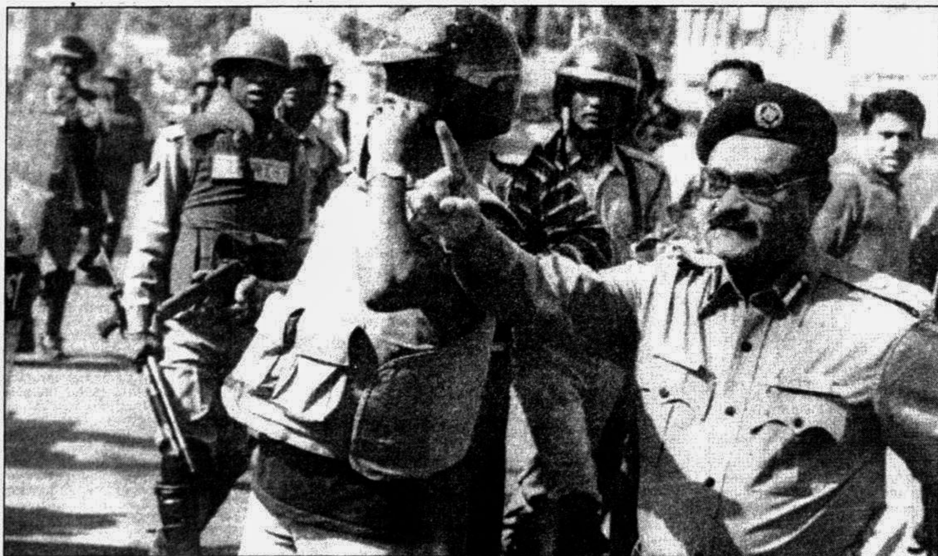
That's enough The Deputy Commissioner at DMP's Detective Branch warns BNP demonstrators near the party central office not to blast anymore bombs after a series of explosions yesterday.