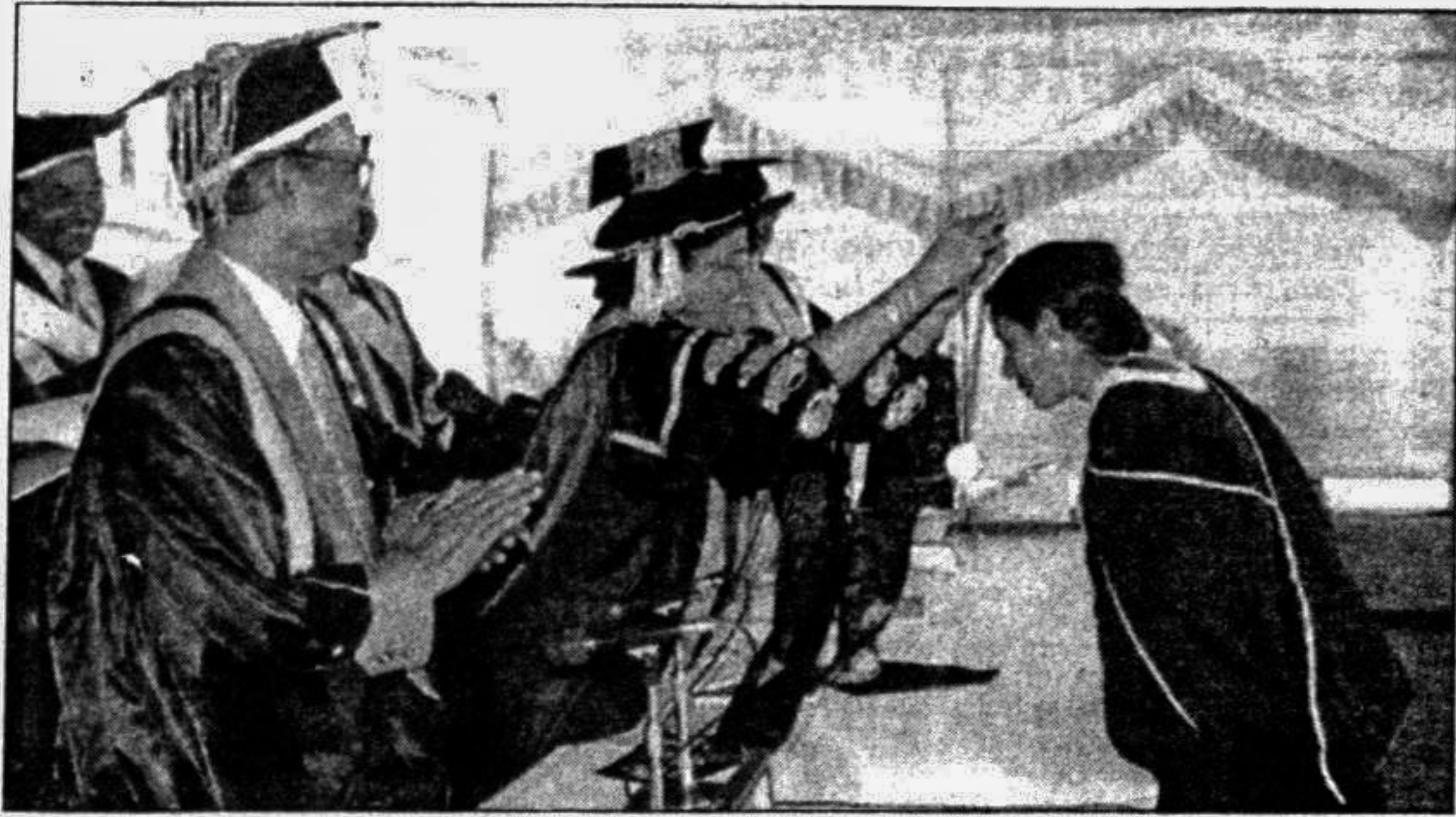
Prime Minister Sheikh Hasina distributed Gold Medals among meritorious graduates at the second convocation ceremony of the Islamic University in Kushtia yesterday.