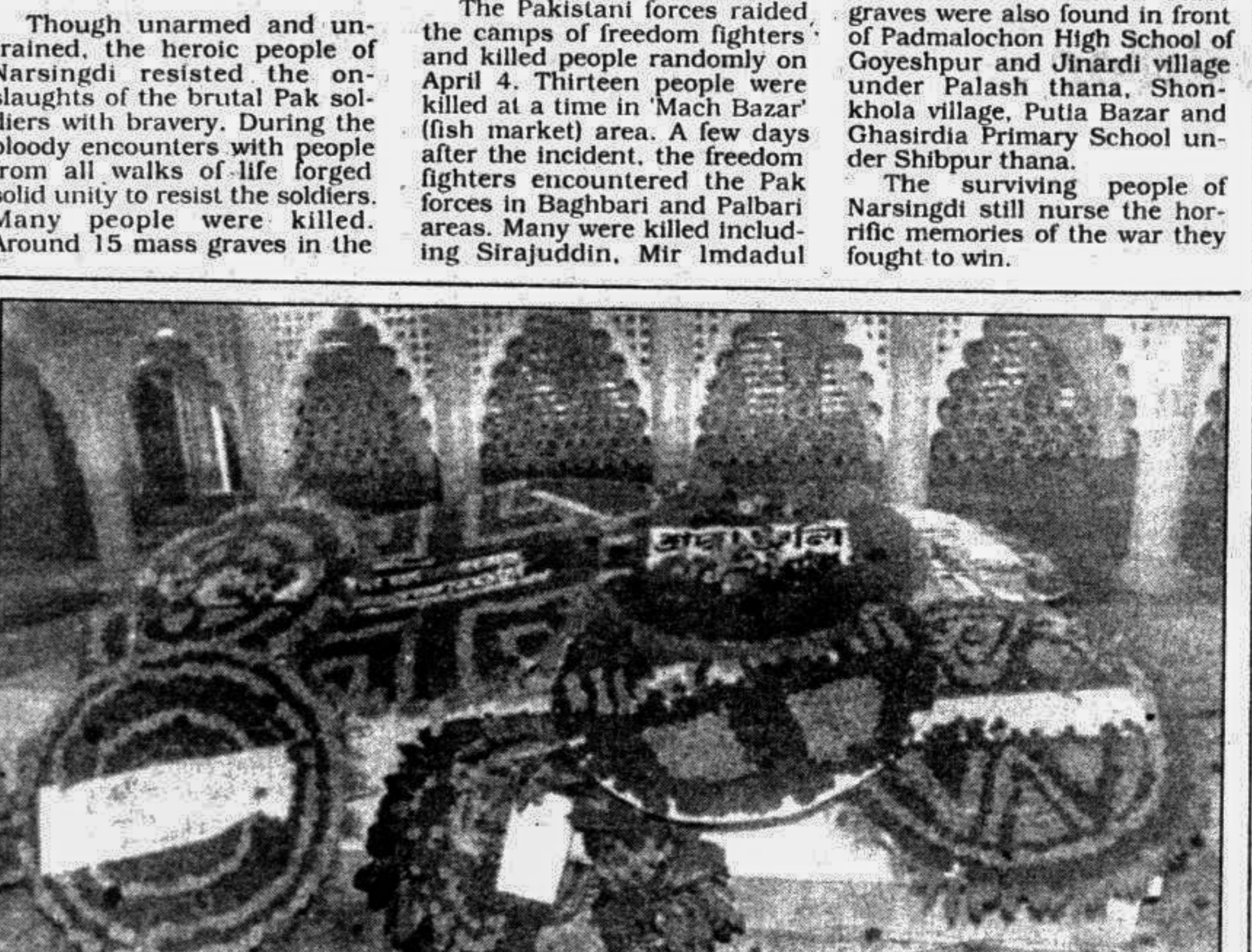
The mazar of Hossain Shaheed Suhrawardy lay strewn with wreaths yesterday, on his 36th death anniversary.

The surviving people of Narsingdi still nurse the horrific memories of the war they fought to win.