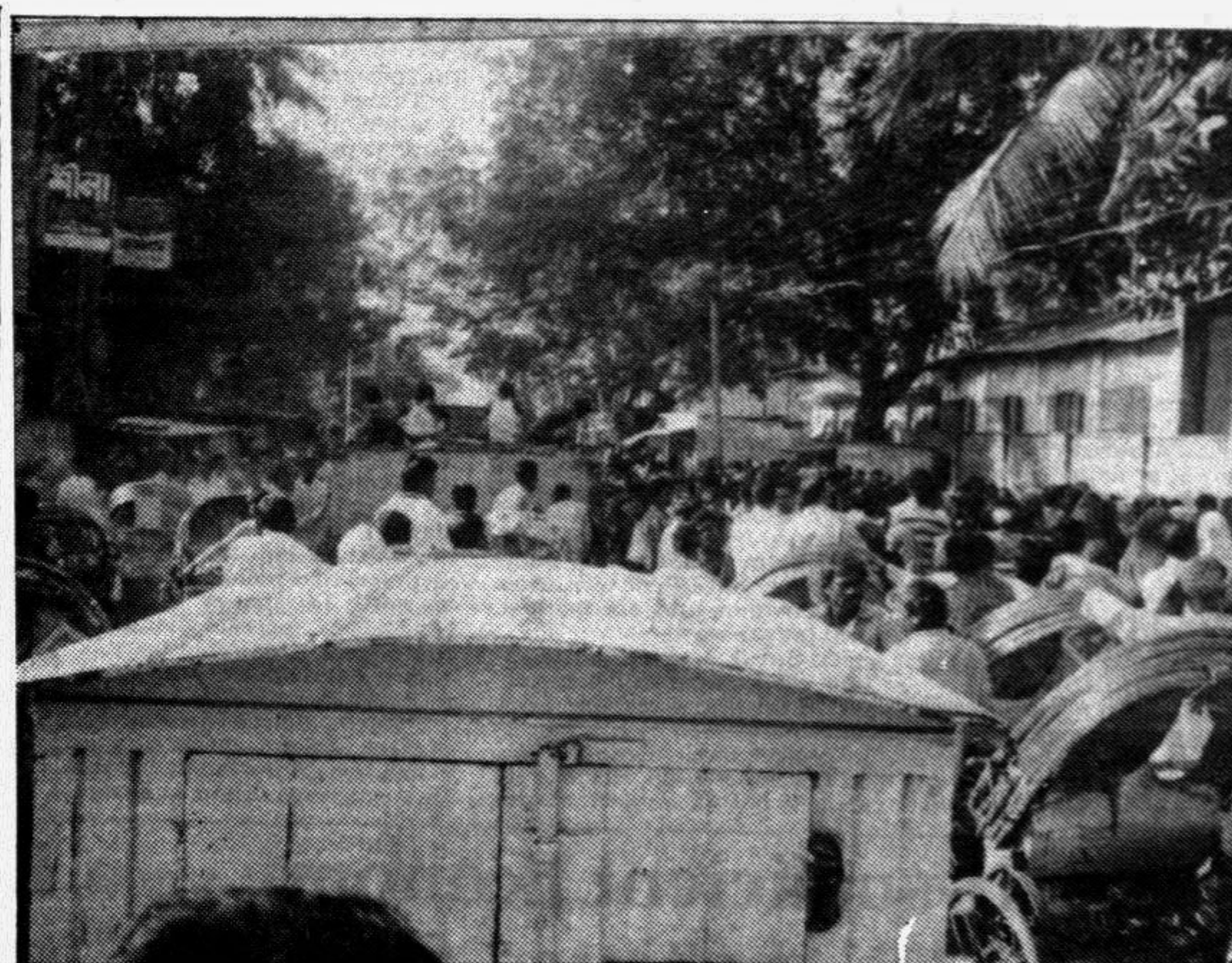
Traffic jam in front of Sabujkanan Preparatory and High School on Mujib Sarak in Sirajganj town is a regular feature. As a result the road is blocked for traffic creating problem for school students, their guardians and passers-by.

A big amount of agri-loan has already been disbursed by the Krishi Bank among the farmers, a bank source said.