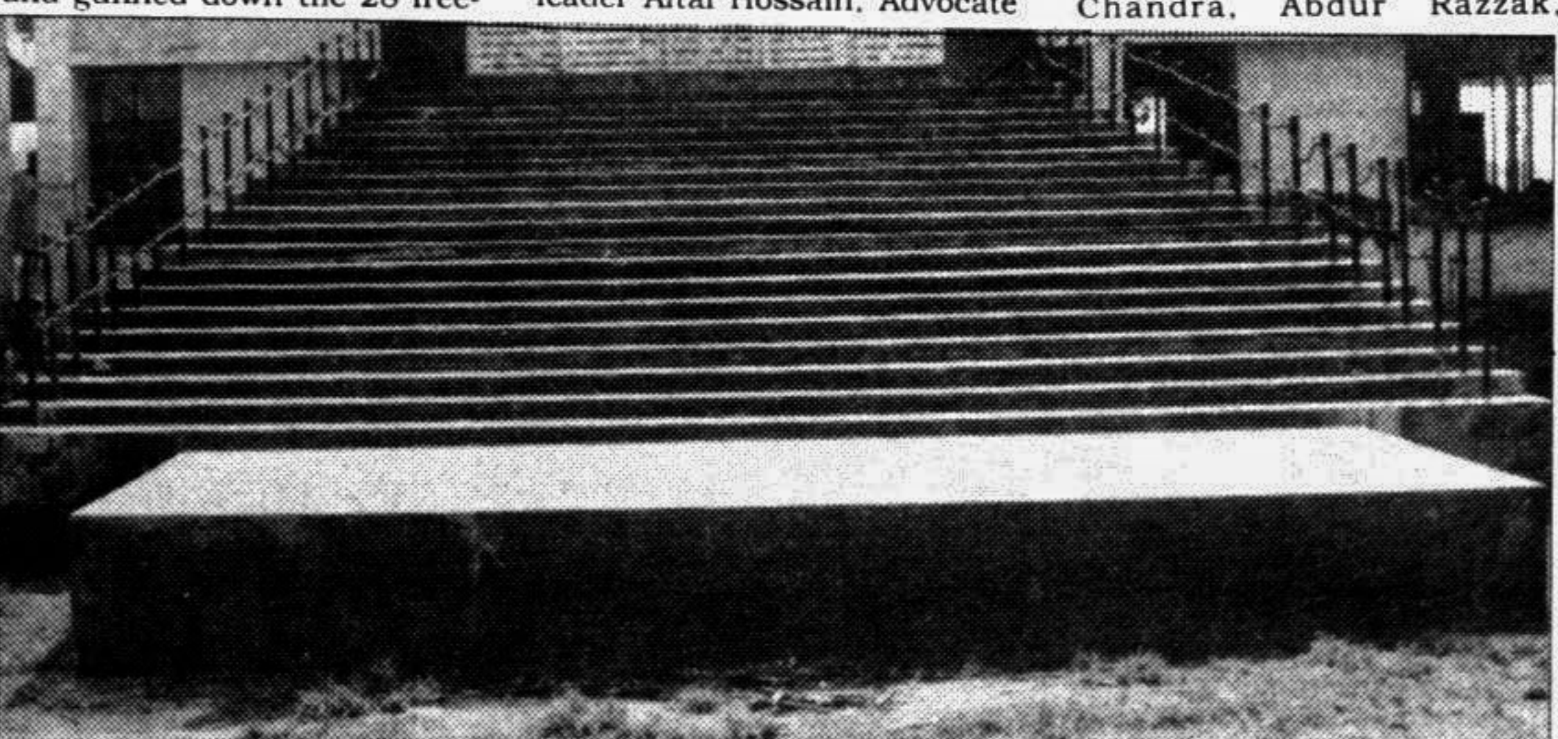
Monument in memory of Kamanna martyrs.