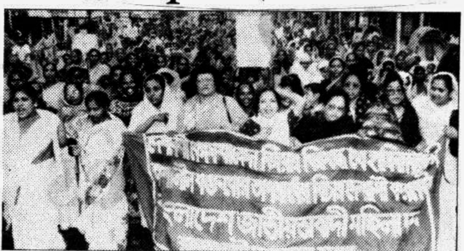
Bangladesh Jatiyatabadi Mohila Dal arranged a protest rally recently at Saheb Bazaar Mani square in Rajshahi.