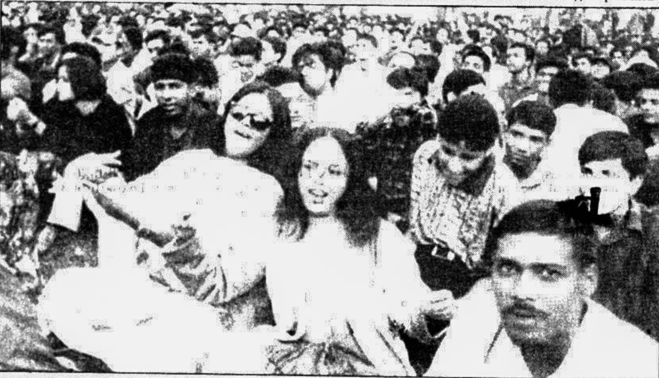
A section of the gigantic crowd at the Benson &amp; Hedges Twist &amp; Shout concert

It was really a great teamwork by Benson & Hedges and Antar Showbiz Limited - they were really able to make the audience 'Twist & Shout' all the way long.