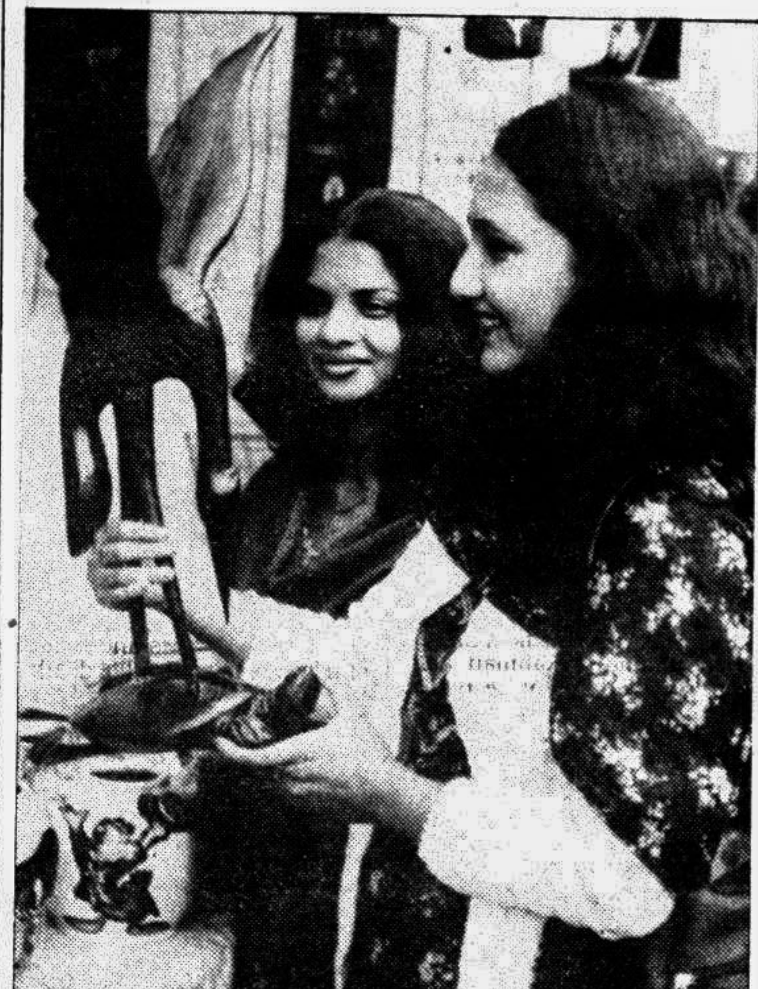
Visitors at the Rudra Mela