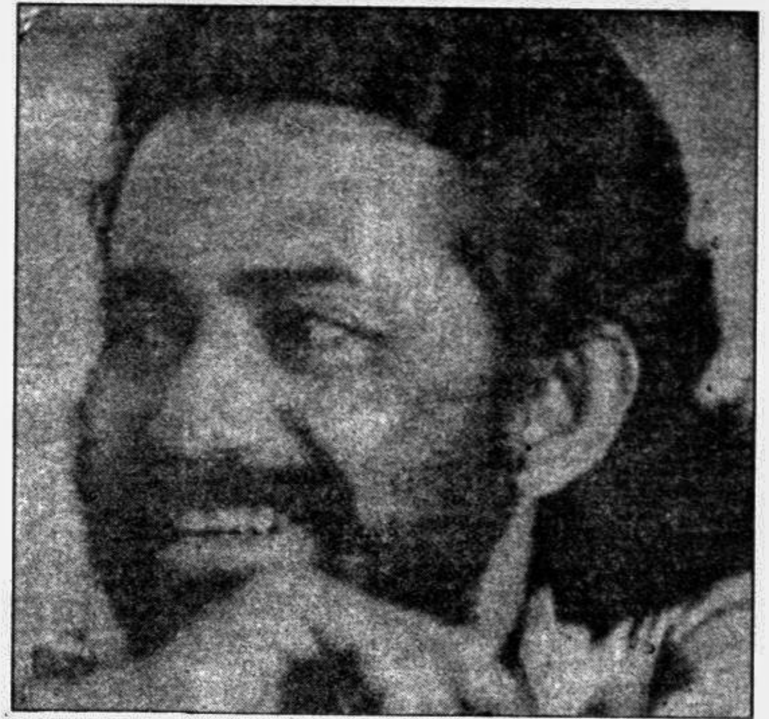
Rudra Muhammad Shahidullah

Ever since his untimely death, Rudra mela has become a part of the nation's curriculum every year. Organised by a few close friends and his family, it serves as a reminder of the poet who left behind a trail of memories.