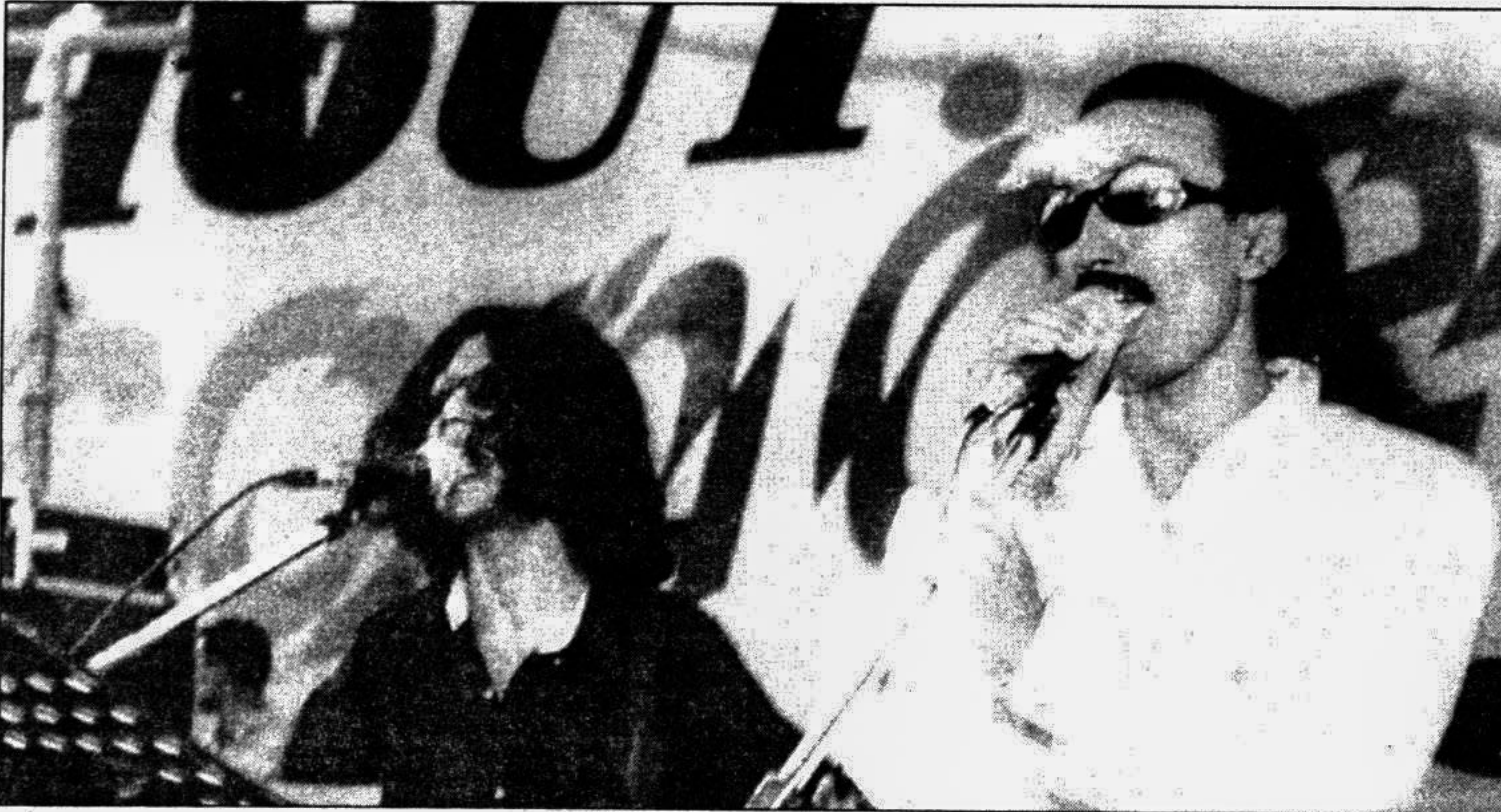
Dreamland performing at the Twist &amp; Shout concert

The next to come was Miles. It was a great day for them as well, they were celebrating their 20th anniversary. They took the stage very cheerfully and started off with Jala Jala . They sang Tomar Chokhe Amar Sesh