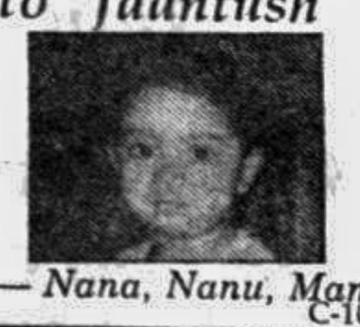
— Nana, Nanu, Mama