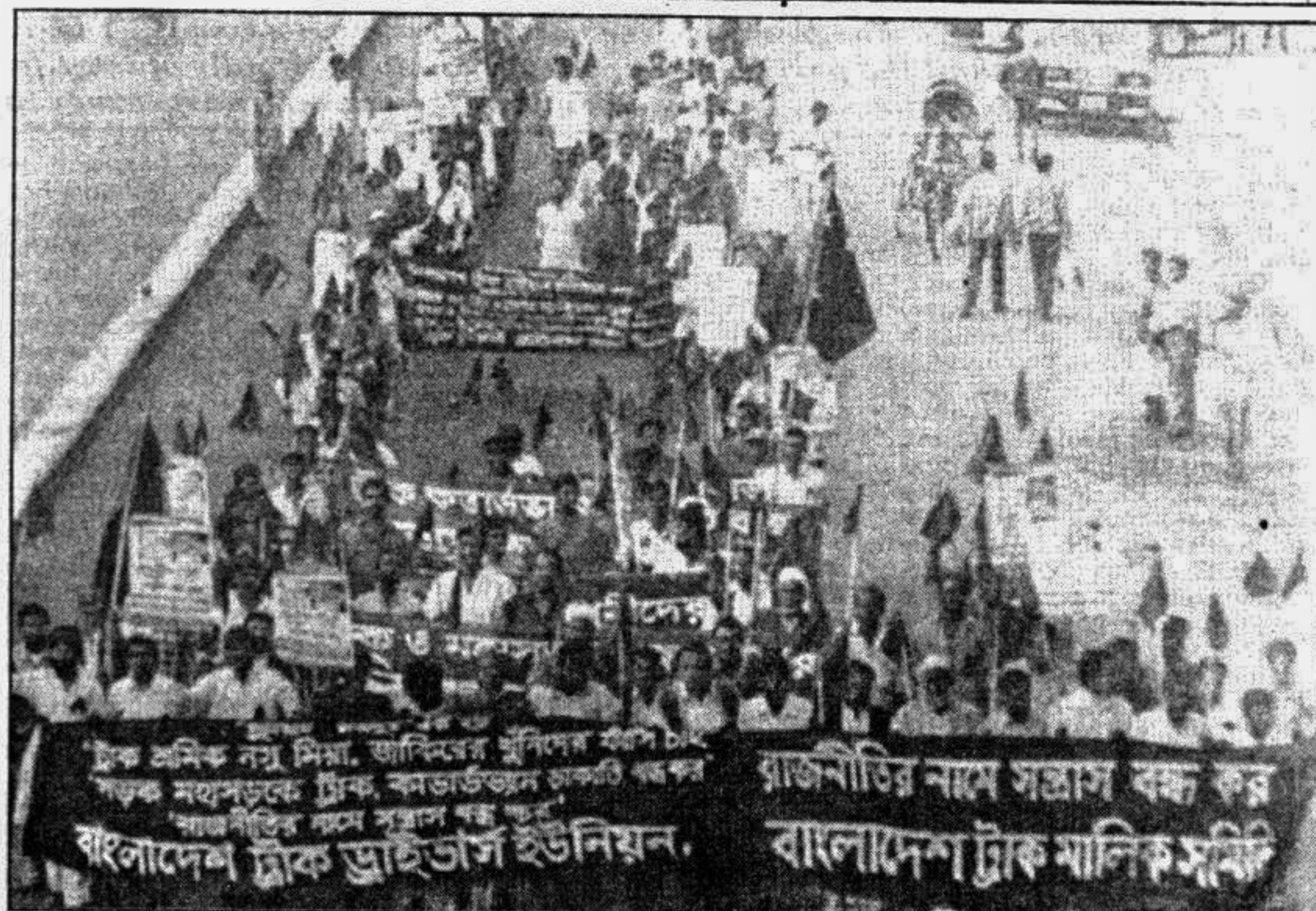
Bangladesh Truck Drivers' Union and Bangladesh Truck Owners' Association jointly brought out a procession in the city yesterday to protest against the opposition alliance called hartal in the city today and tomorrow.