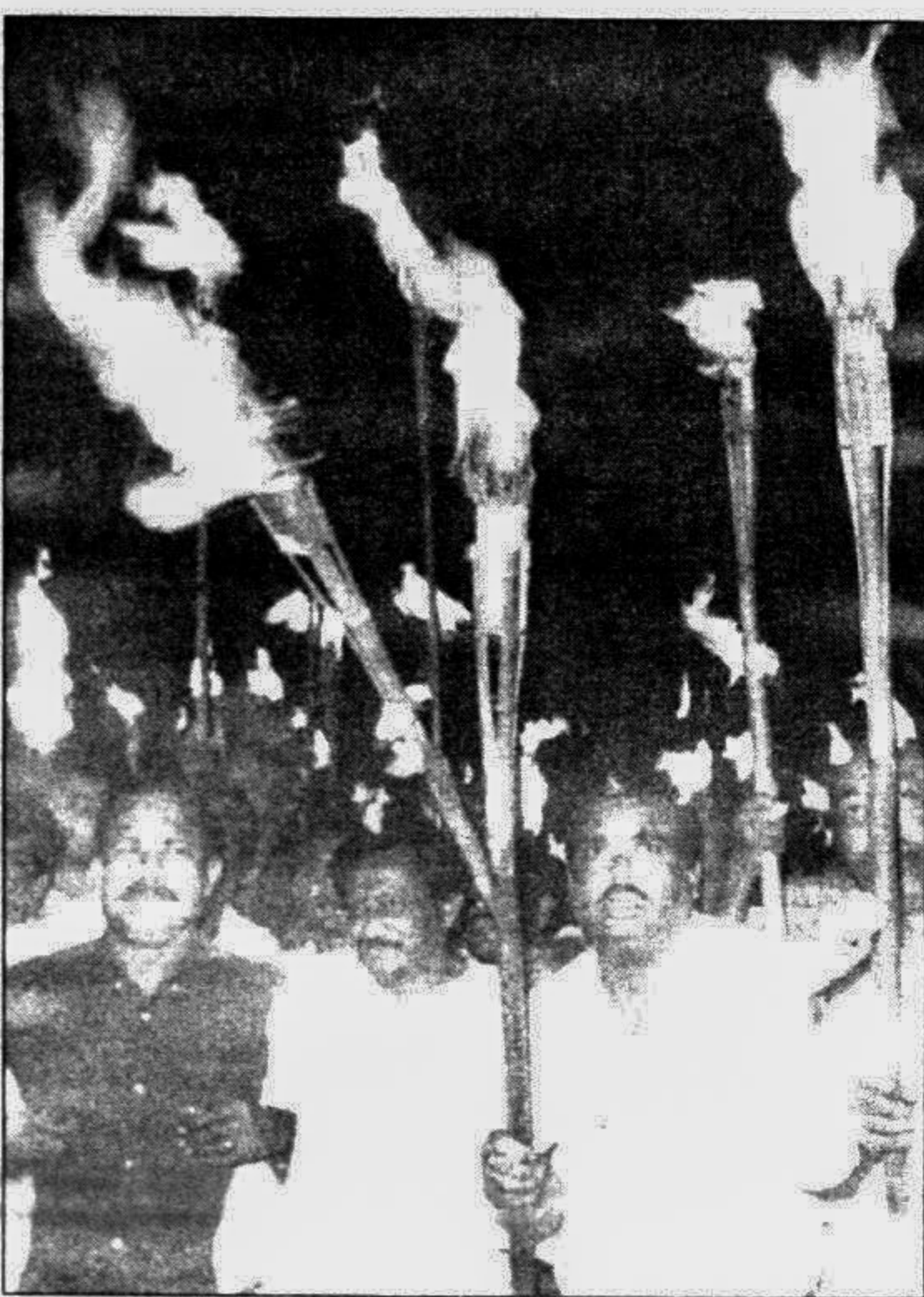
BNP brought out a torch procession in the city yesterday in support of hartal.