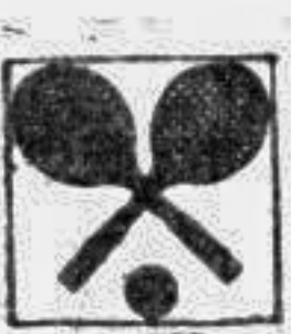
Cup final against France this weekend, reports Reuters.

"I woke up this morning with this feeling in my gut that it's our destiny to win," the Australian captain said on Thursday after the draw.