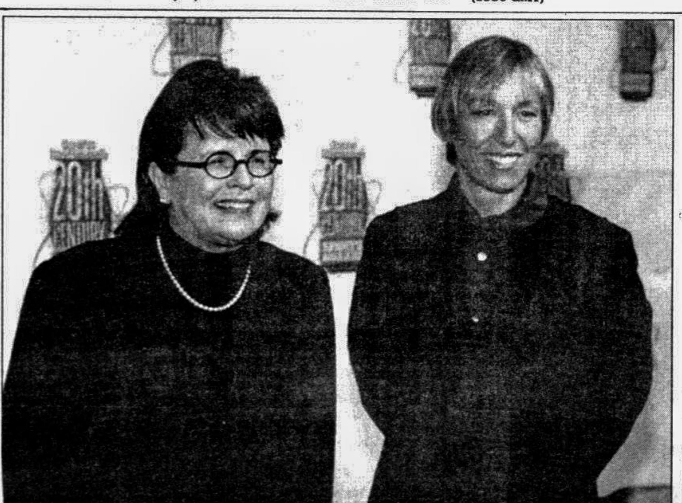
Tennis greats Billie Jean King (L) and Martina Navratilova pose during the Sports Illustrated Sports Awards ceremony at the Madison Square Garden.

Sunday: Bari v Piacenza, Inter Milan v Udinese, Parma v Torino, AS Roma v Lecce, Venezia v Reggina, Verona v Cagliari, Fiorentina v AC Milan (1930 GMT)