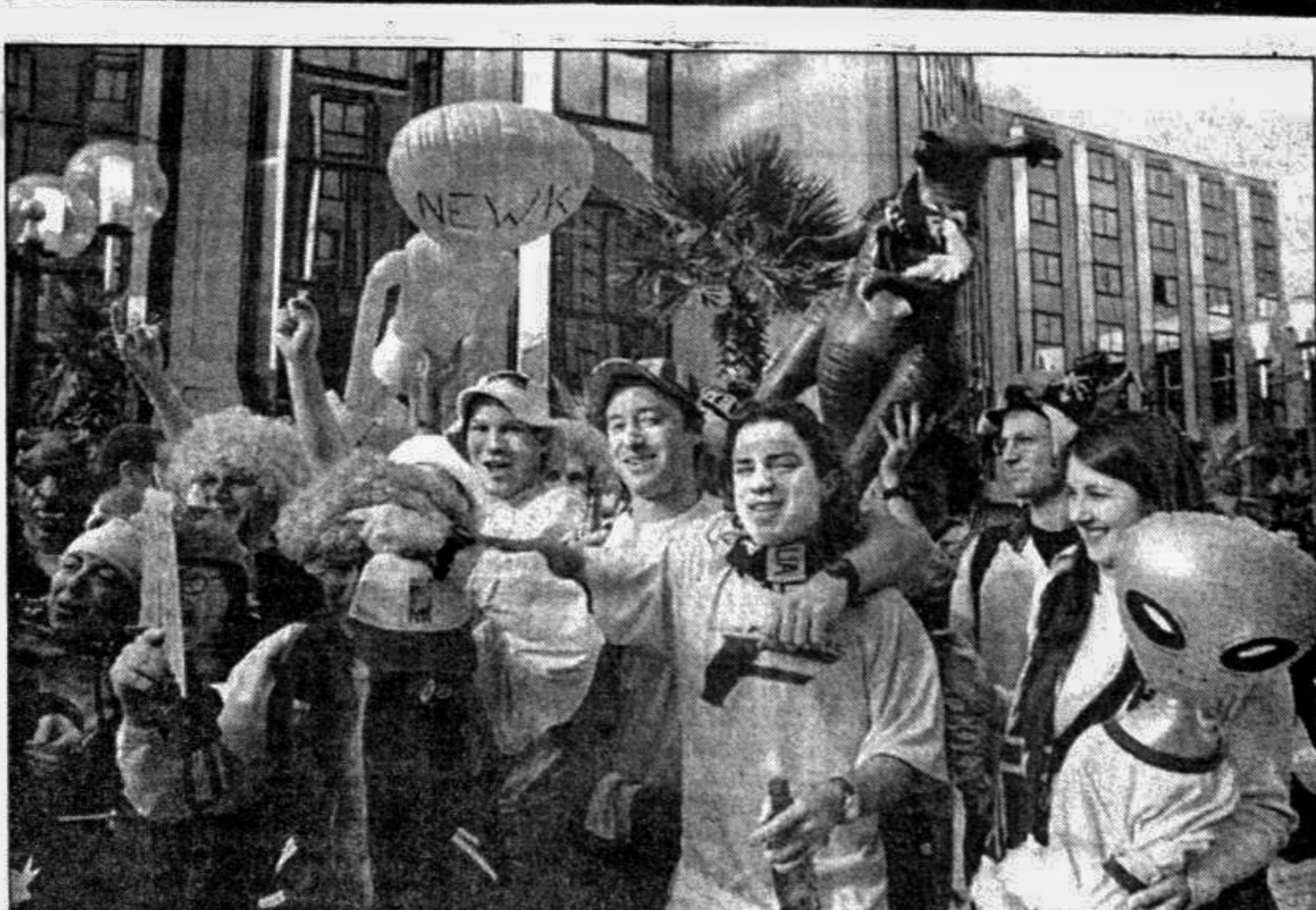
Cheerful Australian supporters heading towards the Exhibition Palace Stadium in Nice to witness the inaugural day's matches of this year's Davis Cup final against hosts France yesterday.

"But I'd prefer if we had to play three sets (rather than the Senior Tour's two) - it would separate the men from the boys. Give us more of a test."