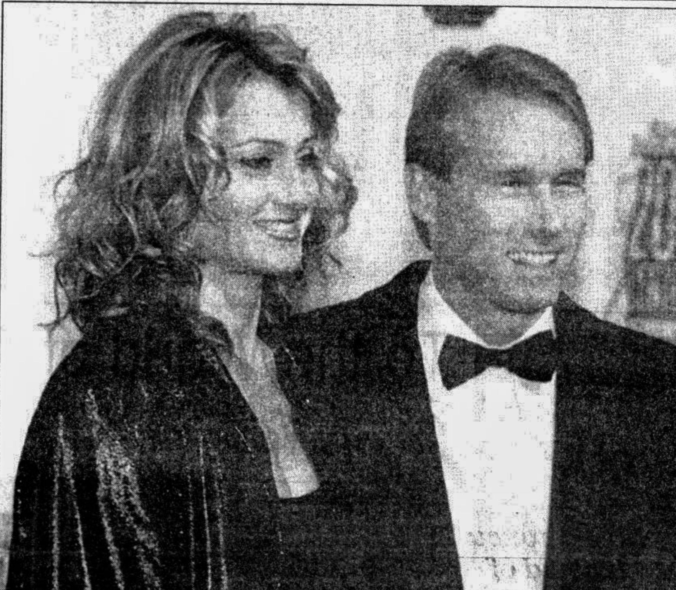
Nadia Comaneci and her husband Bart Conner arrive at the Madison Square Garden in New York to attend the Sports Illustrated 20th Century Sports Awards function on December 2.

Sunday's reverse singles: Pioline v Philippoussis Grosjean v Hewitt