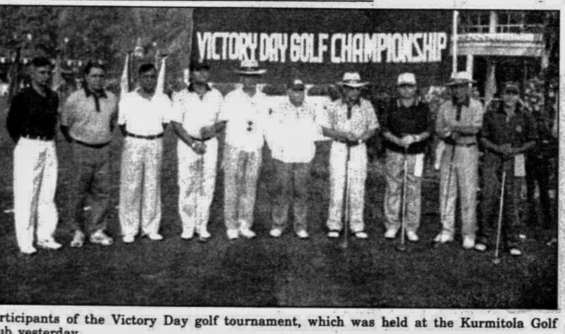
Participants of the Victory Day golf tournament, which was held at the Kurmitola Golf Club yesterday.