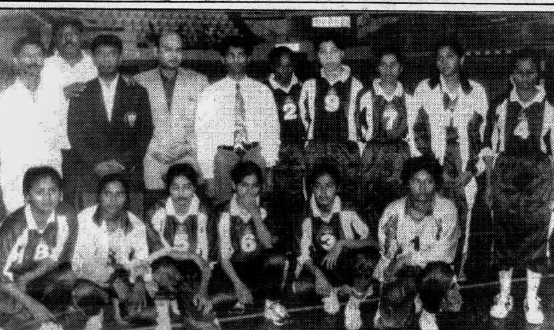
Players and officials of the Arambagh Krira Sangstha, who emerged champions in the Sheetal First Division women's handball league yesterday.