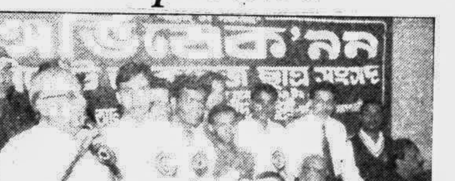
Students are our future leaders: Jatiya Sangsad Speaker Alhaj Humayun Rashid Chowdhury speaking as the chief guest at the installation ceremony of Sylhet Law College Students' Union last week.