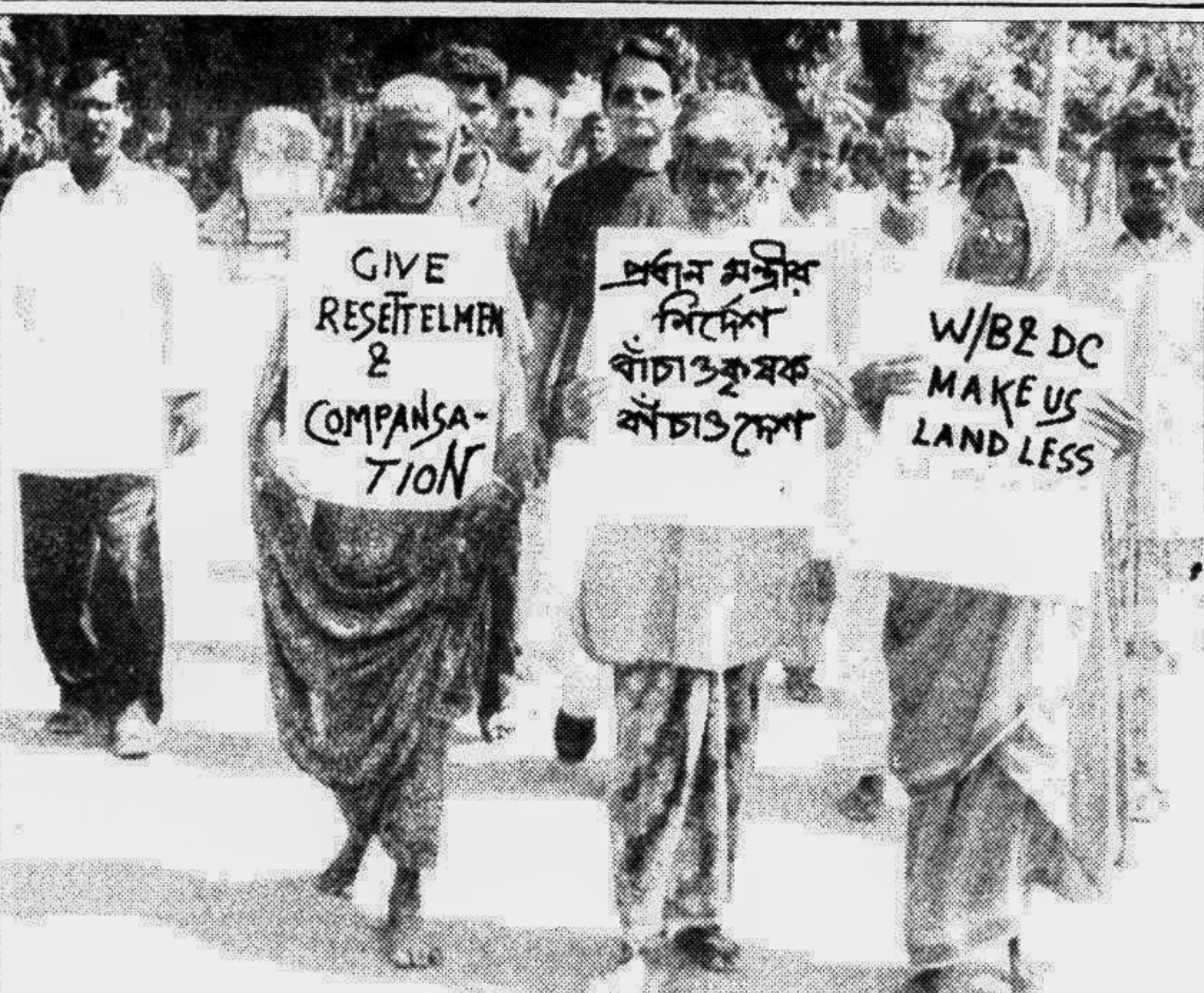
Compensation demanded: Siraganj district administration acquired a vast tract of land from 137 families four years ago for Siraganj town protection embankment project financed by World Bank. But the affected families are yet to get compensation from the authorities concerned. Photo shows members of some affected families demonstrating recently for compensation.

Later, the Home Minister unveiled another multi-storied hospital building at the Sardah police academy here.