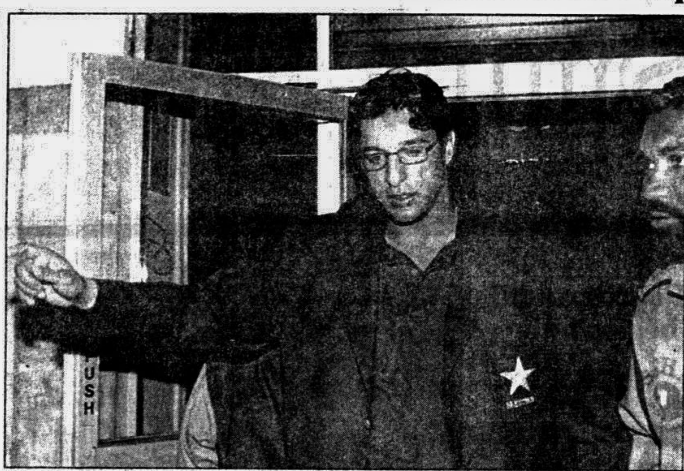
Pakistan cricket captain Wasim Akram upon his arrival at the Lahore airport early yesterday.