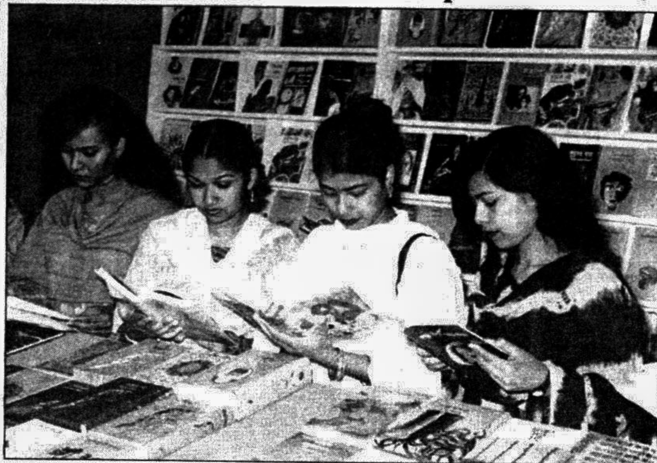
Visitors at the 6th Dhaka Book Fair '99 after its inauguration at Sher-e-Bangla Nagar yesterday.

BRAC Information Technology Institute University Building, 66 Mohakhali C/A, Dhaka-1212. Phone : 9881265, 8824051, 8824180 E-mail: fcbiti@bdmail.net