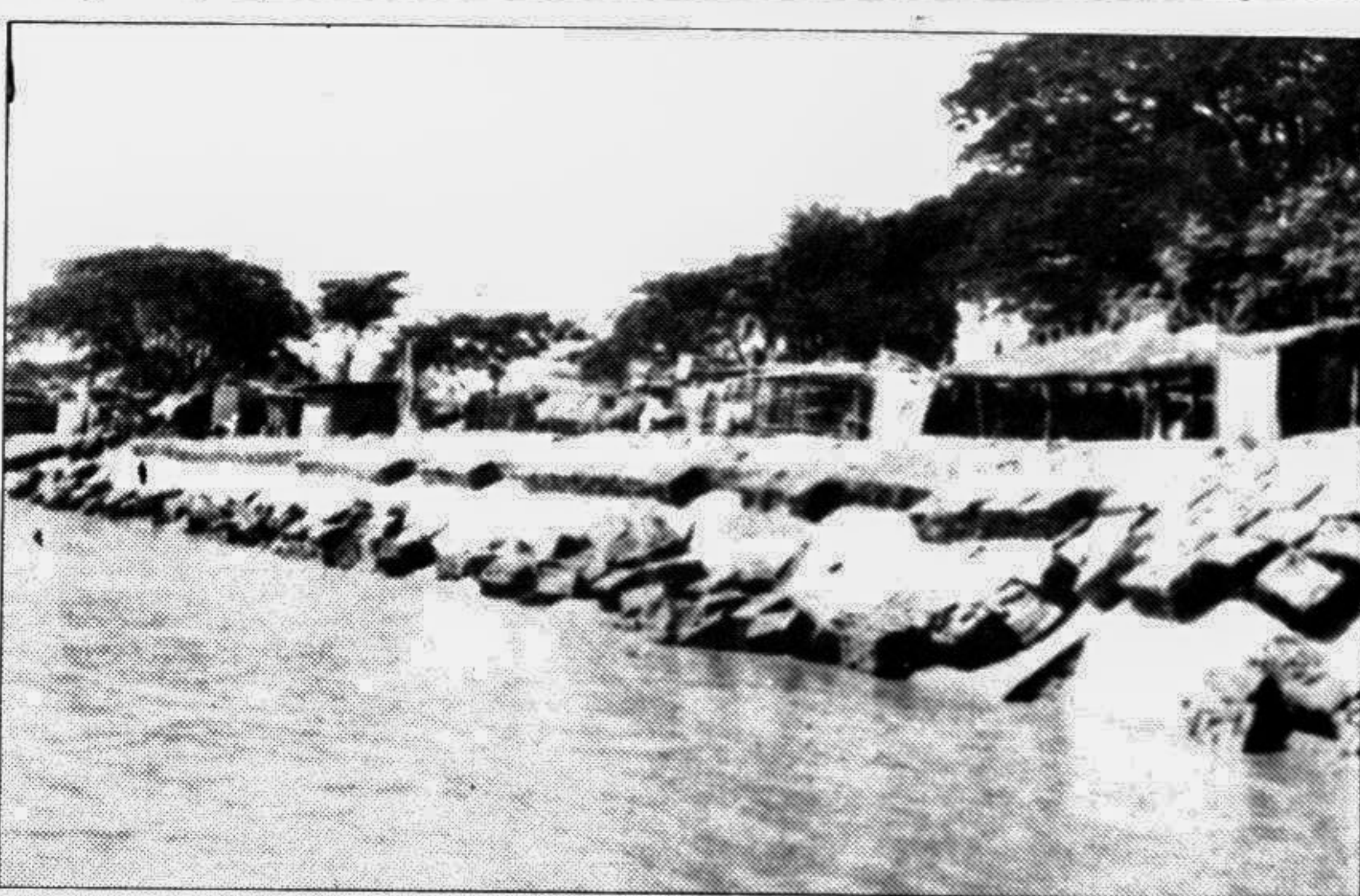
Rajshahi Town Protection Embankment is threatened again due to fresh erosion by the River Padma. This is due to sharp fall in the water level of the mighty river. The embankment was renovated during the last rainy season. This photograph was taken from the Dargahpara area in the city last week.