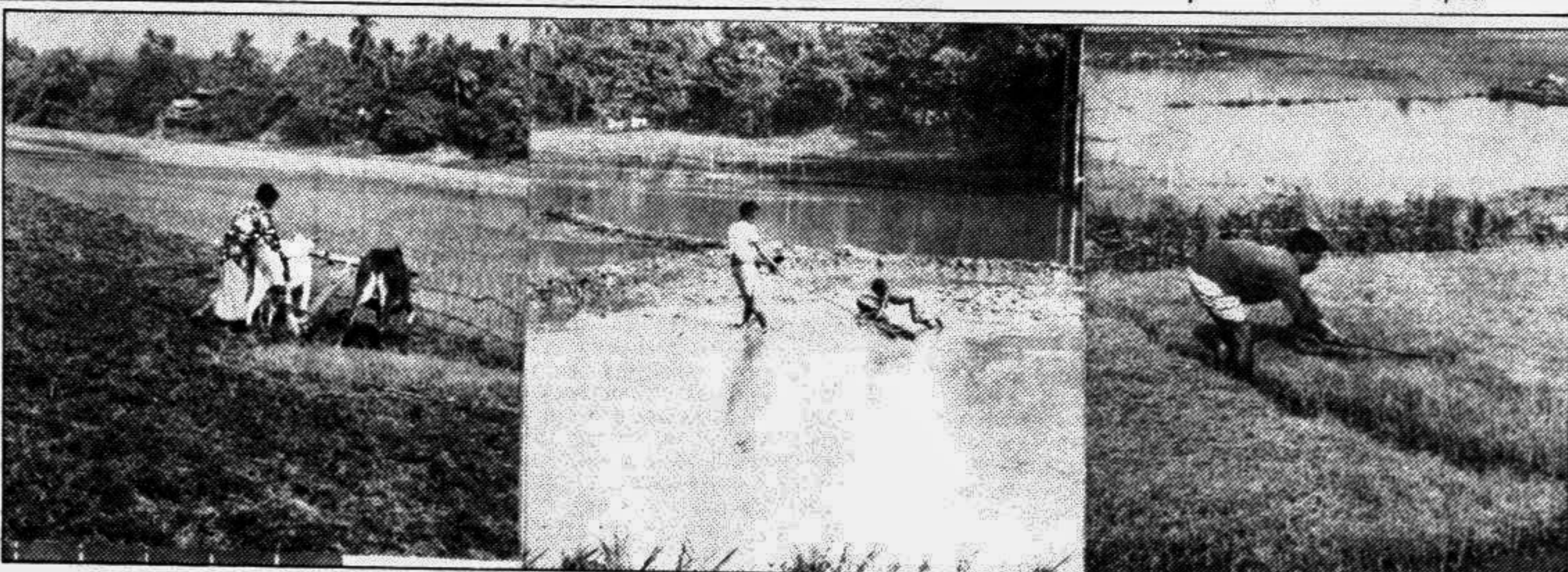
Now hectic preparation has been going on for Boro farming in Jhenidah district. Photo shows (L-R) a farmer ploughing his land, another one preparing the land following its ploughing and the third one cleaning seedbed from dew drops.