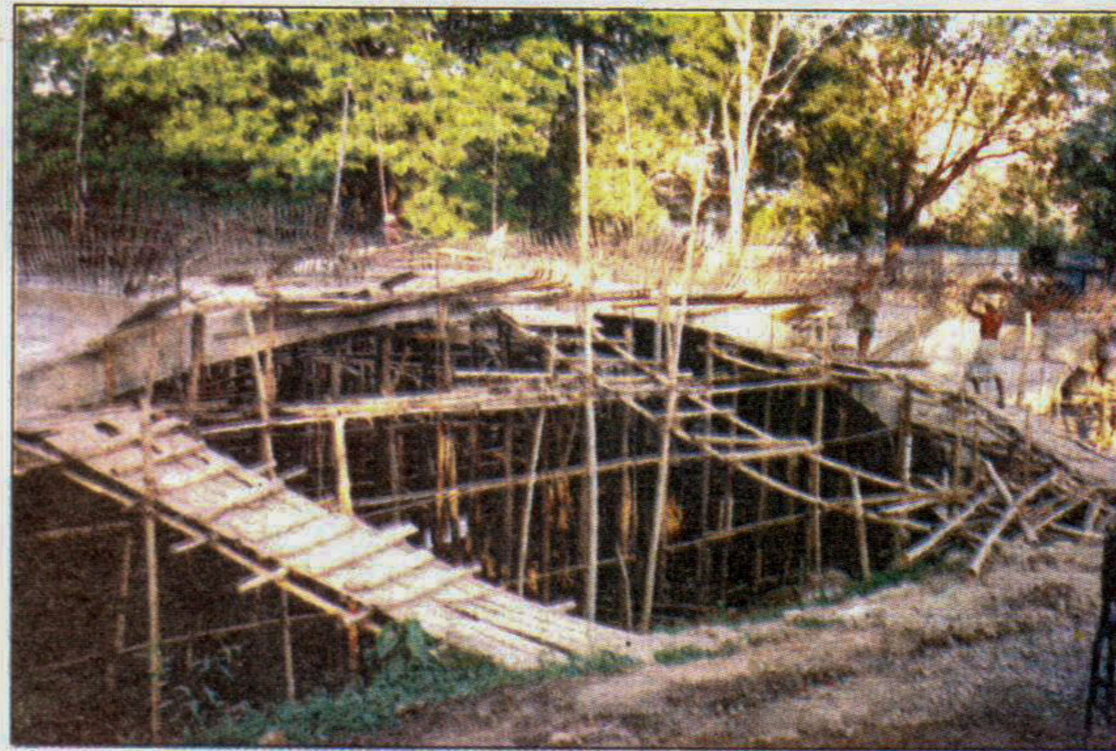
The under-construction bridge over Dhanmondi Lake at Road-8.