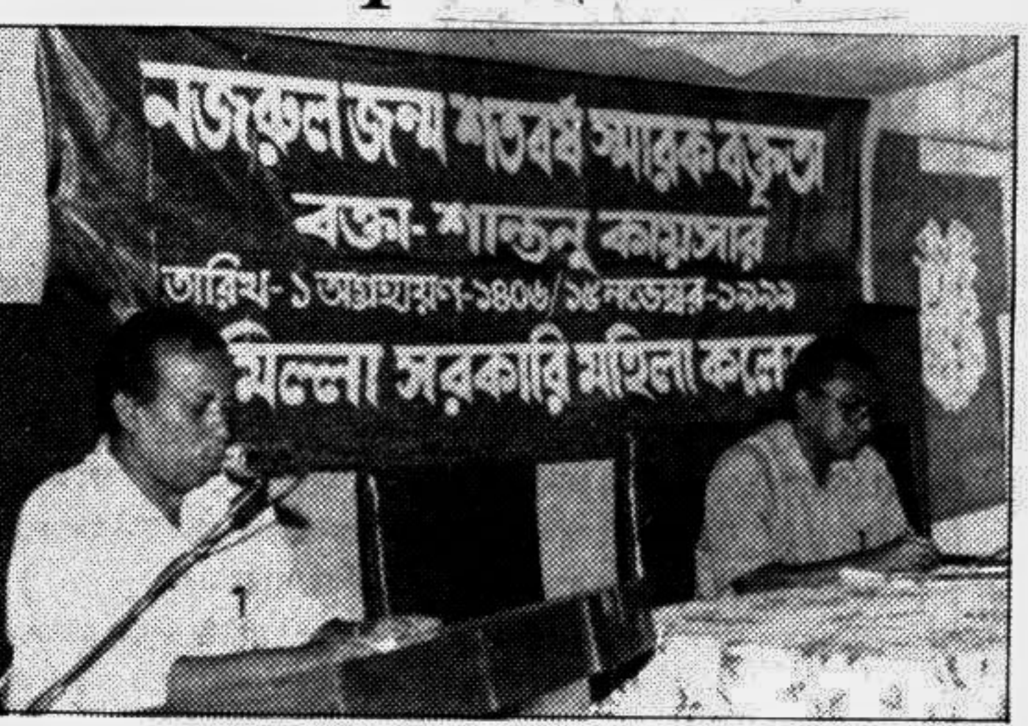
Poet Nazrul Birth Centenary Memorial Lecture is progressing in Comilla Government Women's College.