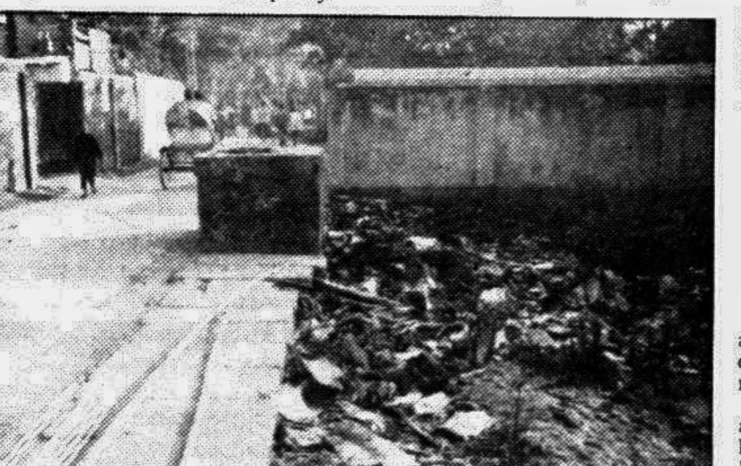
A dirty area near Sirajganj thana in Sirajganj municipality.

The roads and streets which were damaged badly during the