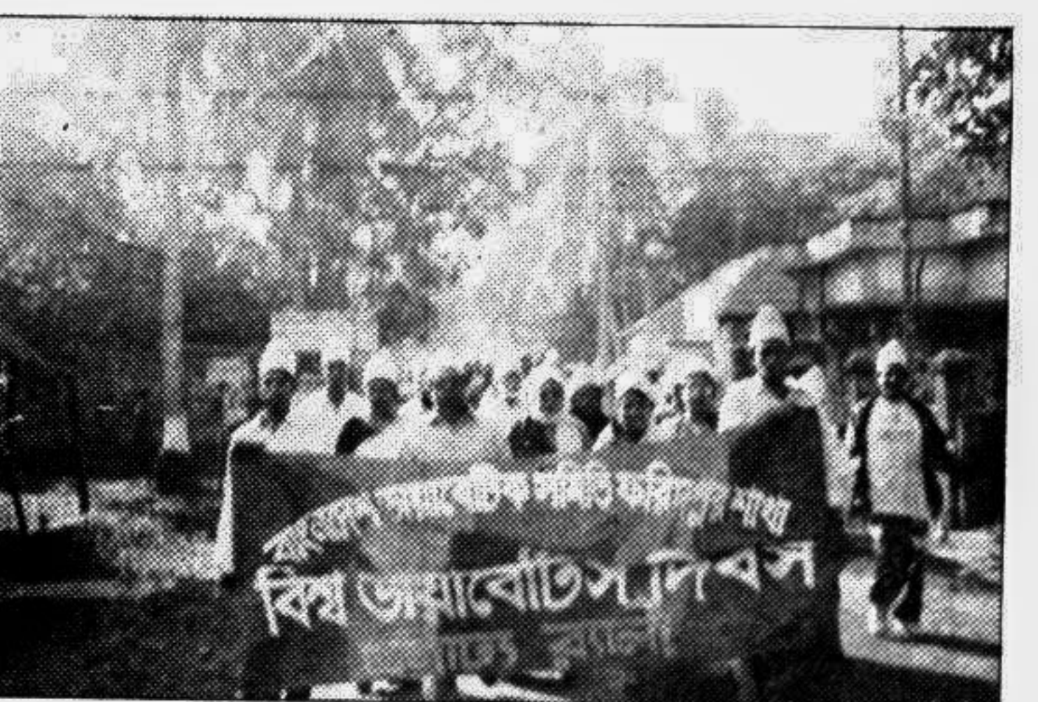
A colourful procession was brought by Faridpur unit of Bangladesh Diabetes Samity in Faridpur town recently in observance of World Diabetes Day.