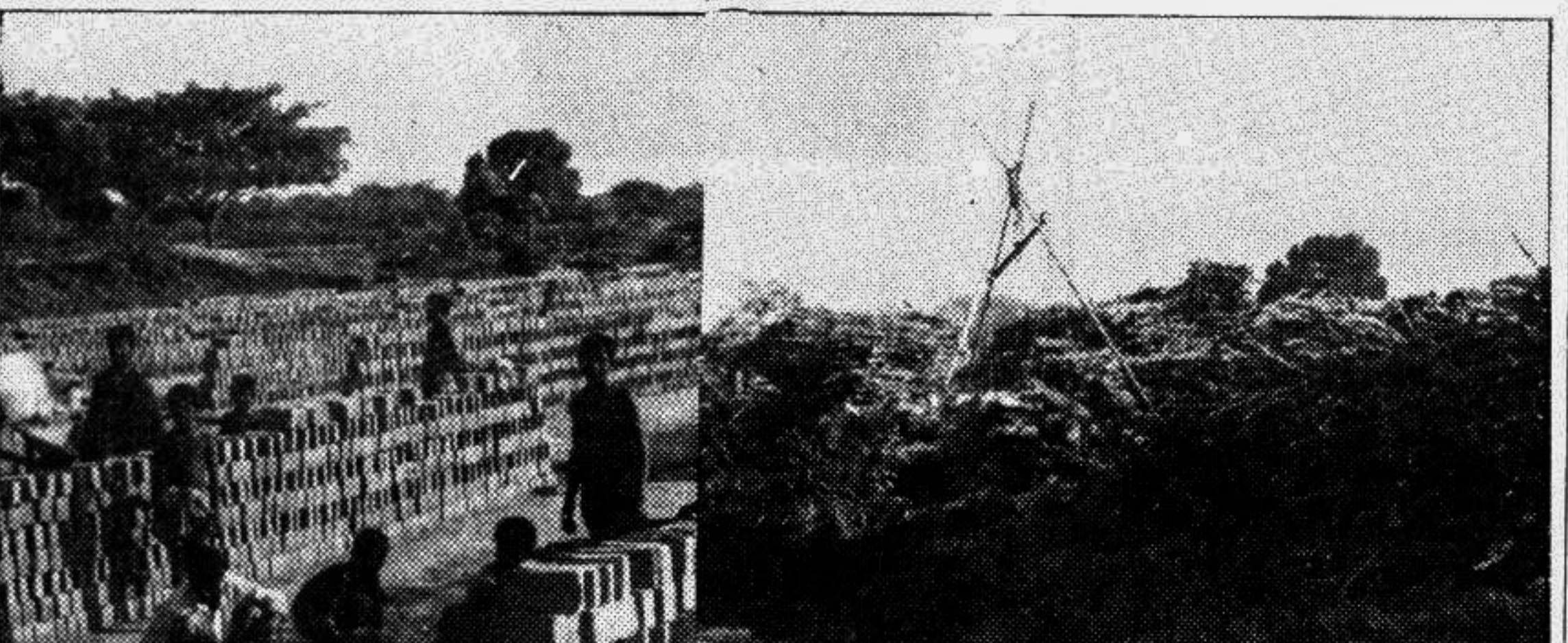
A brickfield in Magura. (L-R): Stored up kutch bricks awaiting burning and fuel wood being piled up for burning due to shortage of coal.

They have urged the authorities concerned to take immediate steps to stop use of wood as fuel in brick fields.