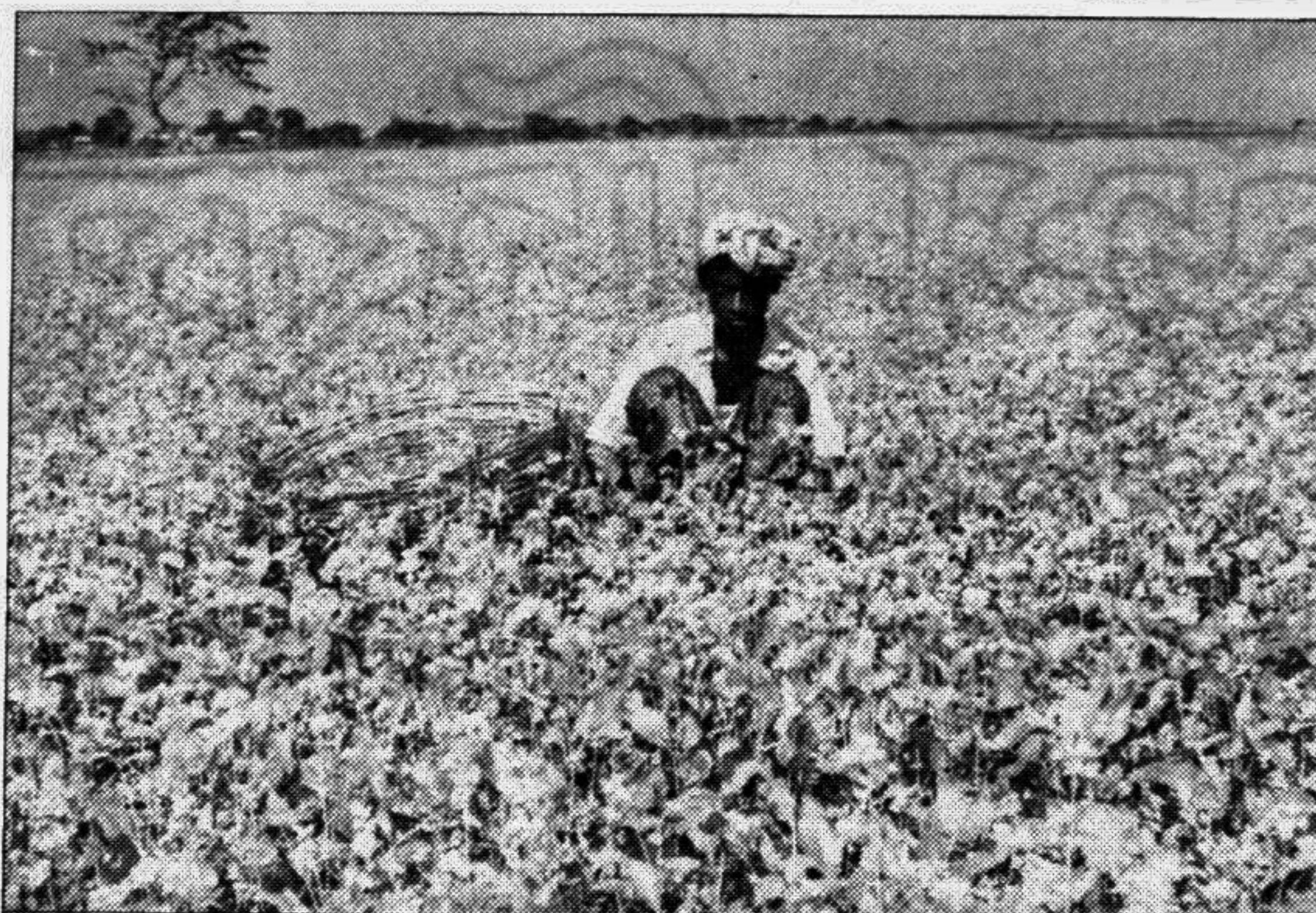
A field of 'Sonali Sharisa'.

NATORE, Nov 30: A court here on Monday sentenced a man to 20 years of rigorous imprisonment (RI) in absentia in two cases, reports UNB. The convict was identified as Sirajuddin of Amhati village in Sadar thana. The judge awarded 10 years RI to Siraj and fined Tk 1,000, in default, to suffer another one-year imprisonment for making liquor. He was also sentenced to another 10 years RI and fined Tk 1,000, in default to suffer one-year more imprisonment for possessing equipment to make liquor. According to the prosecution in brief, an anti-drug taskforce of Narcotics Control Department of Rajshahi region raided the house of Siraj and recovered 110 litres of local-made wine, 20 litres of liquor and some equipment on July 25, 1995.