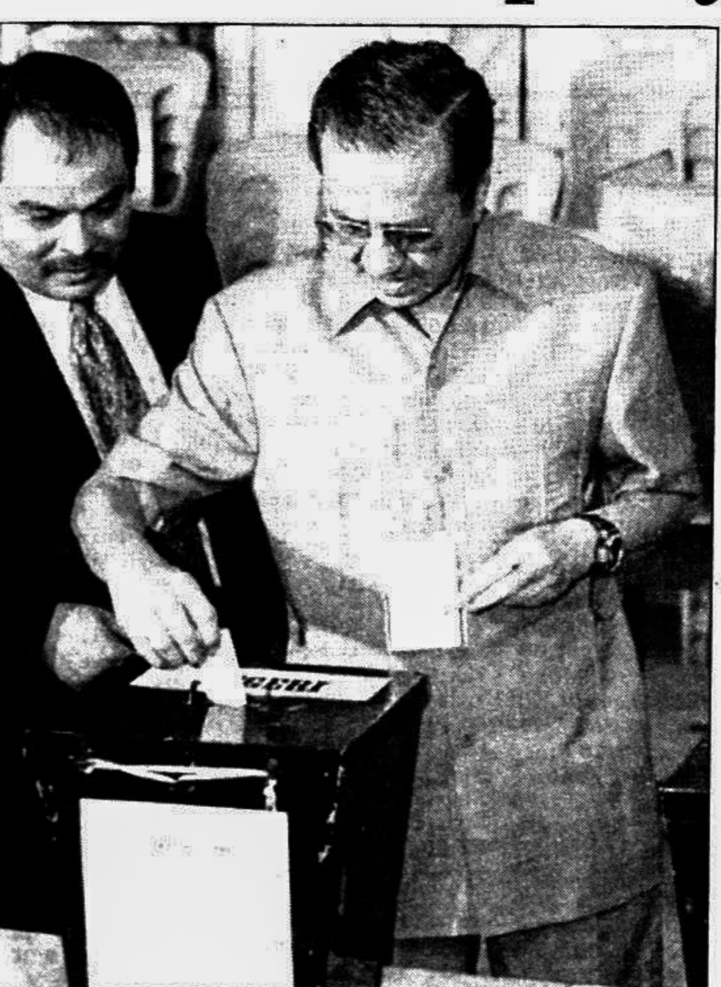
Malaysian Prime Minister Mahathir Mohamad casts his vote at a polling station near his residence in his home state of Kedah, Malaysia yesterday.

KUALA LUMPUR, Nov 29: Prime Minister Mahathir Mohamad's ruling coalition today took an early lead in Malaysia's bitterly contested general election, but the Islamic opposition made inroads into the Malay heartland, reports Reuters. Mahathir's 14-party Barisan Nasional coalition won 56 of the first 65 races, all in the prime minister's stronghold states of Sabah and Sarawak on Borneo island, the Election Commission said. The 73-year-old Mahathir, Asia's longest serving elected leader, was expected to retain a majority and win an unprecedented fifth term as prime minister. At least 97 seats are needed to win a majority in the 193-member lower house of parliament. But the four-party opposition coalition, united behind Mahathir's jailed former deputy Anwar Ibrahim, was hoping to deny the ruling coalition a two-thirds majority, needed to amend the Constitution, for the first time in three decades. Small parties in Mahathir's multi-ethnic coalition accounted for most of his alliance's early victories in Sabah and Sarawak, where the Barisan Nasional controlled 38 of 48 seats in the outgoing federal parliament. Three government ministers — agriculture, energy and science — won re-election. The opposition Democratic Action Party (DAP) won the